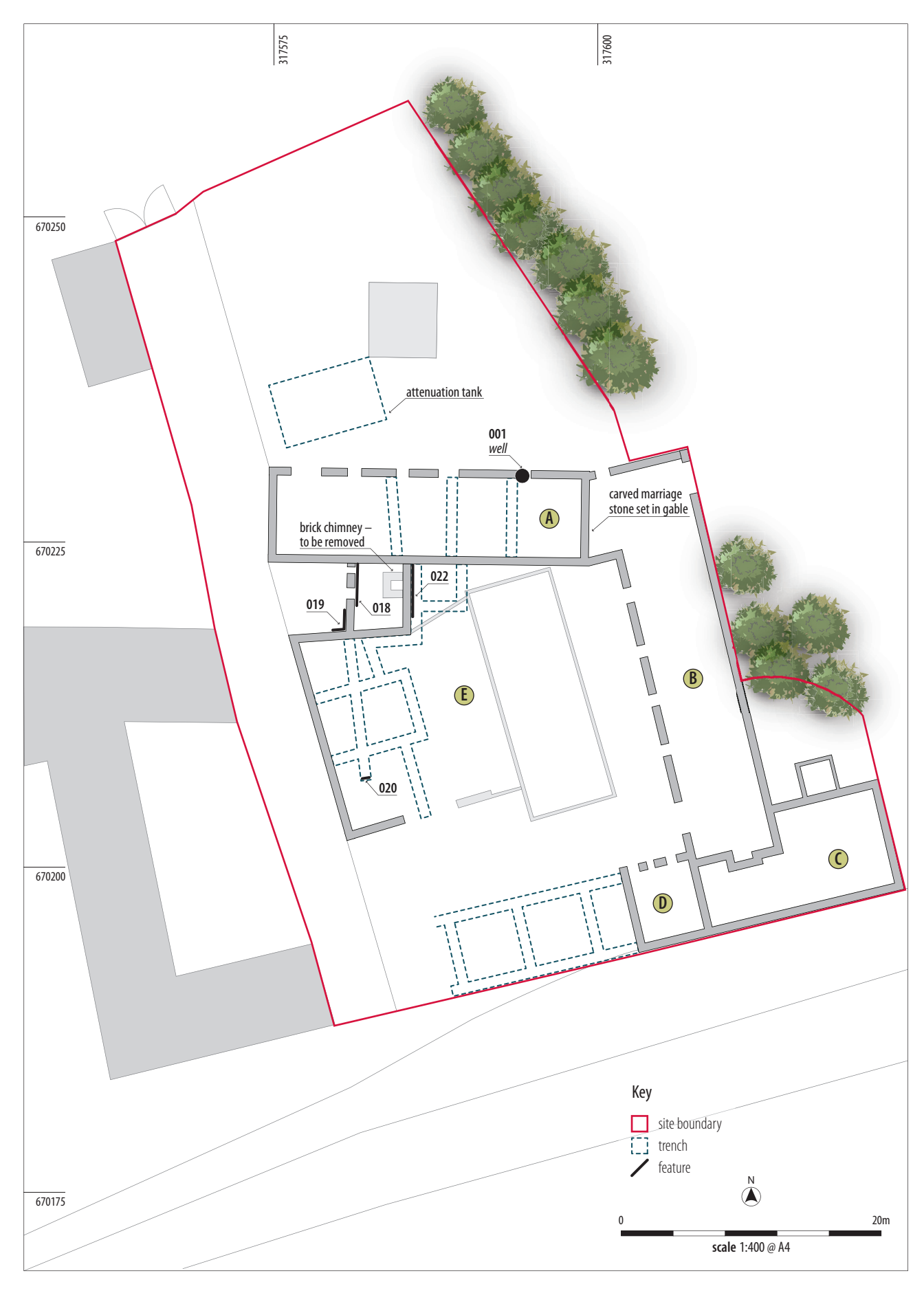
Illus 2 Plan of recently demolished building foundations and trench locations