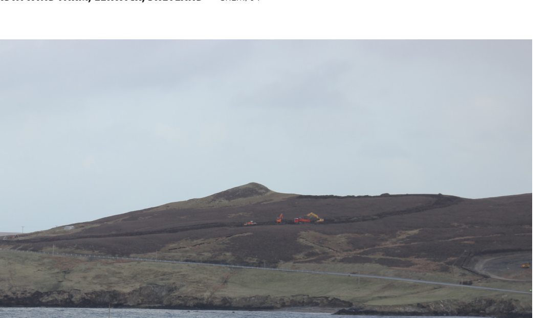
ILLUS 2 View across Dales Voe towards access road and Luggie's Knowe. Facing southeast