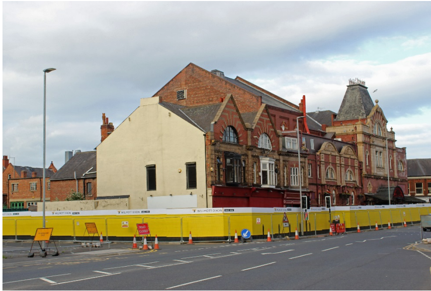
Illus 2 – General view of Darlington Civic Theatre from the south-west. The Parkgate shops can be seen in the foreground, with the box office between these and the main theatre building. The rear of the former fire station can be seen to the far left of the image.