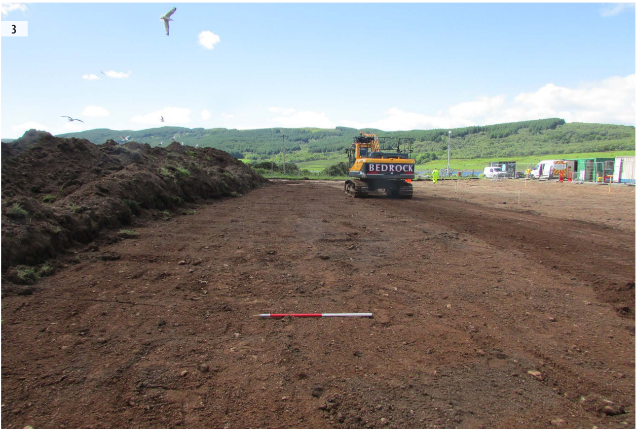
ILLUS 2 View looking east towards cairn 'Colintraive' (NS07SW 1) prior to topsoil stripping ILLUS 3 South facing view across the stripped development area