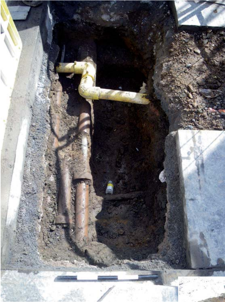
Illus 3 Test pit 6 in Canongate