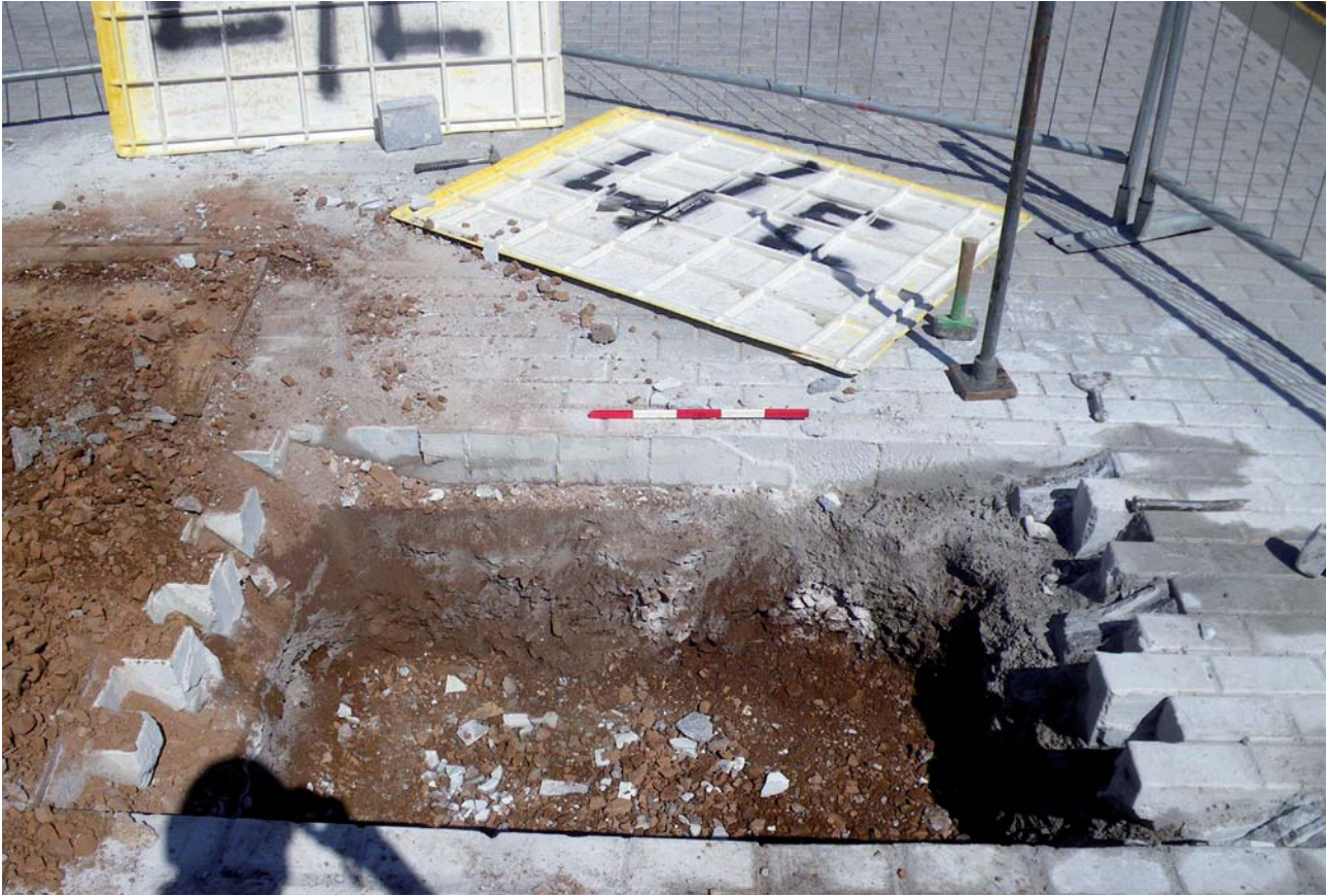
Illus 2 Test pit 4 in Horse Wynd

very recent activity associated with the construction of the Parliament. On the north side the test pits again encountered modern make up and services; in this case probably pre-dating construction of the Parliament.