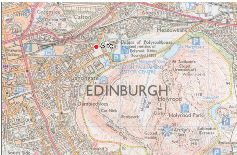
Reproduced using 2002 OS 1:25000 Explorer no 350. Licence no AL 100013329.