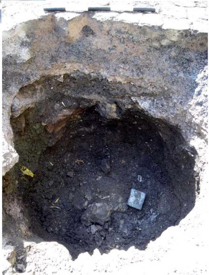
Illus 4 Test pit 9 in Reid's Close