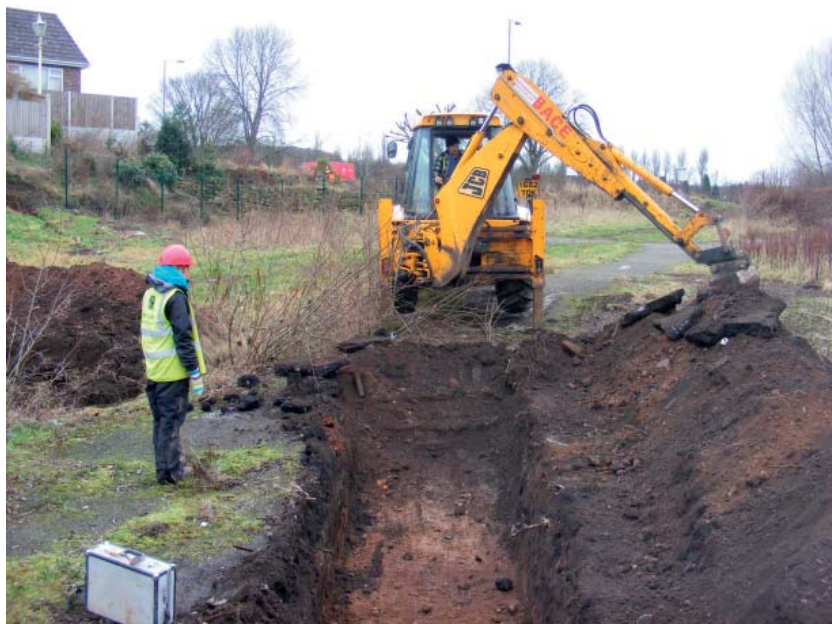
Illus 3 Site 1a