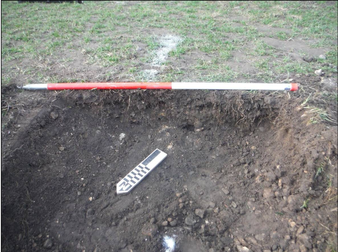
Figure 5. North West facing section through (100), footing for floodlight concrete base (Scale = 1x1m).