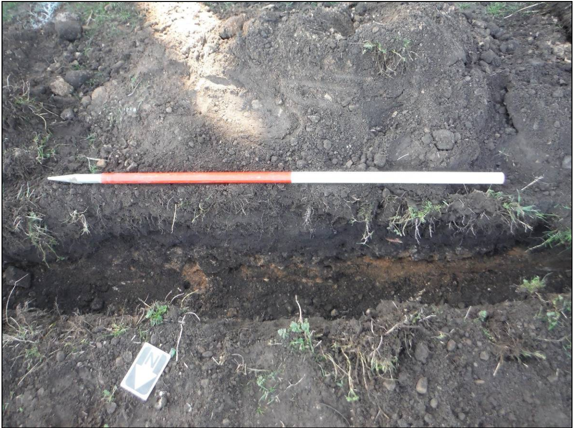
Figure 6. North West facing section through (100) and (101) (Scale 1x1m)