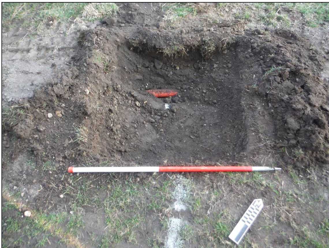
Figure 4. Footing for floodlight concrete base (Scale = 1x1m).