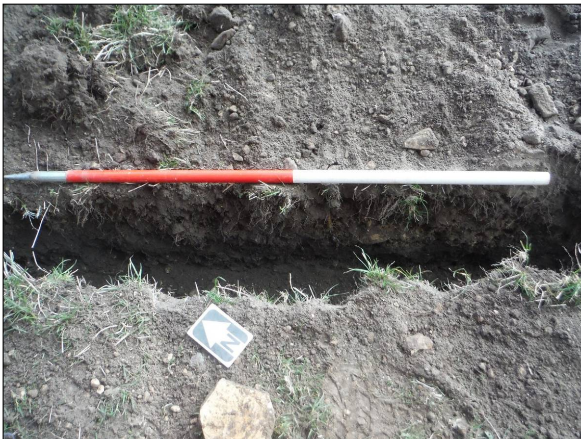
Figure 3. South West facing section through deposit (100) (Scale = 1x1m).