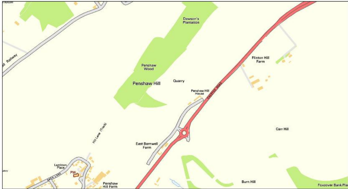
Figure 2. Detailed site location.

2.1 The site is located on Penshaw Hill, found on the Eastern outskirts of Penshaw, Sunderland, centred at NZ 3340 5438. The solid geology of the area is Raisby: Dolostone and Seventy Fathom Post Member: Sandstone. The overlying drift geology comprises mainly of Pelaw Clay Member (British Geological Survey 2015).