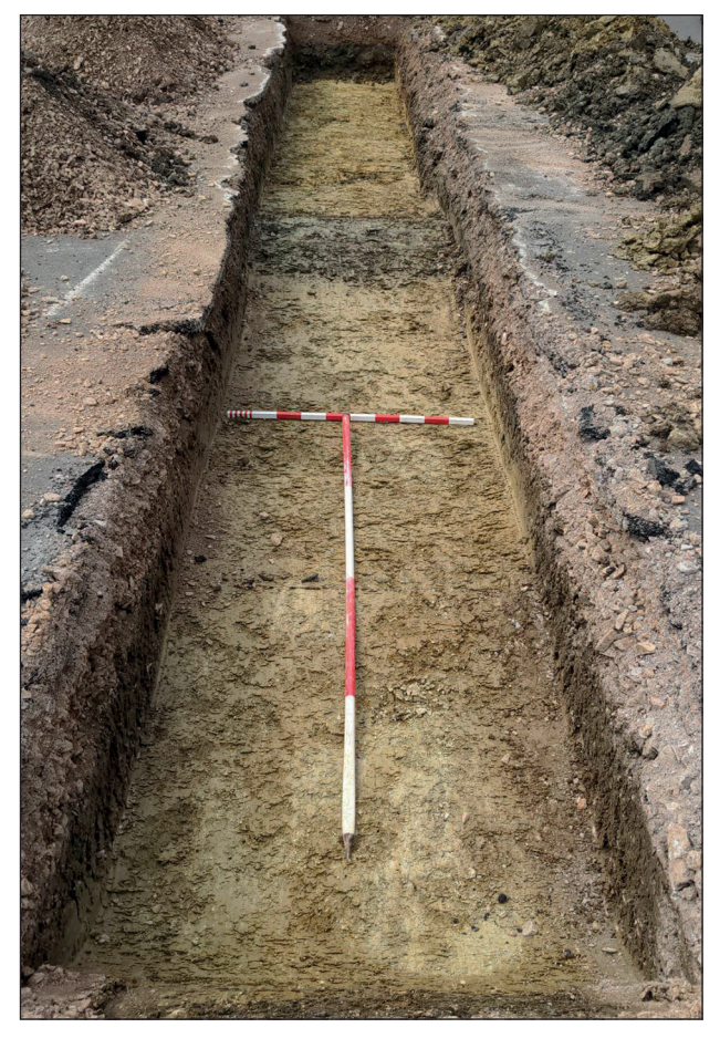
Figure 8: General view of trench 1 from the south-west (1 m and 2 m scales)