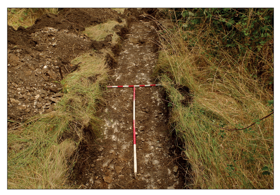
Figure 2: General view of trench 2 from the south-east (1 m and 2 m scales)