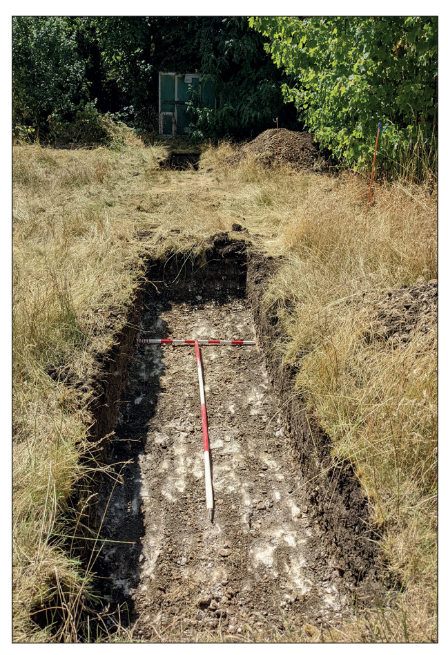
Figure 5: General view of north-east end of trench 3 (1m and 2 m scales)