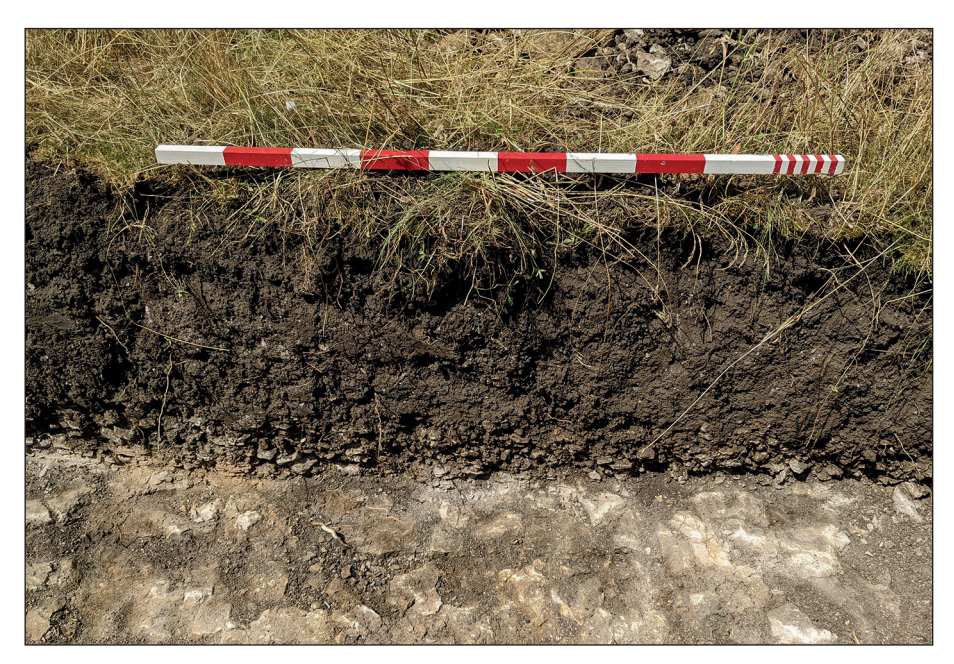
Figure 6: South-east facing representative section of trench 3 (1 m scale)