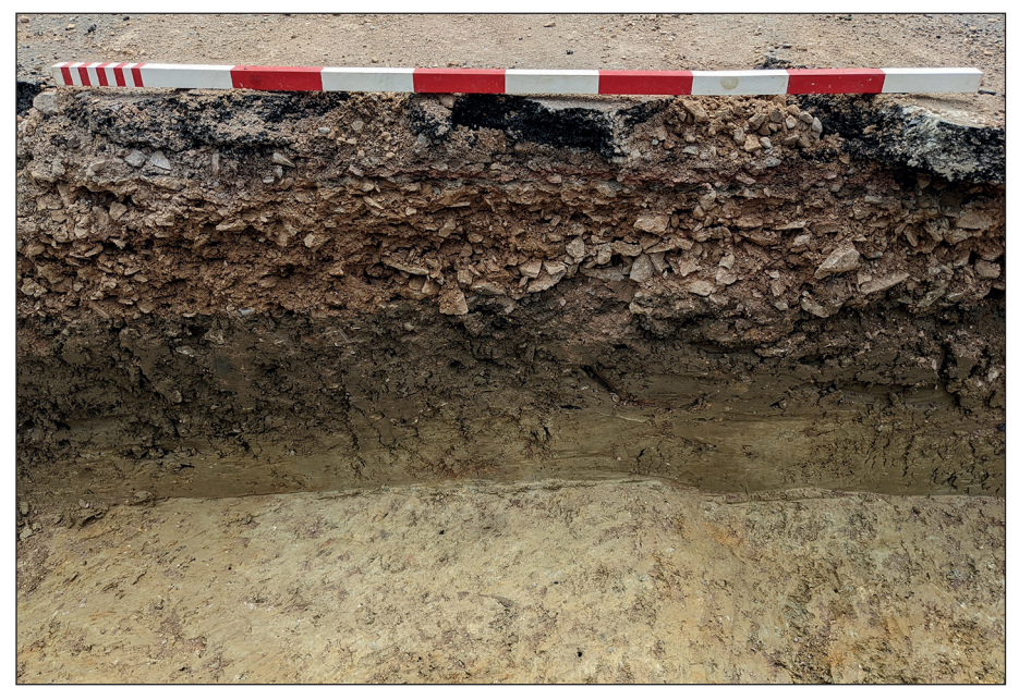
Figure 9: North-west facing representative section of trench 1 (1 m scale)