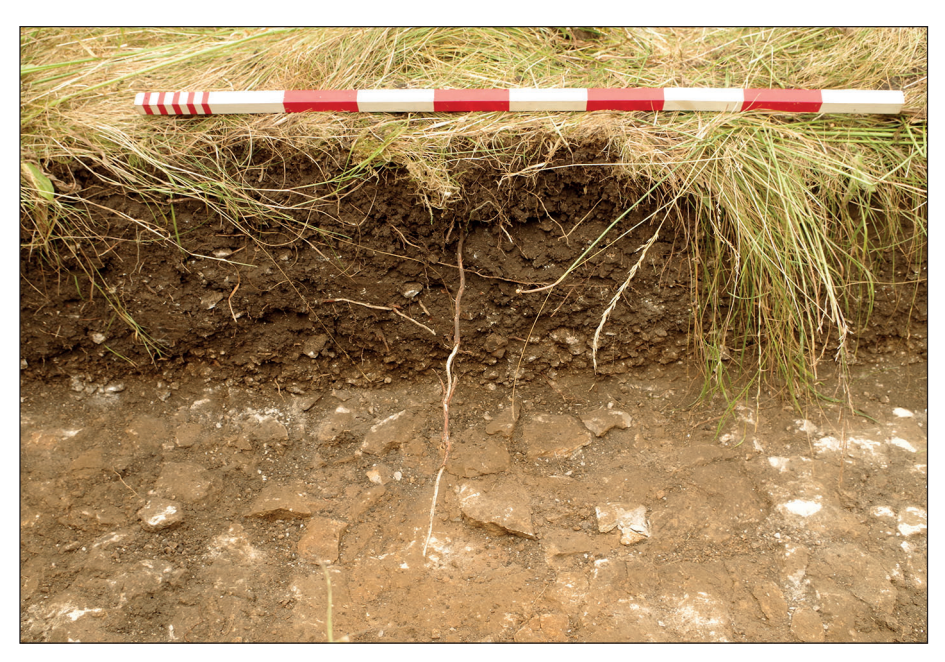
Figure 3: North-east facing representative section of trench 2 (1 m scale)