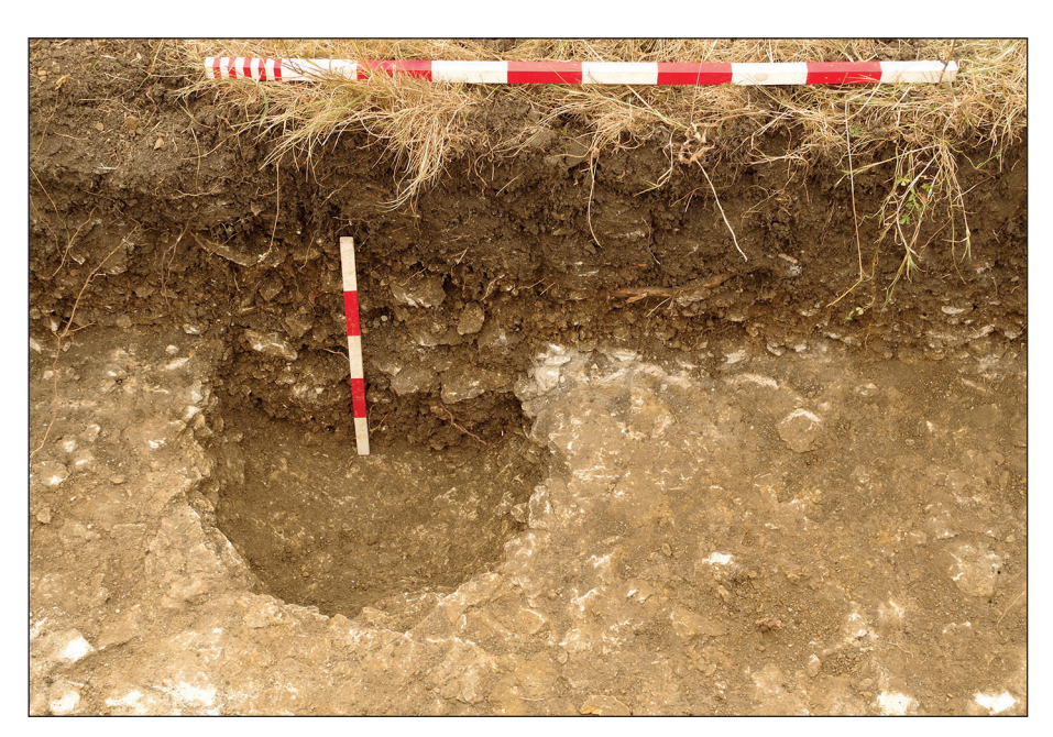
Figure 10: North facing section of pit 404 (1 m and 0.5 m scales)