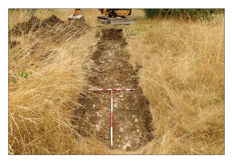
Figure 7: General view of trench 4 from the west (1 m and 2 m scales)