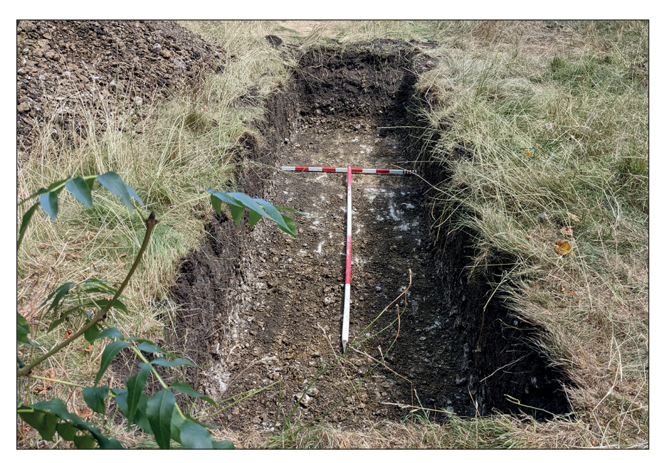
Figure 4: General view of the south west end of trench 3 (1m and 2 m scales)