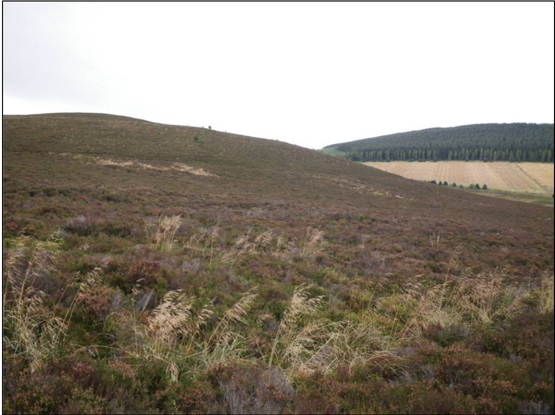
Photo ID No.24 – Looking west towards the north flank of Red Hill at the previously recorded position of features associated with Red Hill quarry ( WA 2001 ).