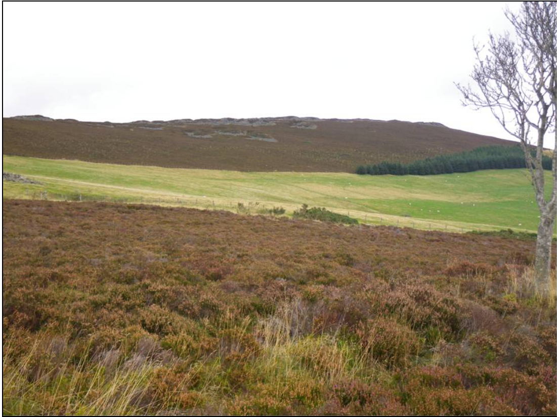
Photo ID No.57 – The spoil heaps of Foudland Quarries ( WA 2002 ) viewed from the south-west.