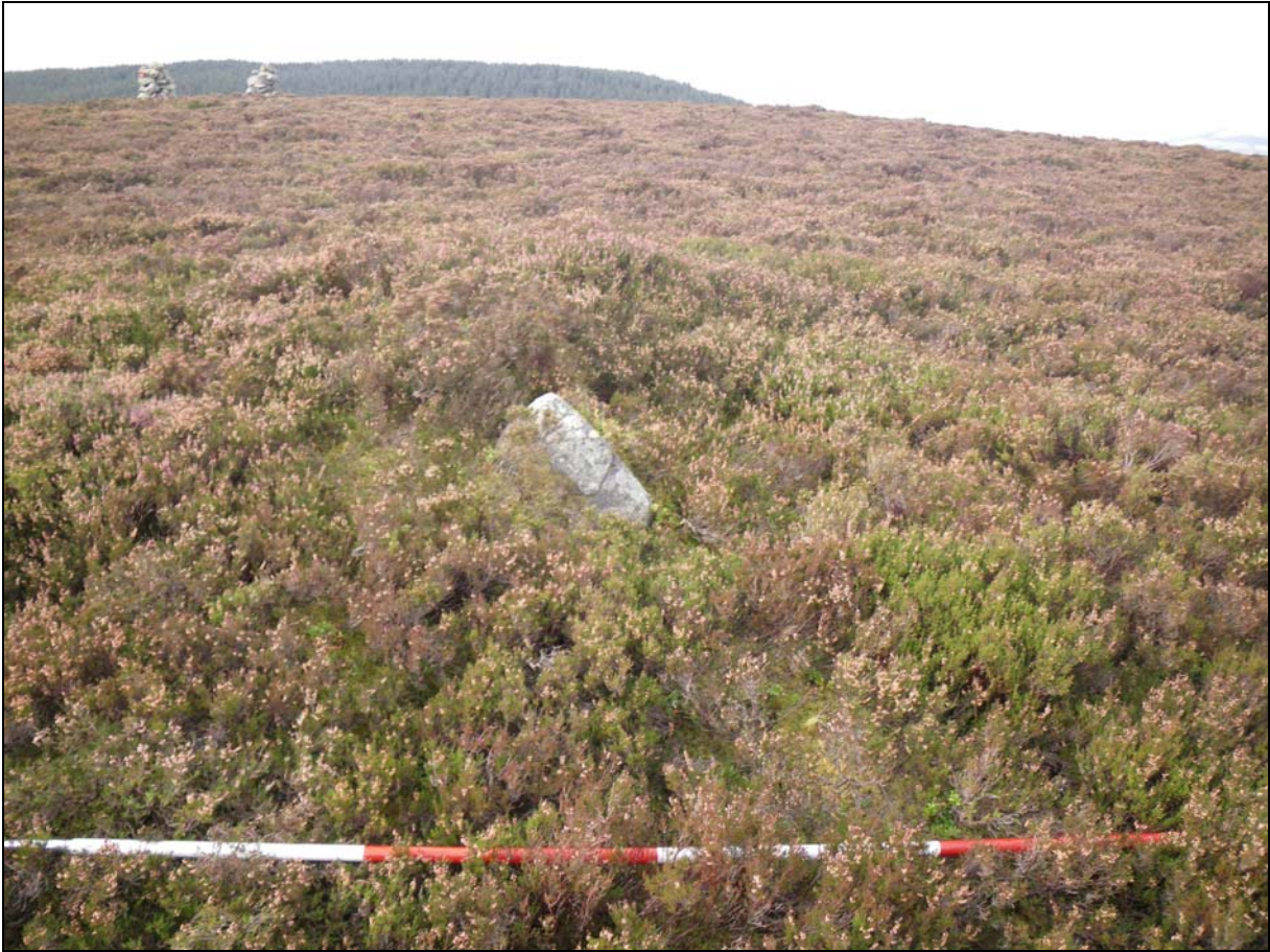
Photo ID No.14 – Possible clearance cairn ( WA 1002 ) with Red Hill cairns ( WA 1003 ) visible in the background.