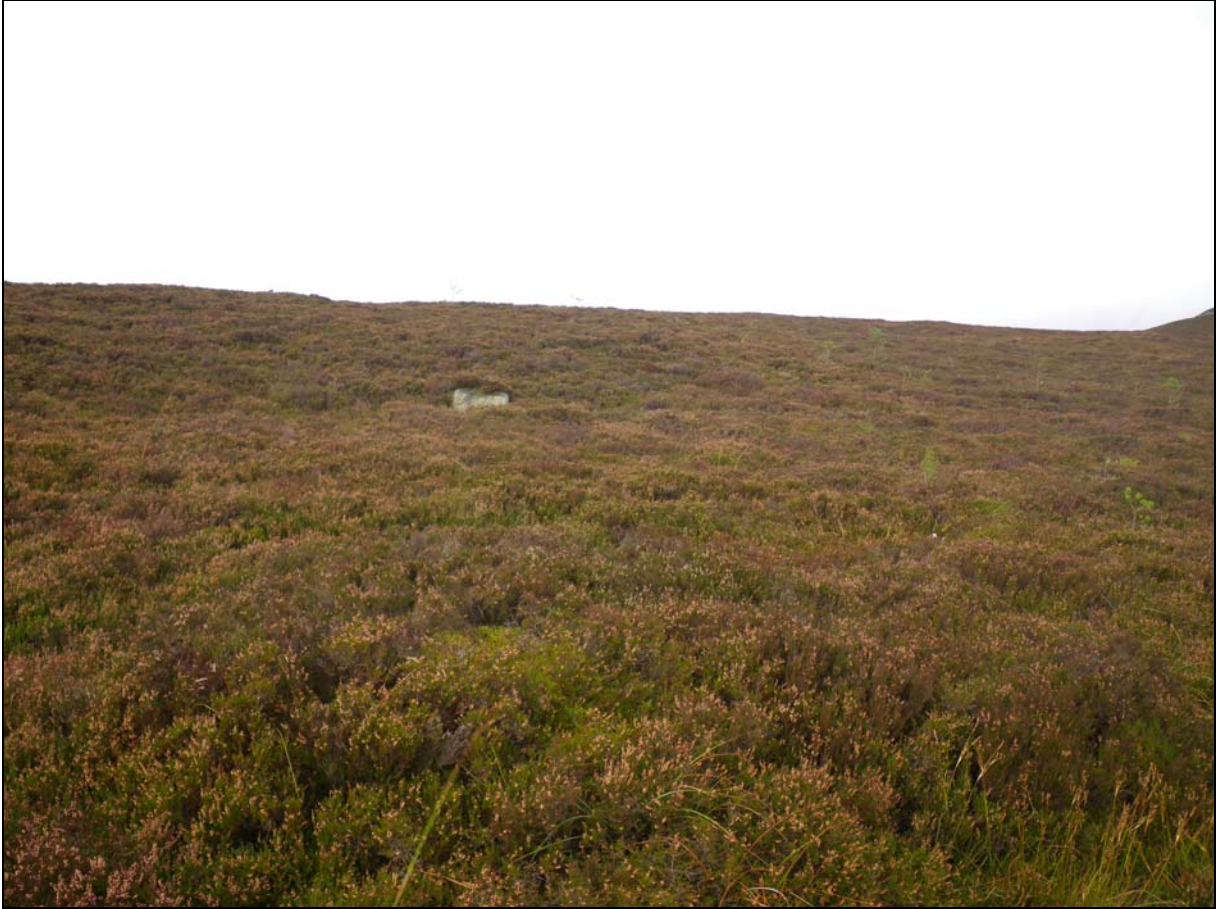
Photo ID No.55 – Possible platform on the south-east flank of Stony Hill ( WA 1005 ).