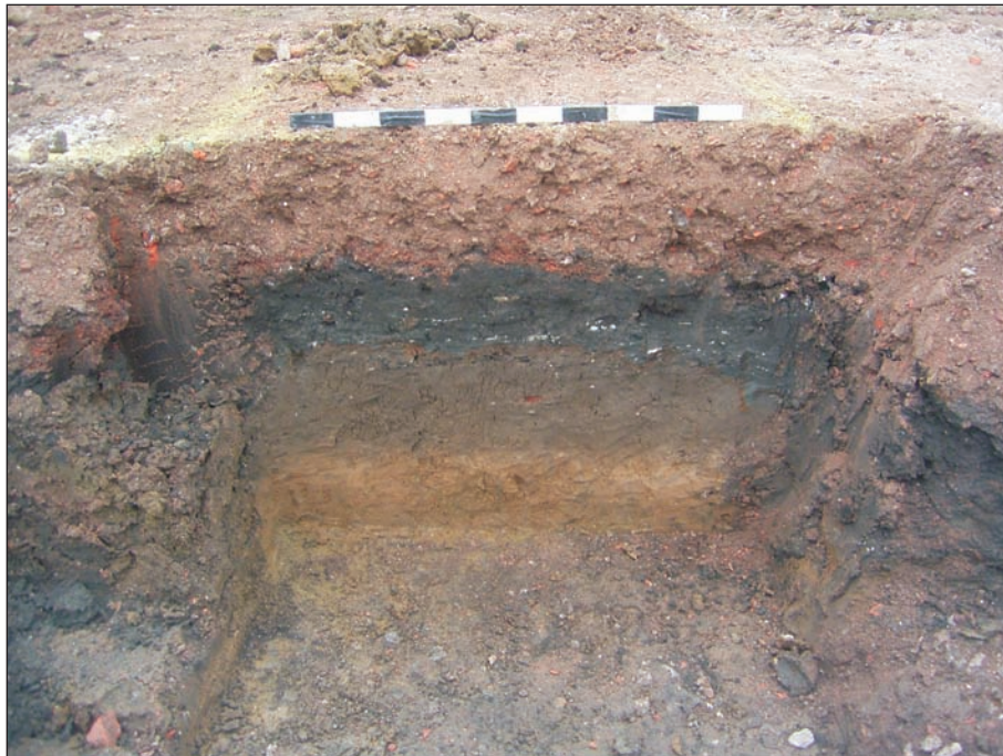
Plate 1: Section 1 stratigraphic sequence

This material is for client report only © Wessex Archaeology. No unauthorised reproduction.