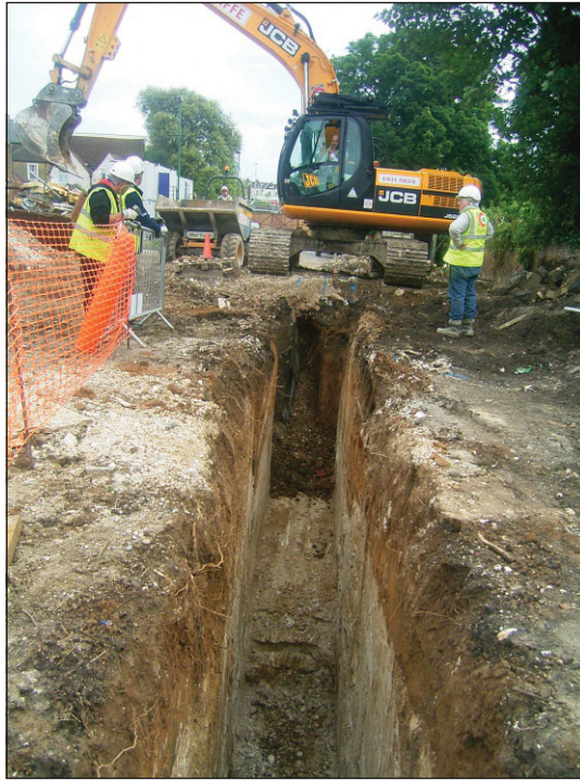
Plate 5: South east facing section of excavation area

This material is for client report only. No unauthorised reproduction.