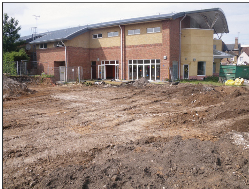
Plate 2: Excavated Area looking north

This material is for client report only. No unauthorised reproduction.