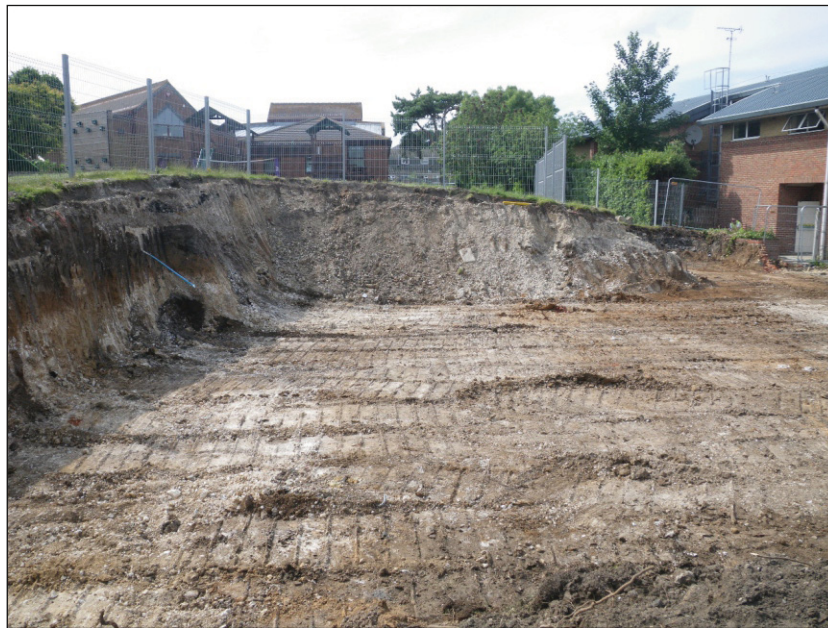
Plate 1: Excavated Area looking north west