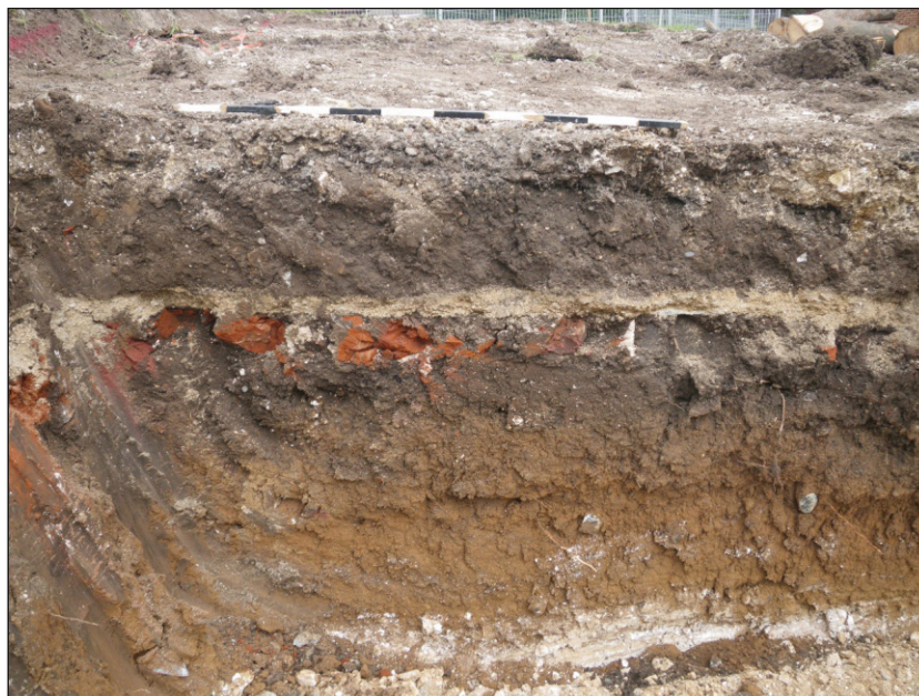
Plate 4: South east facing section of excavation area

This material is for client report only © Wessex Archaeology. No unauthorised reproduction.