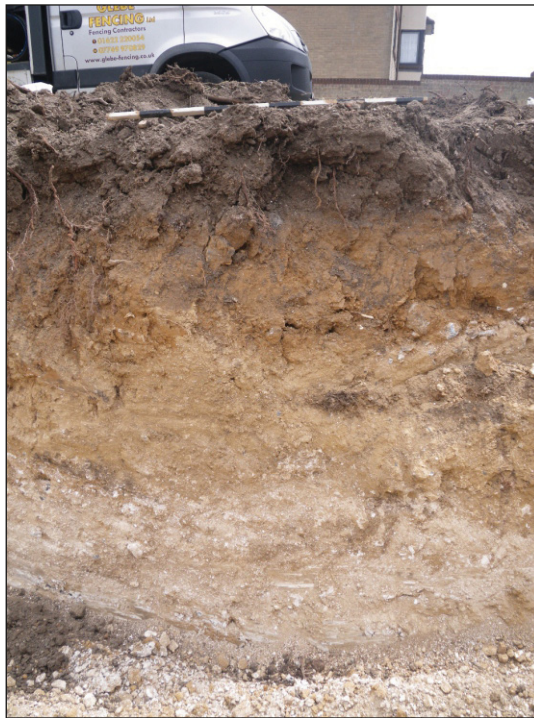
Plate 3: North west facing section of excavated area