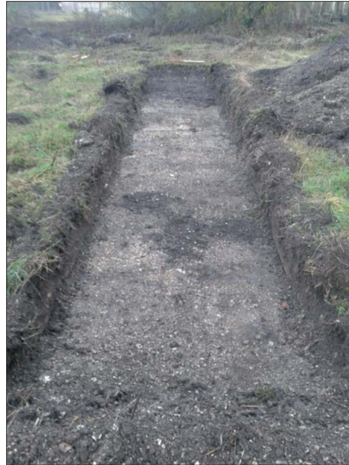
Plate 2: Bioturbation in Trench 5, facing northwest