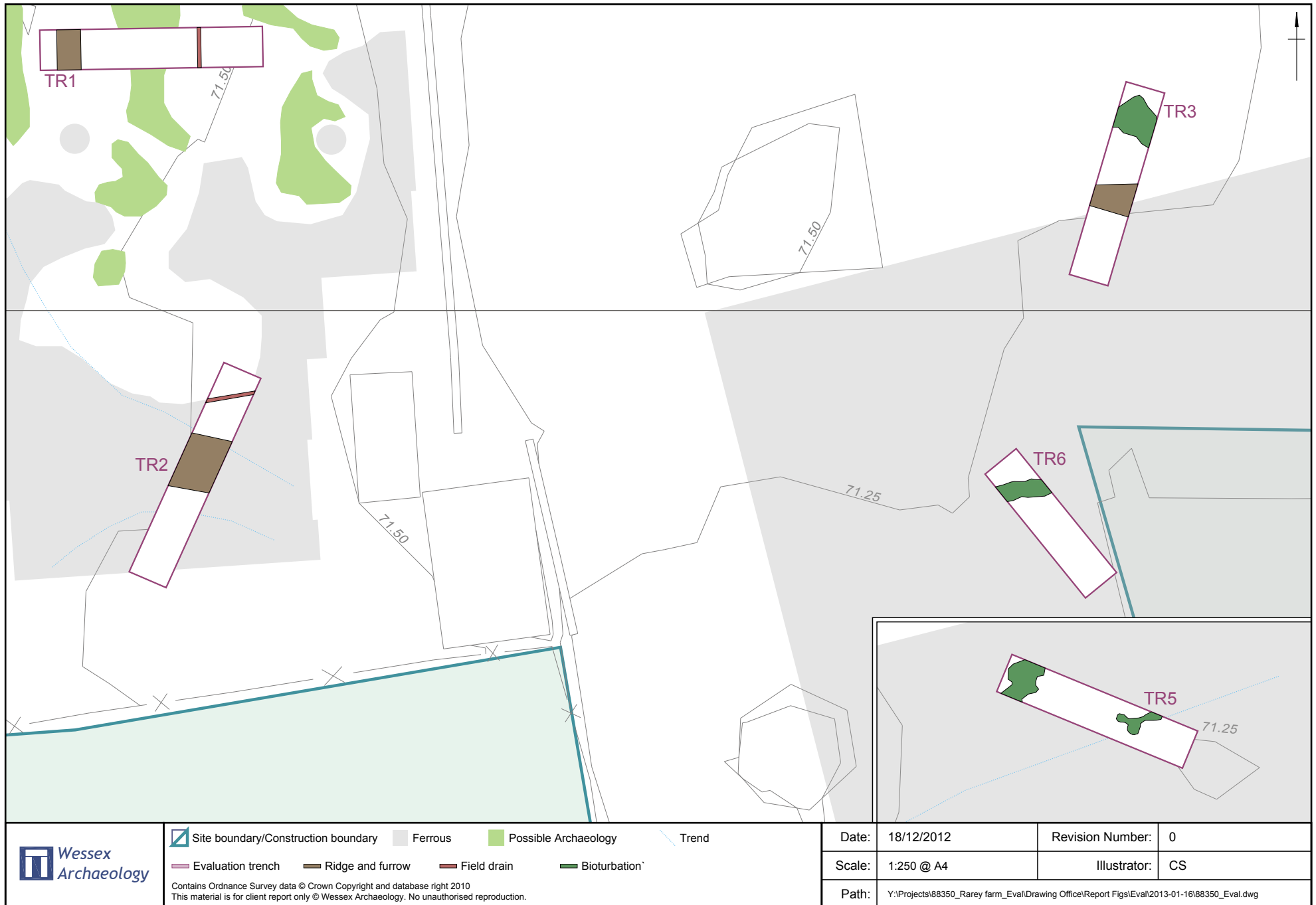
Plan of Trenches 1, 2, 3, 5 and 6