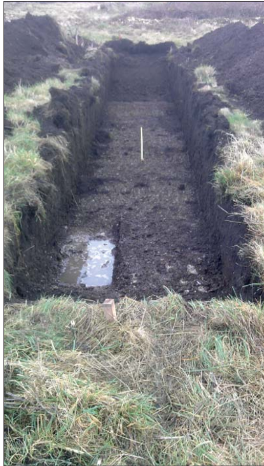
Plate 1: Trench 1 furrow (foreground), facing east