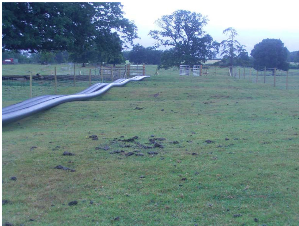
Plate 1 Ridge and furrow at western end of Scheme