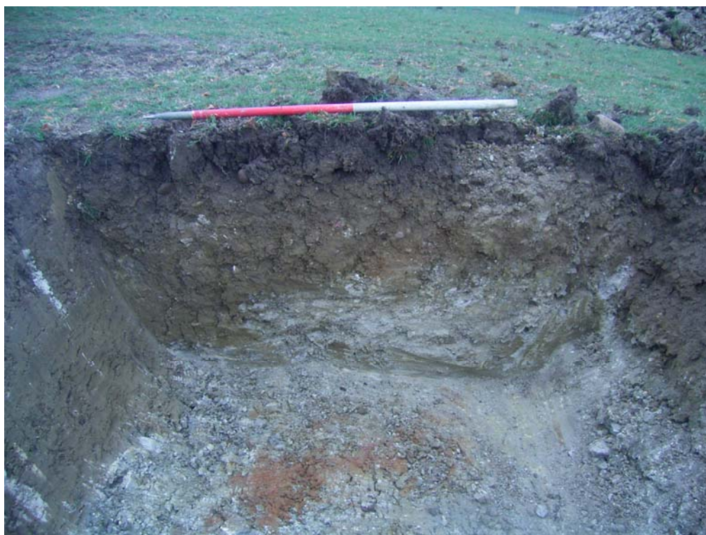
Plate 2 North facing section of boundary ditch at western end of Scheme.