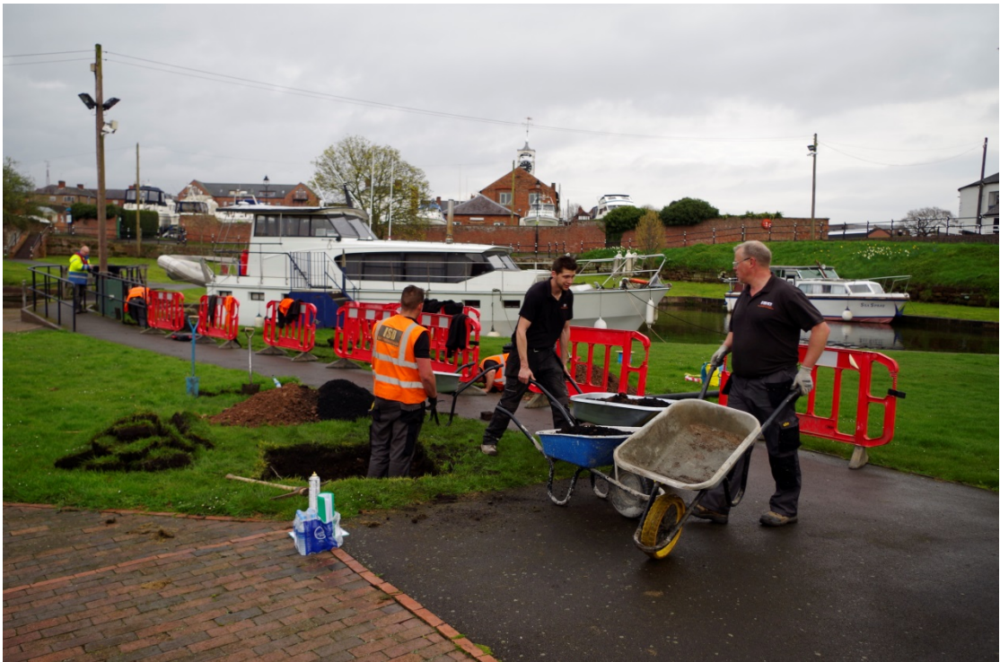
Plate 1: Groundworks beside the lock