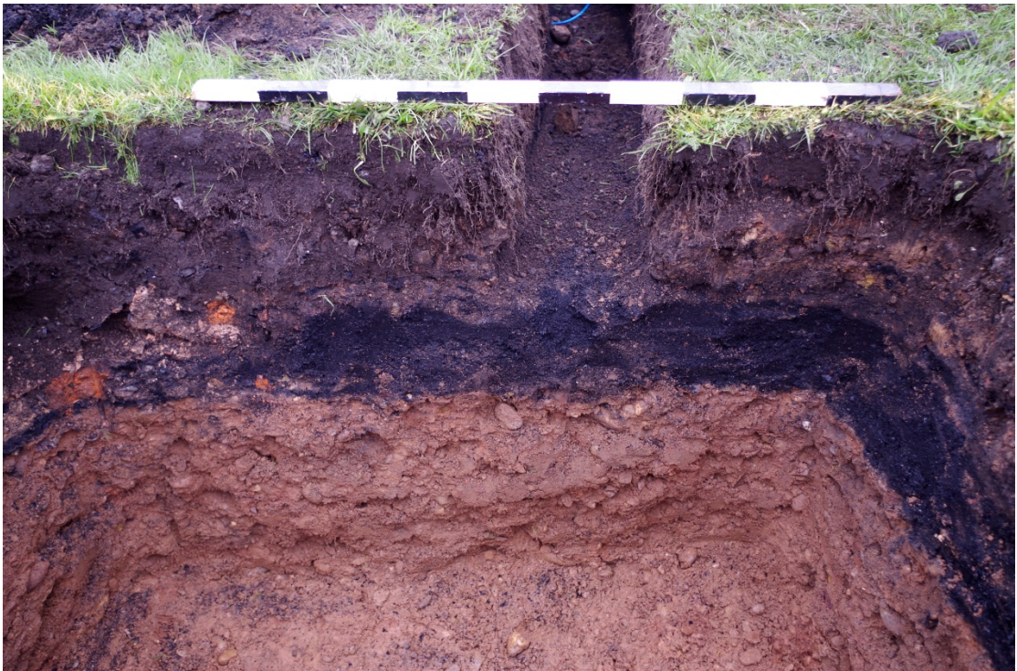
Plate 2: Representative section