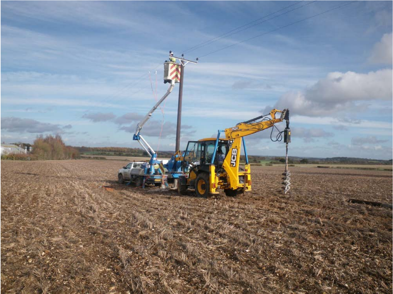
Plate 1: Installation of P28