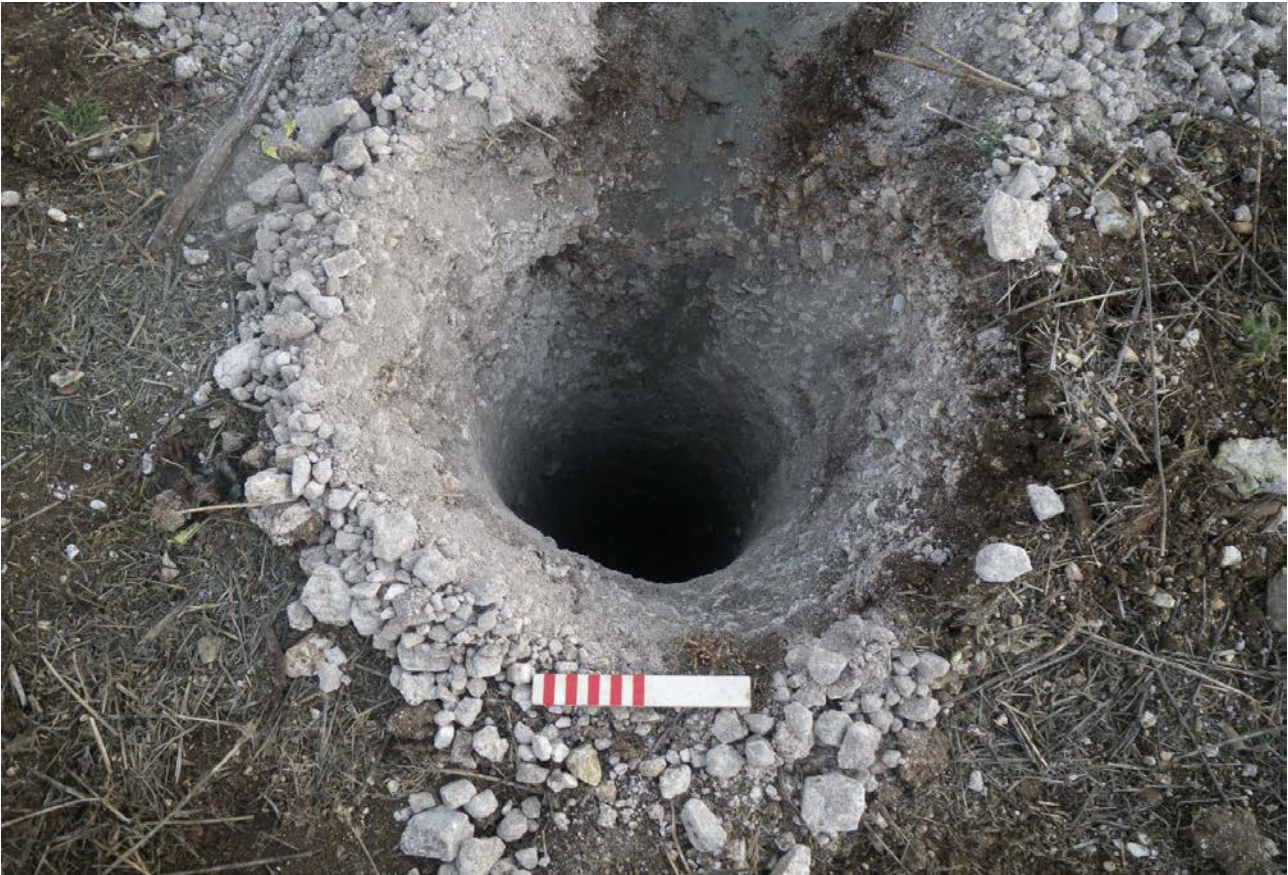
Plate 2: Re-augured hole for P27. Scale is 0.2m