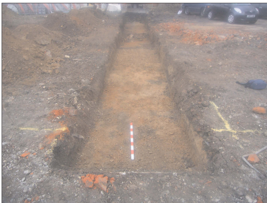
Plate 2: Plan view of Trench 2 from east with 1m scale