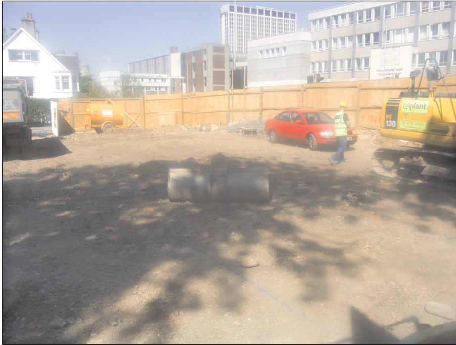
Plate 1: Site from south-east before start of works