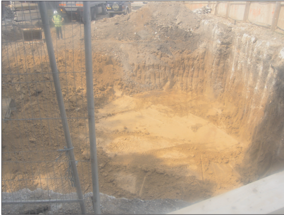
Plate 3: Excavating the central area (from east)