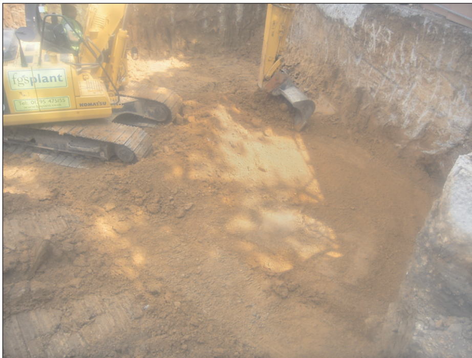
Plate 2: Excavation of north-east corner of Site