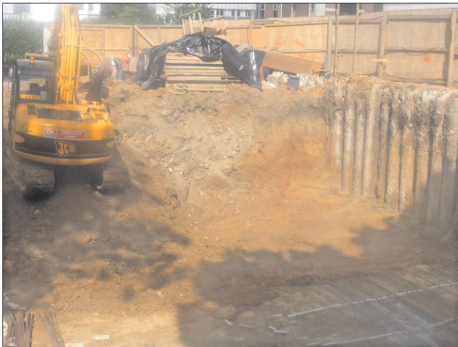
Plate 4: Excavating the central area, showing modern dumping cut (from south-east)