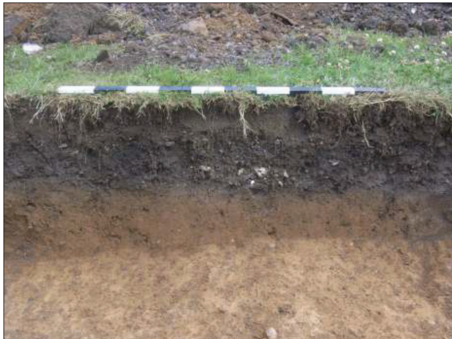
Plate 2: Representative section of Trench 1

This material is for client report only © Wessex Archaeology. No unauthorised reproduction.