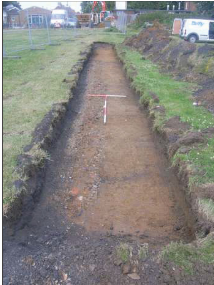
Plate 1: Trench 1 viewed from south