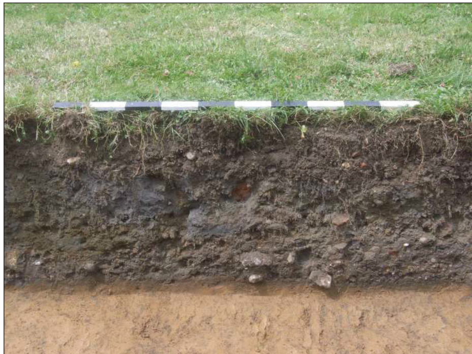
Plate 4: Representative section of Trench 2

This material is for client report only © Wessex Archaeology. No unauthorised reproduction.