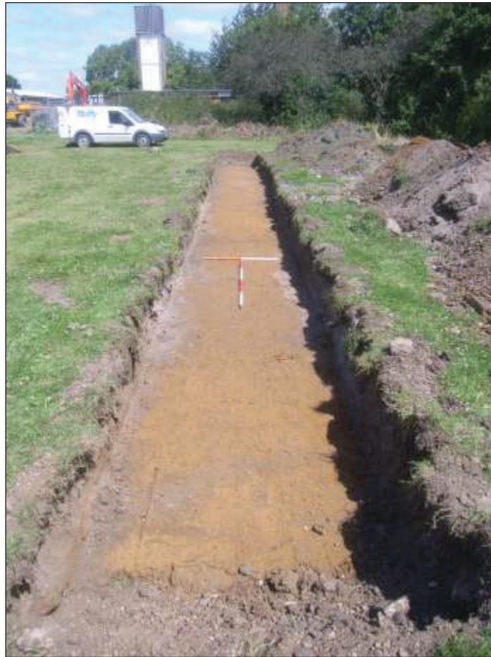
Plate 3: Trench 2 viewed from south