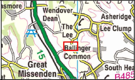
High Speed Two Figure 2. Location of control points.