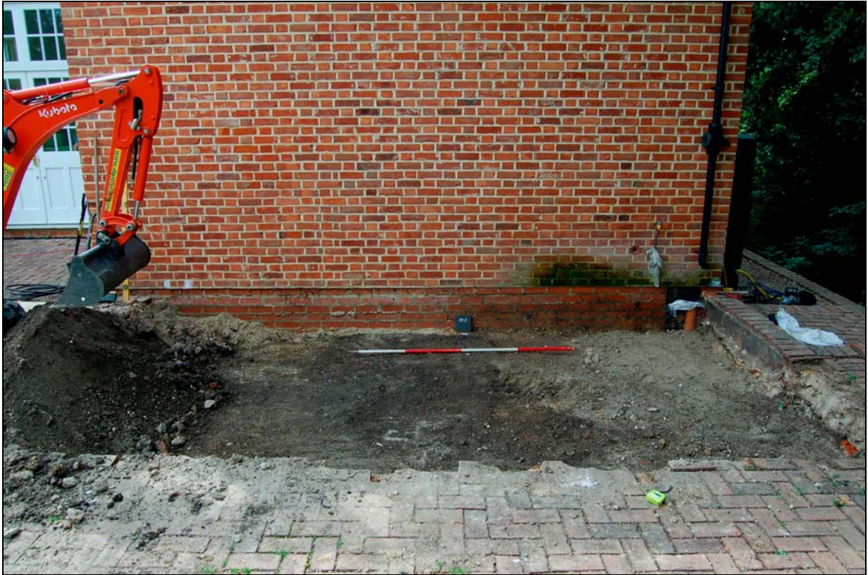
Plate 1 Monitored area viewed to south-west