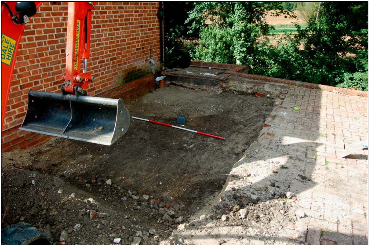
Plate 2 Monitored area viewed to north-west, overlooking the bailey ditch