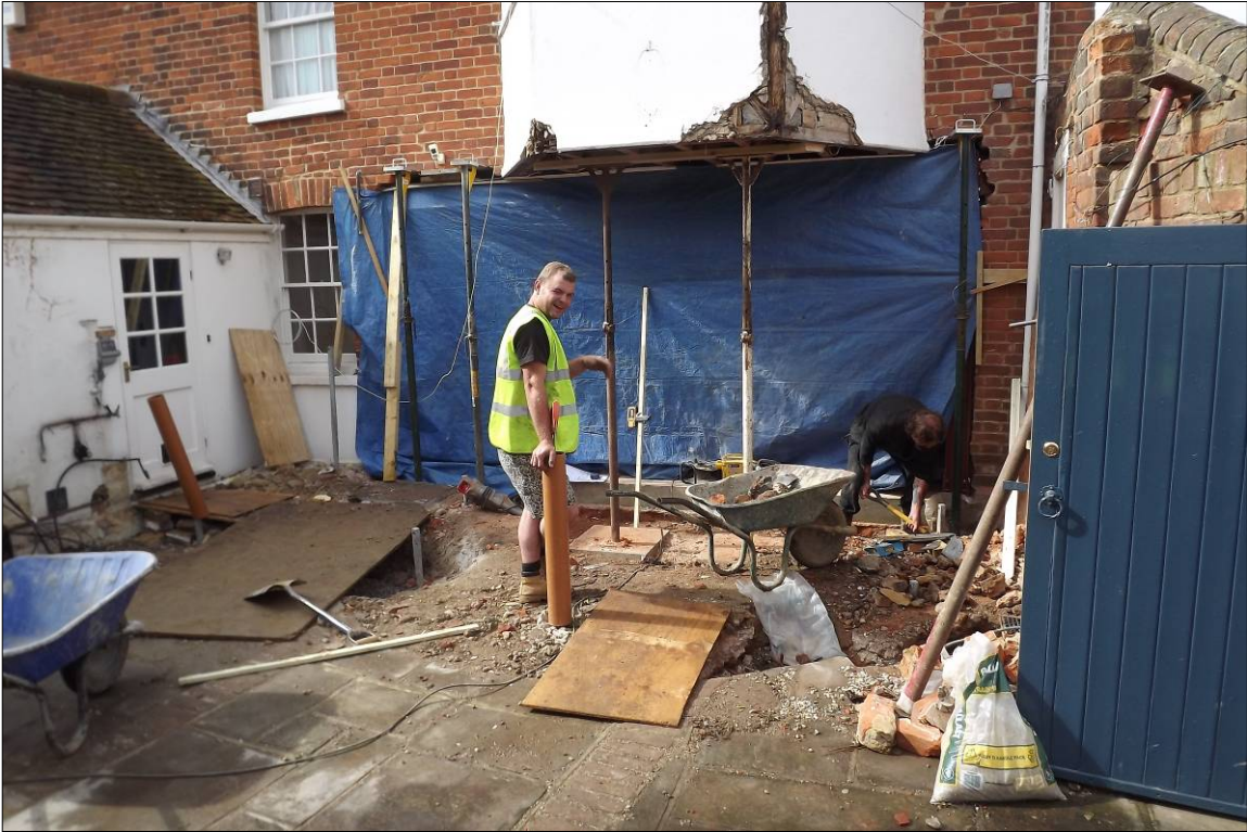
Plate 1. Excavation of the extension footprint, looking southeast.