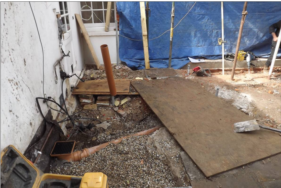
Plate 2. The existing services on site, looking south.