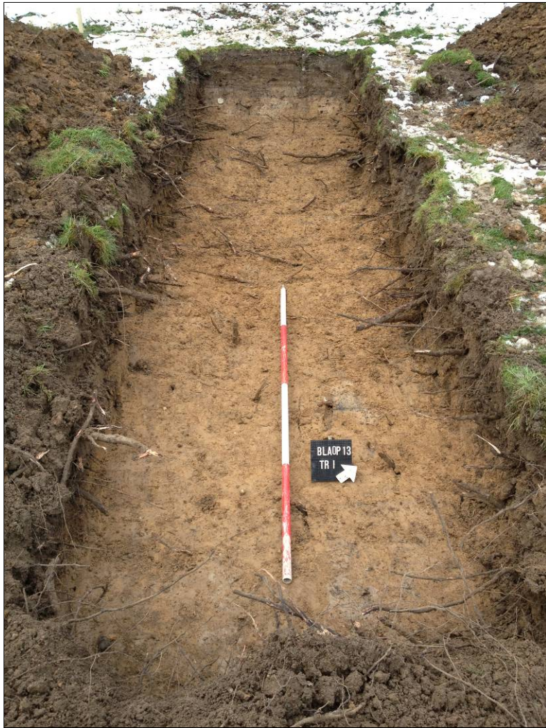
Plate 3. Post-ex photo of trench 1