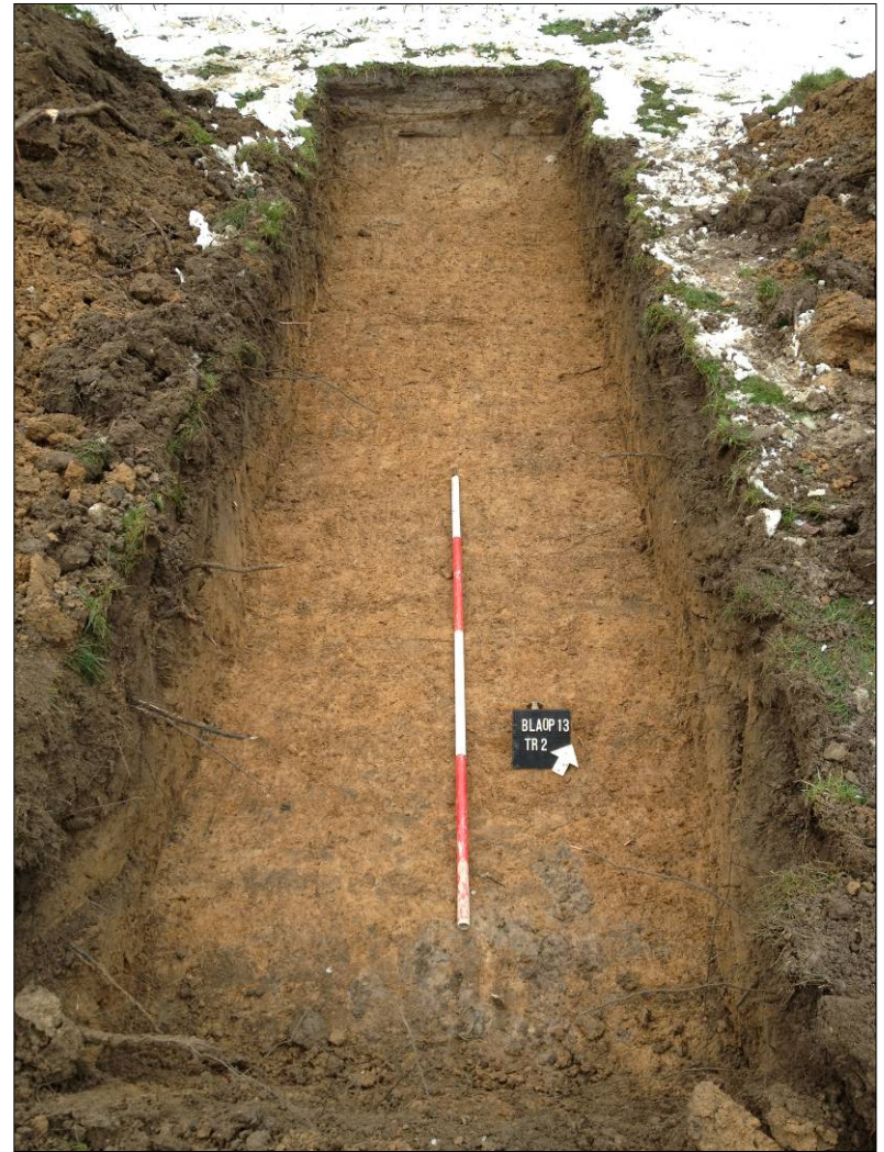
Plate 4. Post-ex photo of trench 2