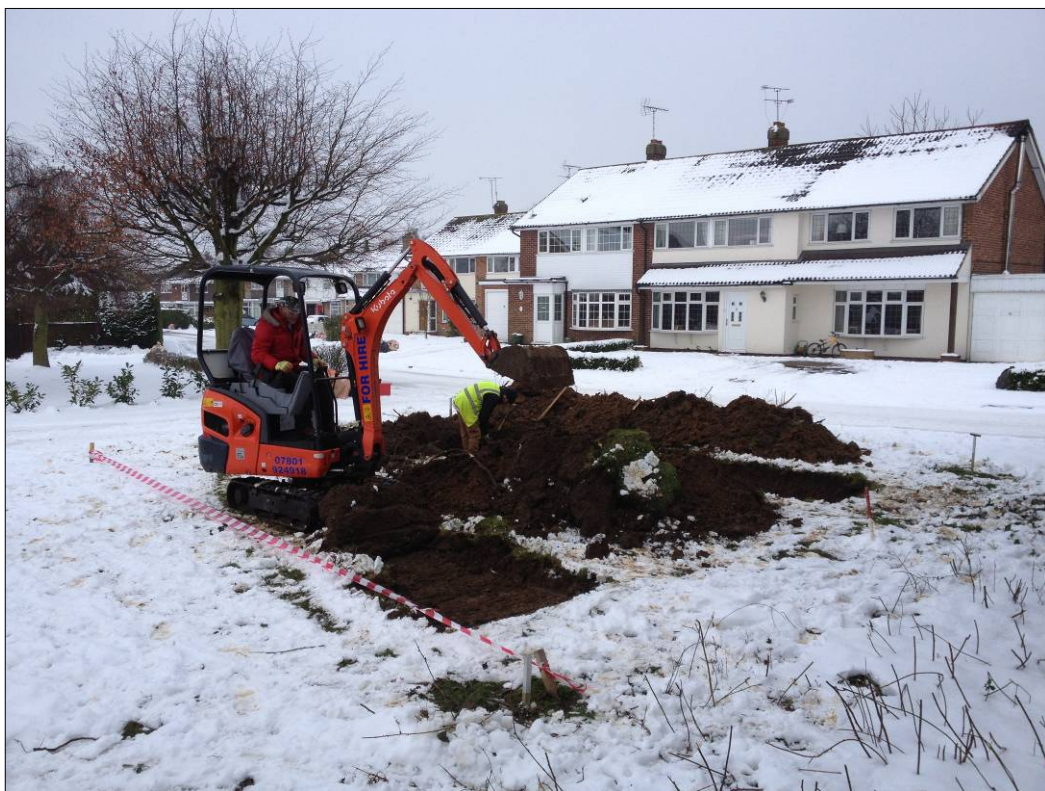
Plate 2. Trench 2 under excavation