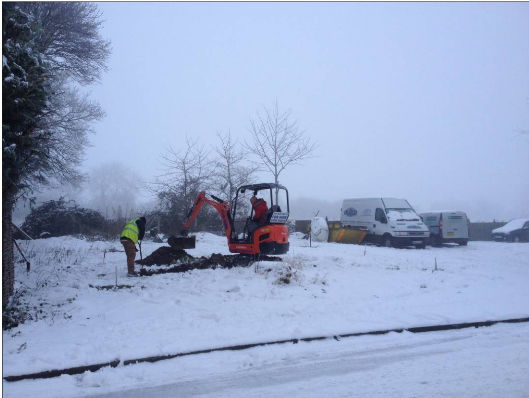
Plate 1. Excavation of trench 1 within the proposed development footprint