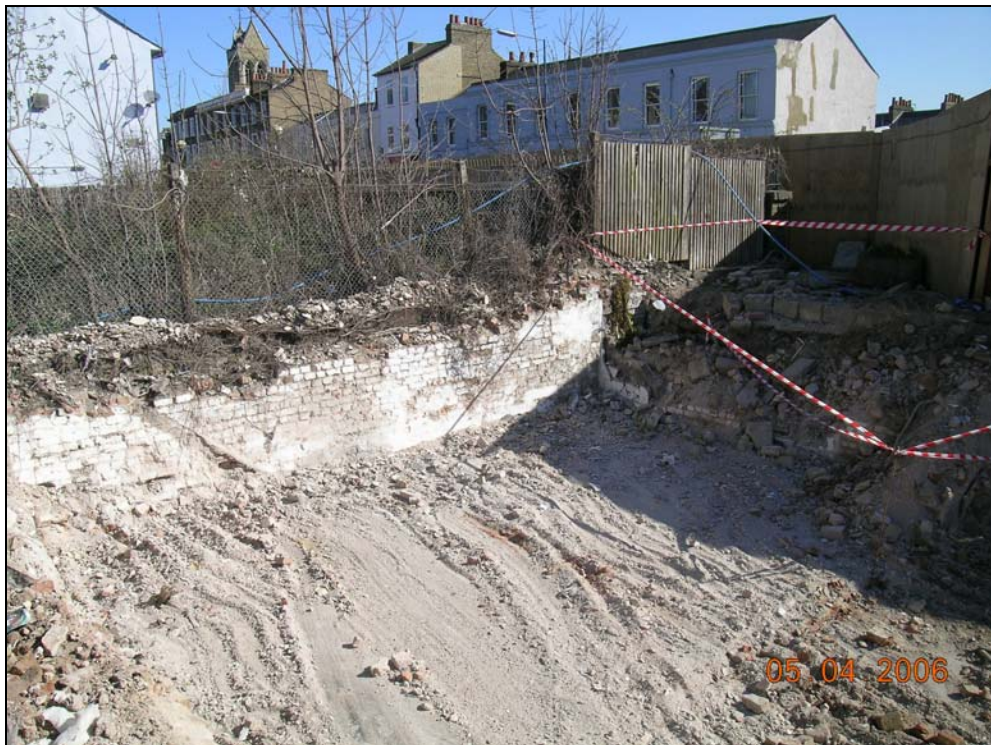
Plate 4 Victorian cellars along Parrock Street frontage, north-east corner of site A