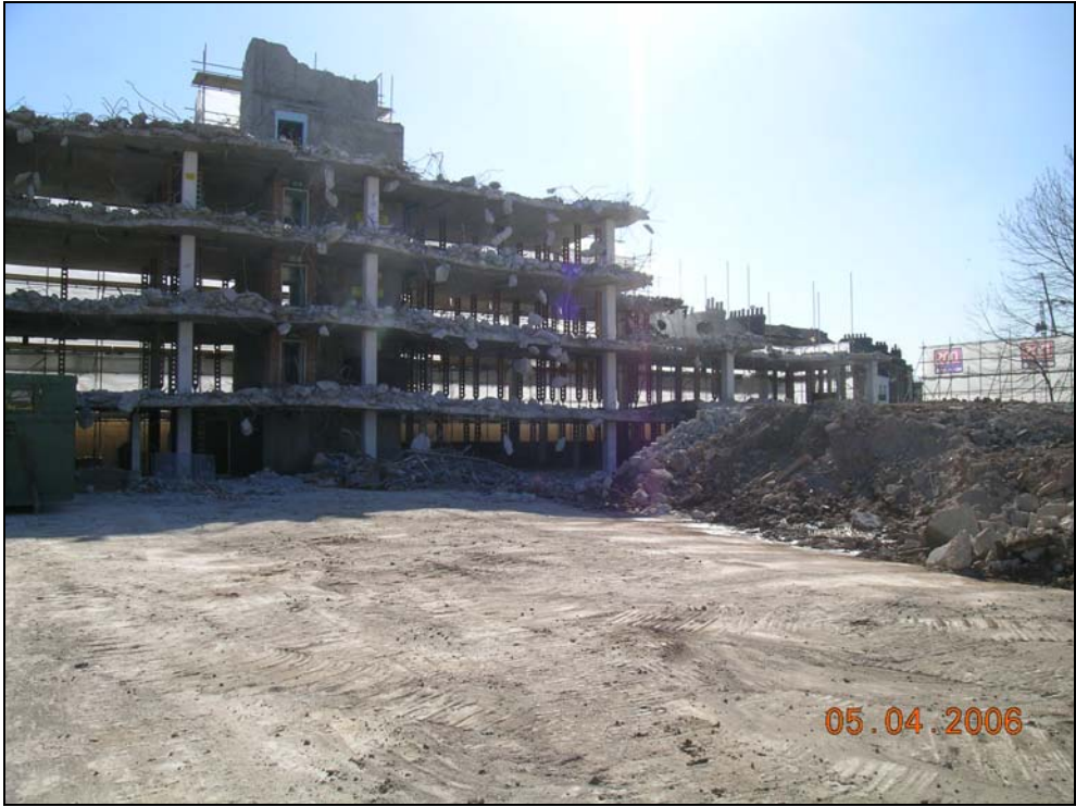
Plate 1 Demolition and clearance of multi-storey car park in south half of site A