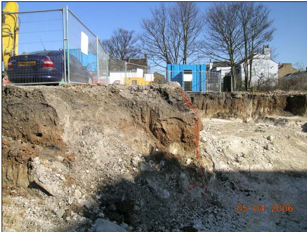
Plate 3 Stratigraphic sequence (overburden/subsoil/brickearth/chalk), north-east part of site A