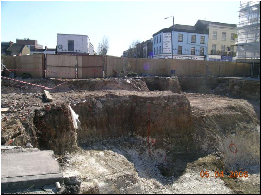
Plate 2 Stratigraphic sequence (overburden/subsoil/brickearth/chalk), north-east part of site A