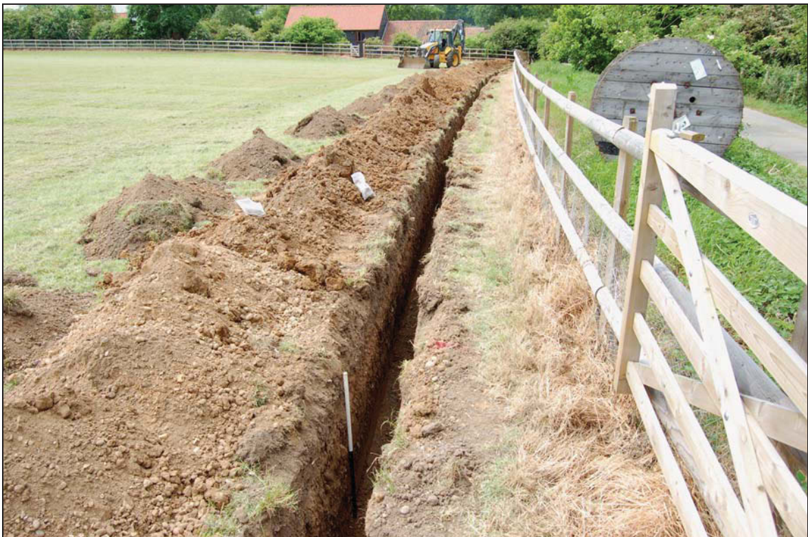
Plate 2 Cable trench adjacent to paddock, viewed towards west