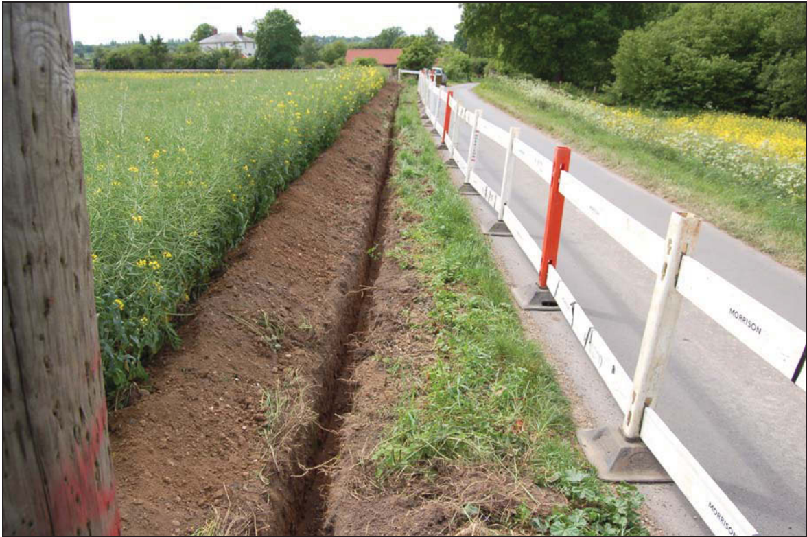
Plate 1 Cable trench adjacent to field, viewed towards west