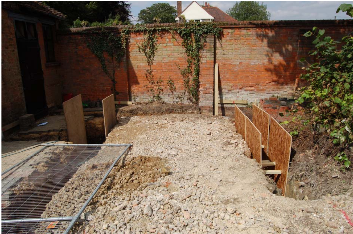
Plate 1: 20 Sheering Road Harlow - foundation trenches under excavation prior to stripping interior.