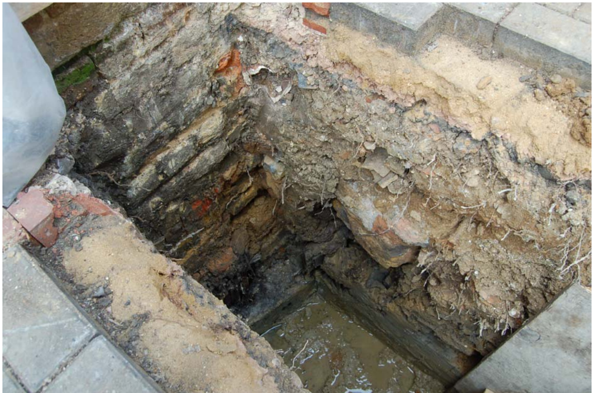
Plate 2: General view of new foundation (1.7m deep) abutting existing house.