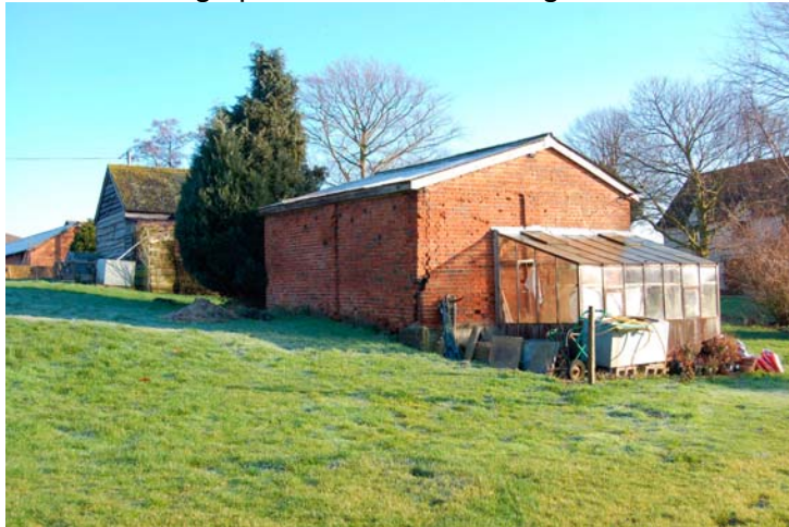
Plate 3. Stable and garage, pre-demolition, looking north-east.