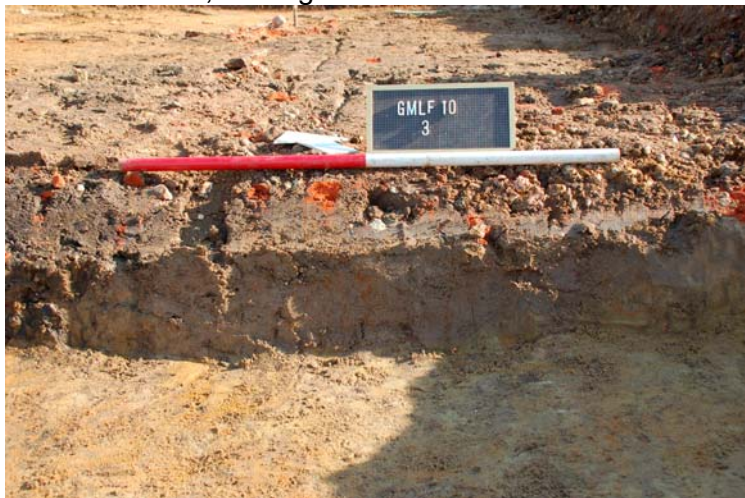
Plate 7. Ditch 3, looking north-east. 1m scale