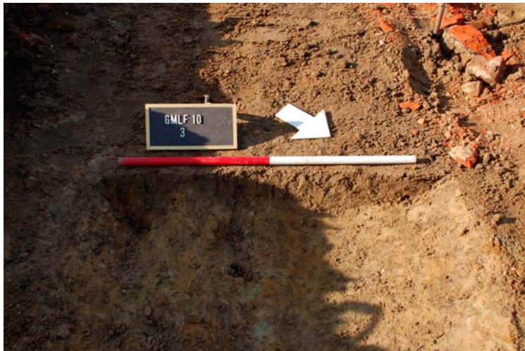
Plate 5. Ditch 3, looking south-west. 1m scale.