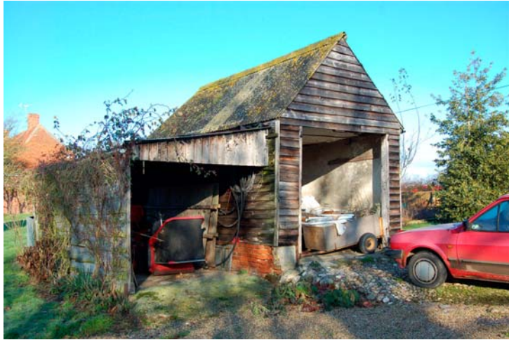
Plate 1. Garage pre-demolition, looking north-west.