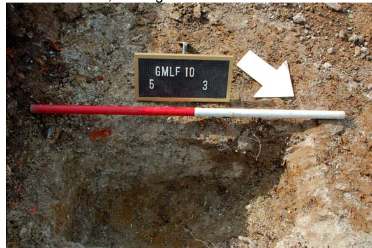
Plate 8. Ditch 3 and layer 5, looking south-west. 1m scale