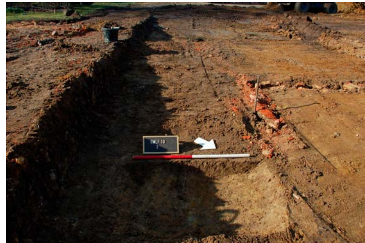
Plate 6. Ditch 3, looking south-west. 1m scale.