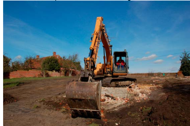
Plate 4. Demolition of stable. Looking north.