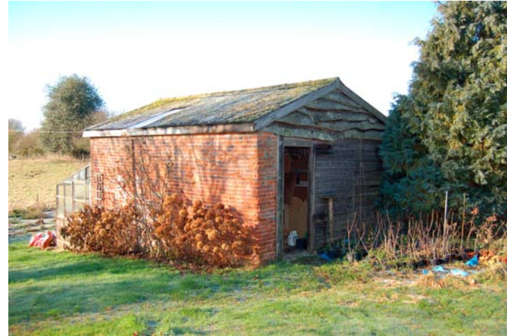
Plate 2. Stable pre-demolition, looking west.