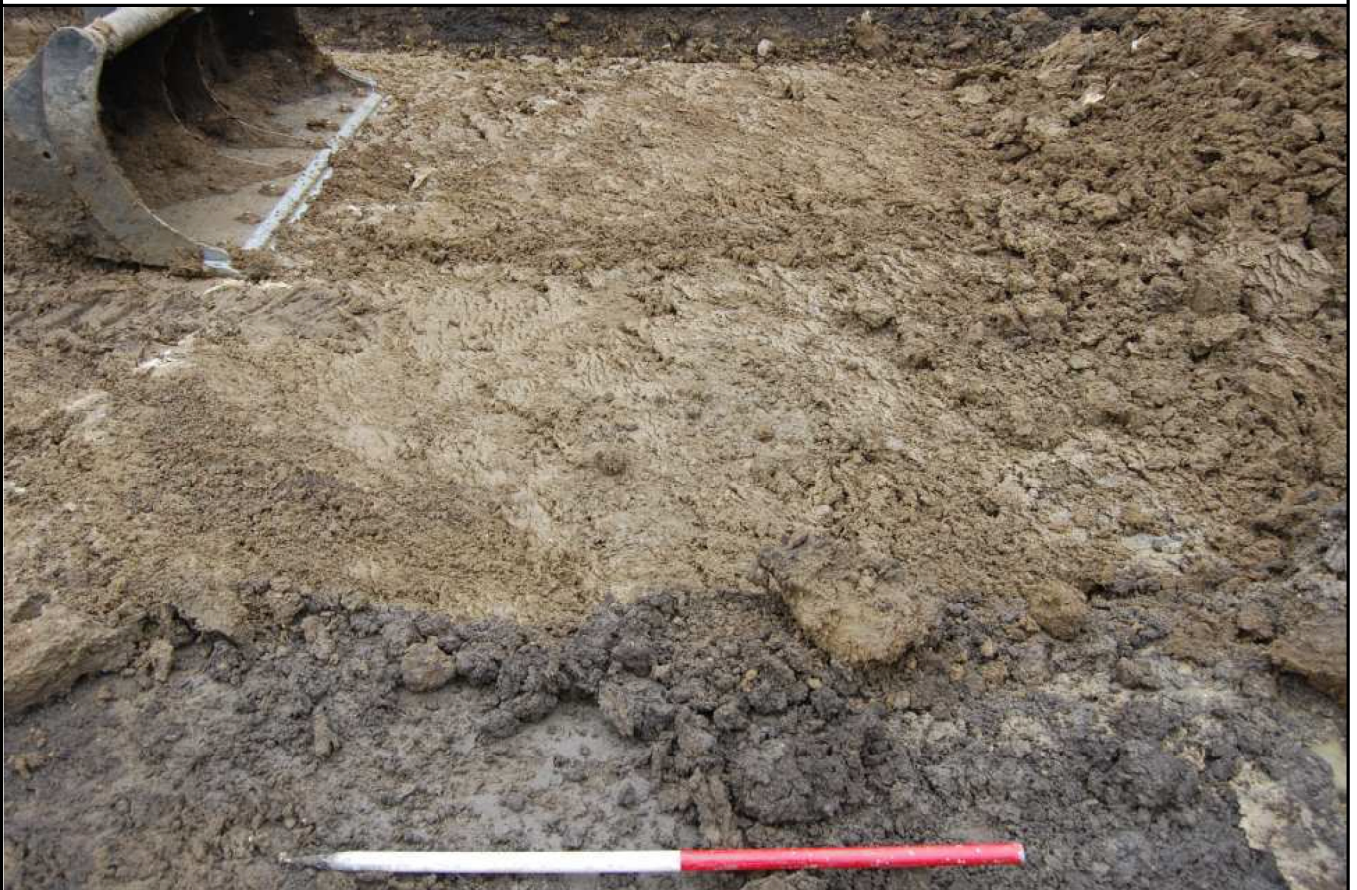
Plate 2: West end of access road strip, looking south.