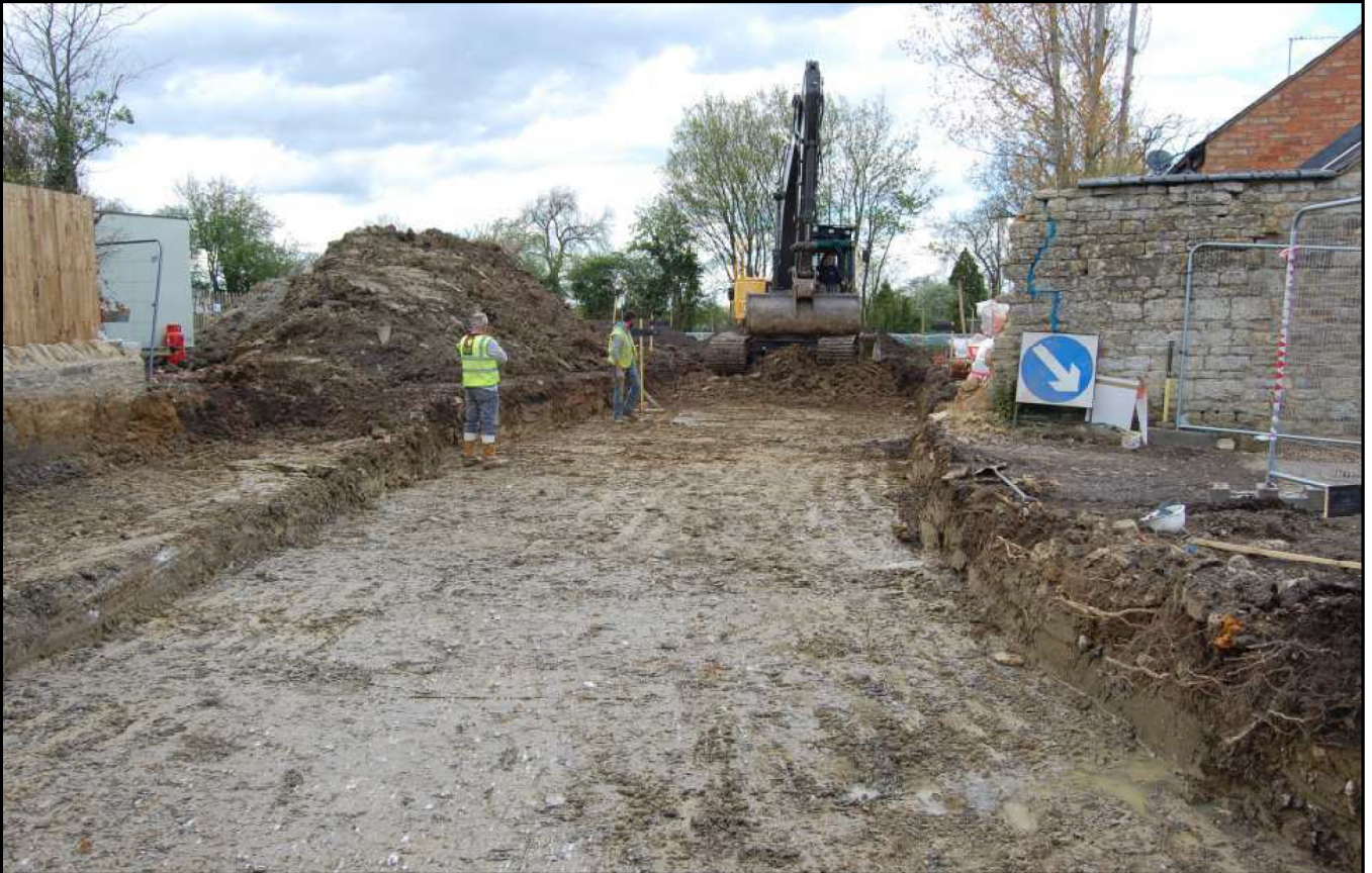
Plate 1: Access road strip at site entrance, looking north.