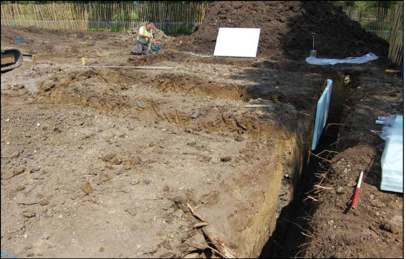
Plate 5: Footing trenches for plot 2, looking northwest.