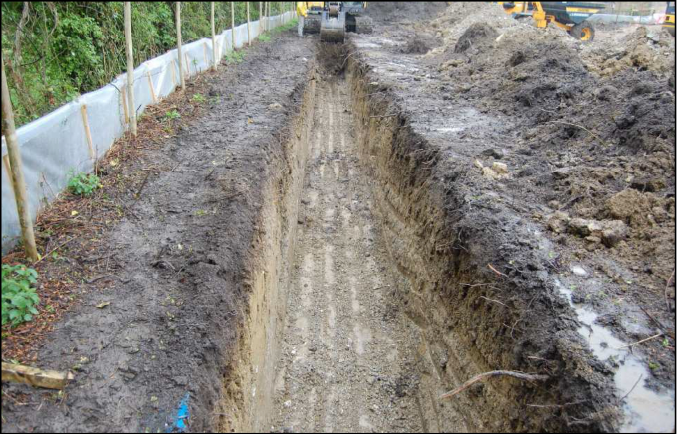
Plate 3: Excavation for soakaway, looking east.