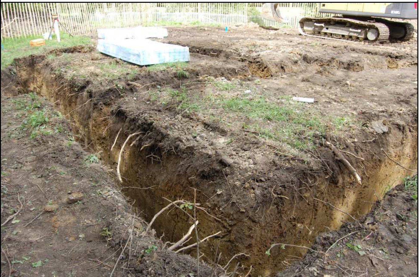
Plate 8: Footing trenches for plot 5, looking north.