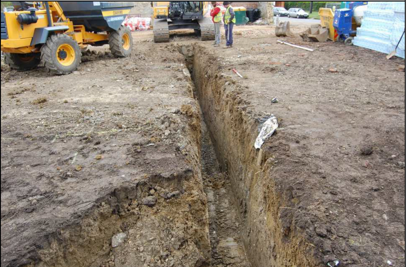
Plate 4: Plot 1 during excavation, looking east.