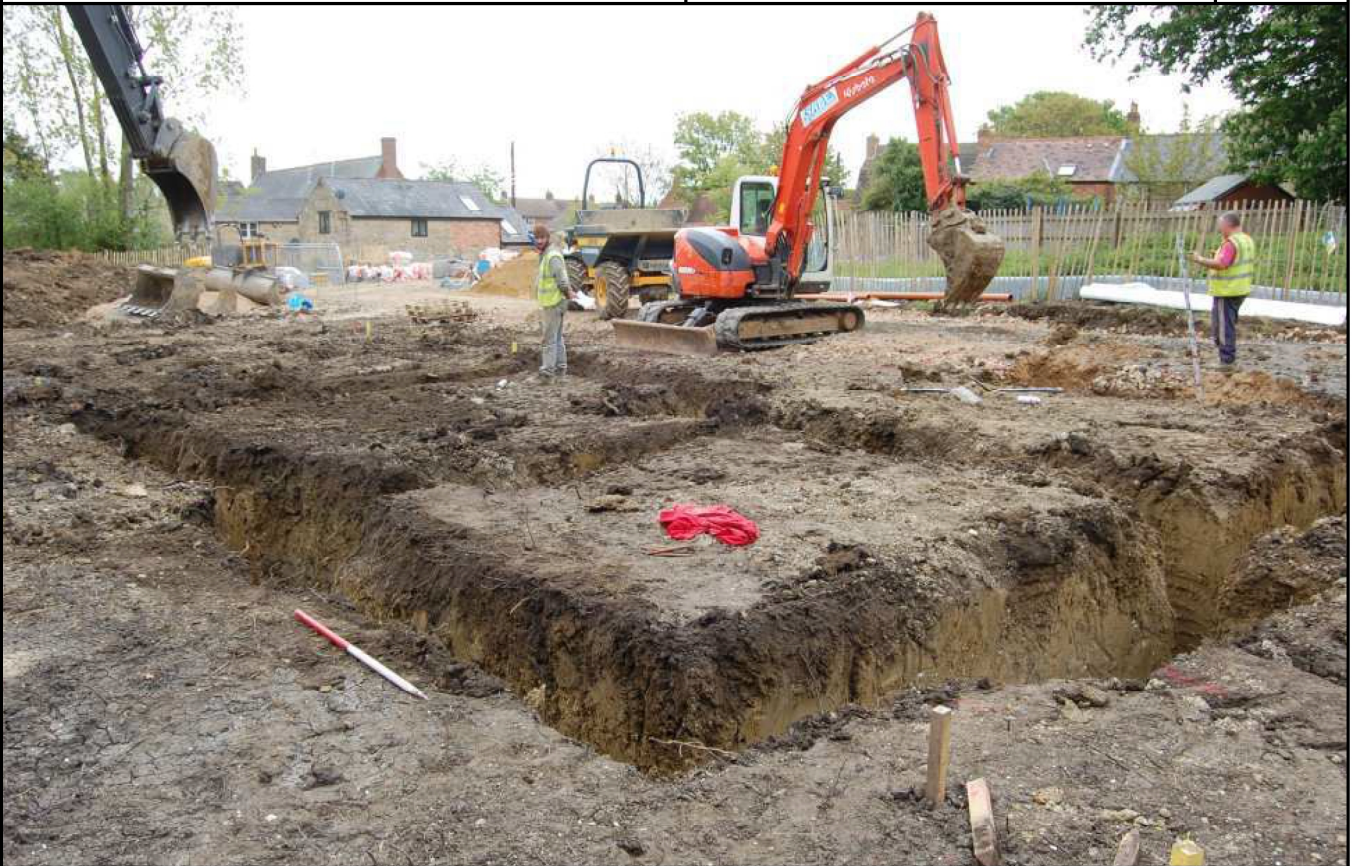
Plate 7: Footing trenches for plot 4, looking southeast.