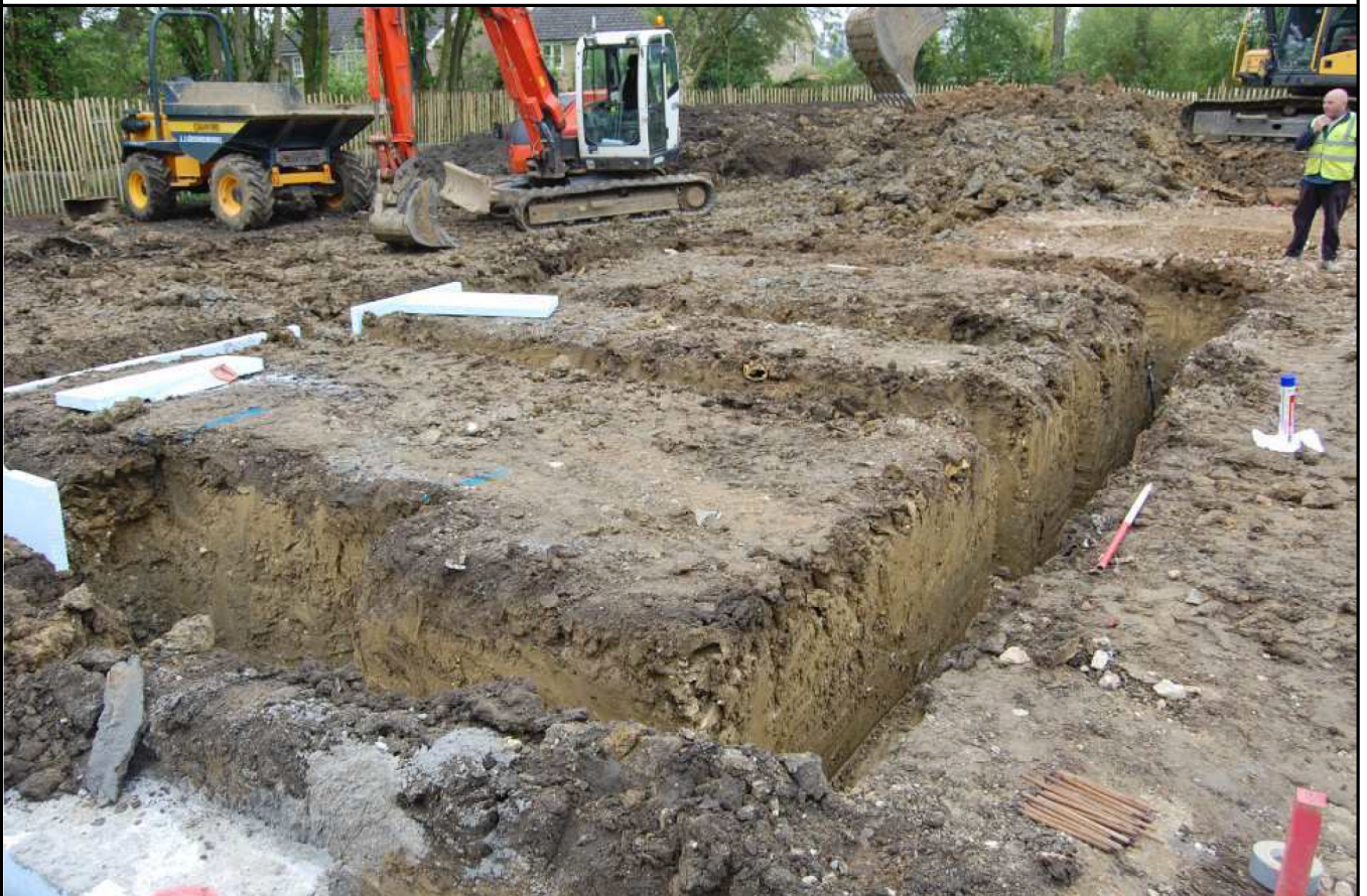
Plate 6: Footing trenches for plot 3, looking northeast.