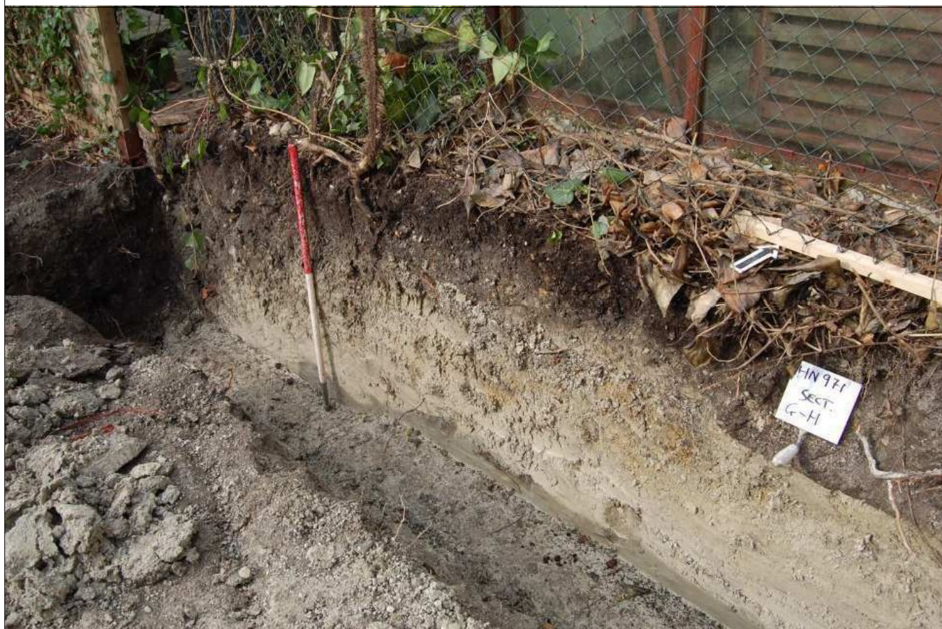
Plate 6: Section 5, looking northwest.