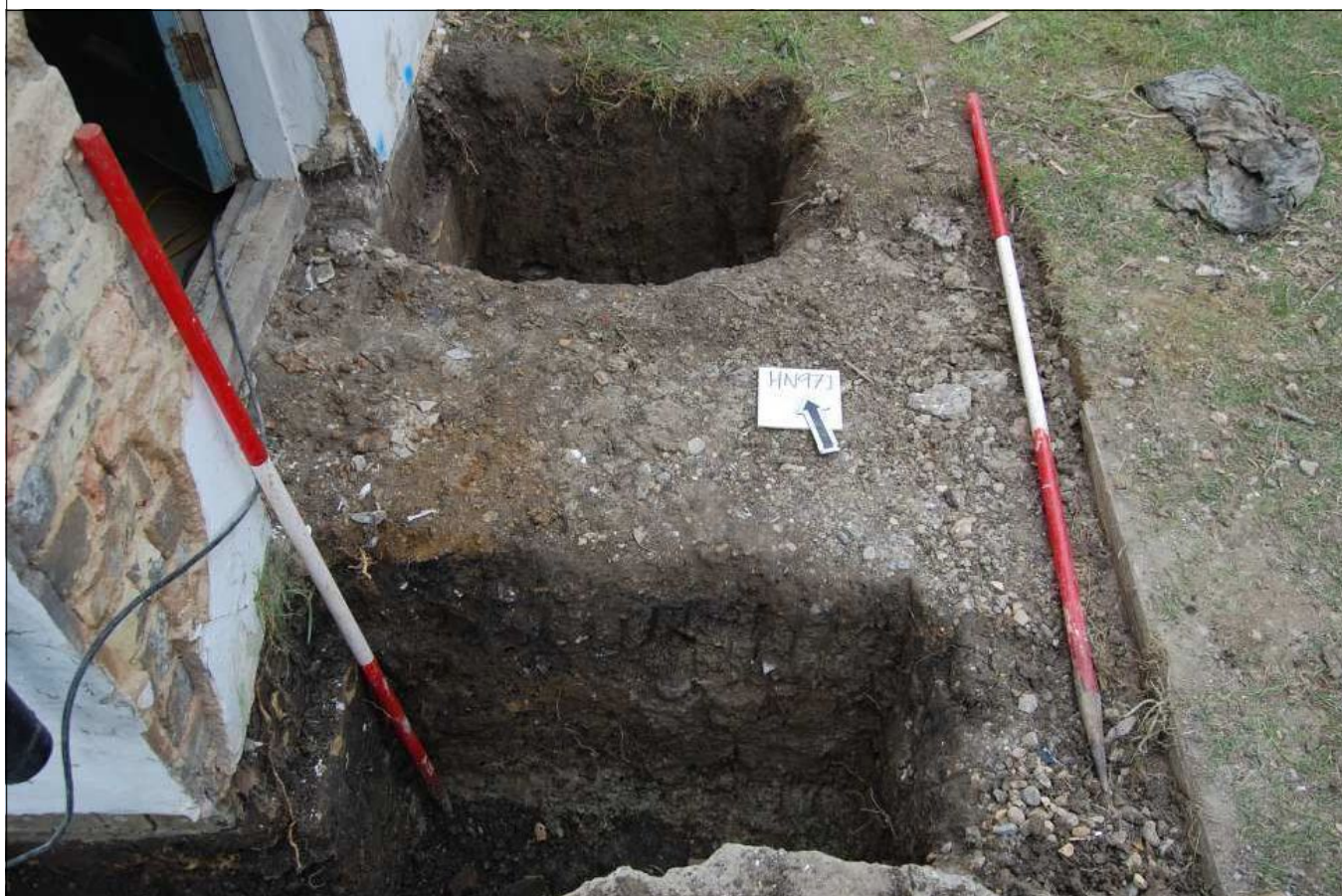
Plate 8: Porch footings, looking north.