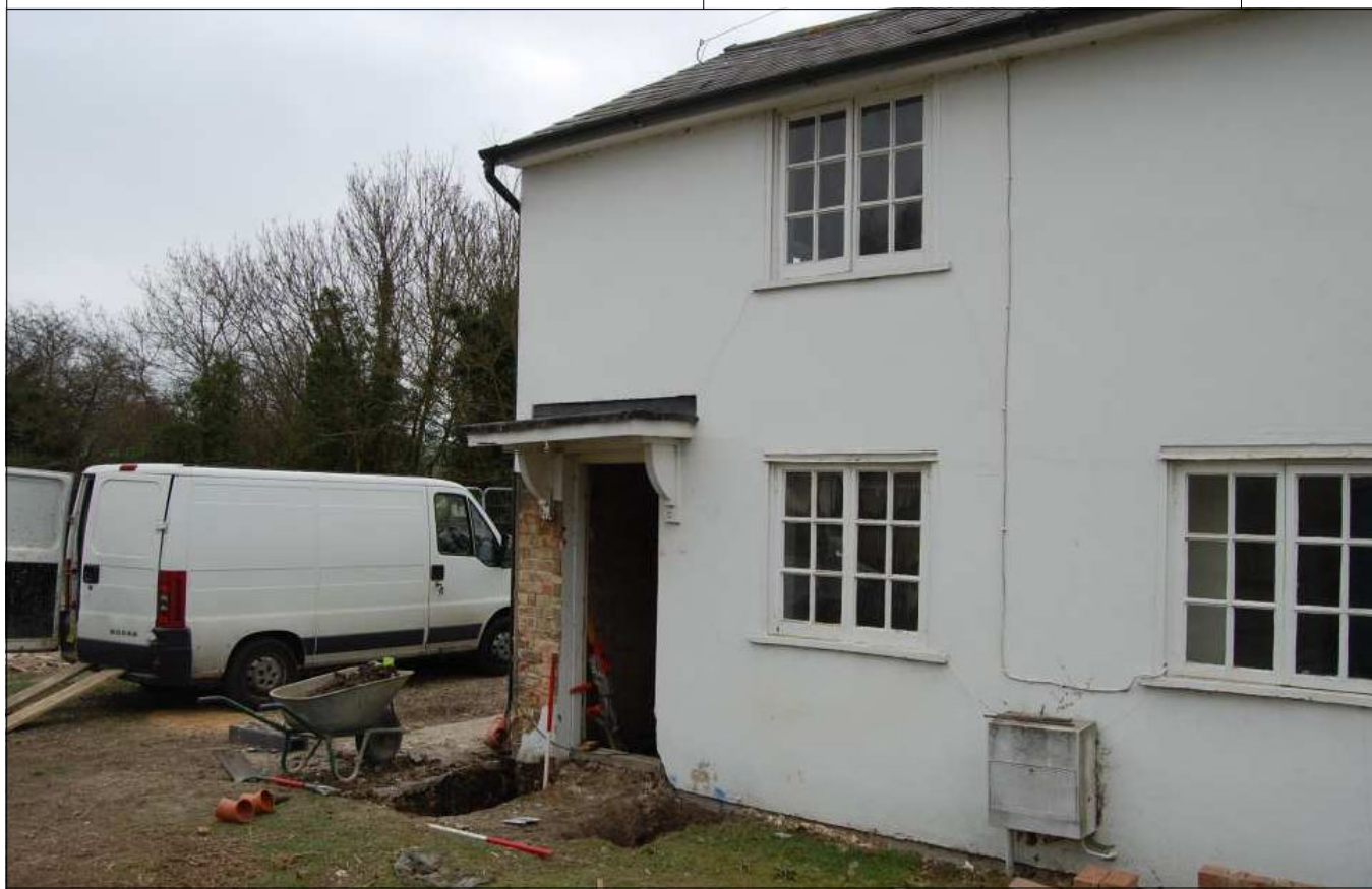
Plate 7: General view of porch footings, looking southwest.