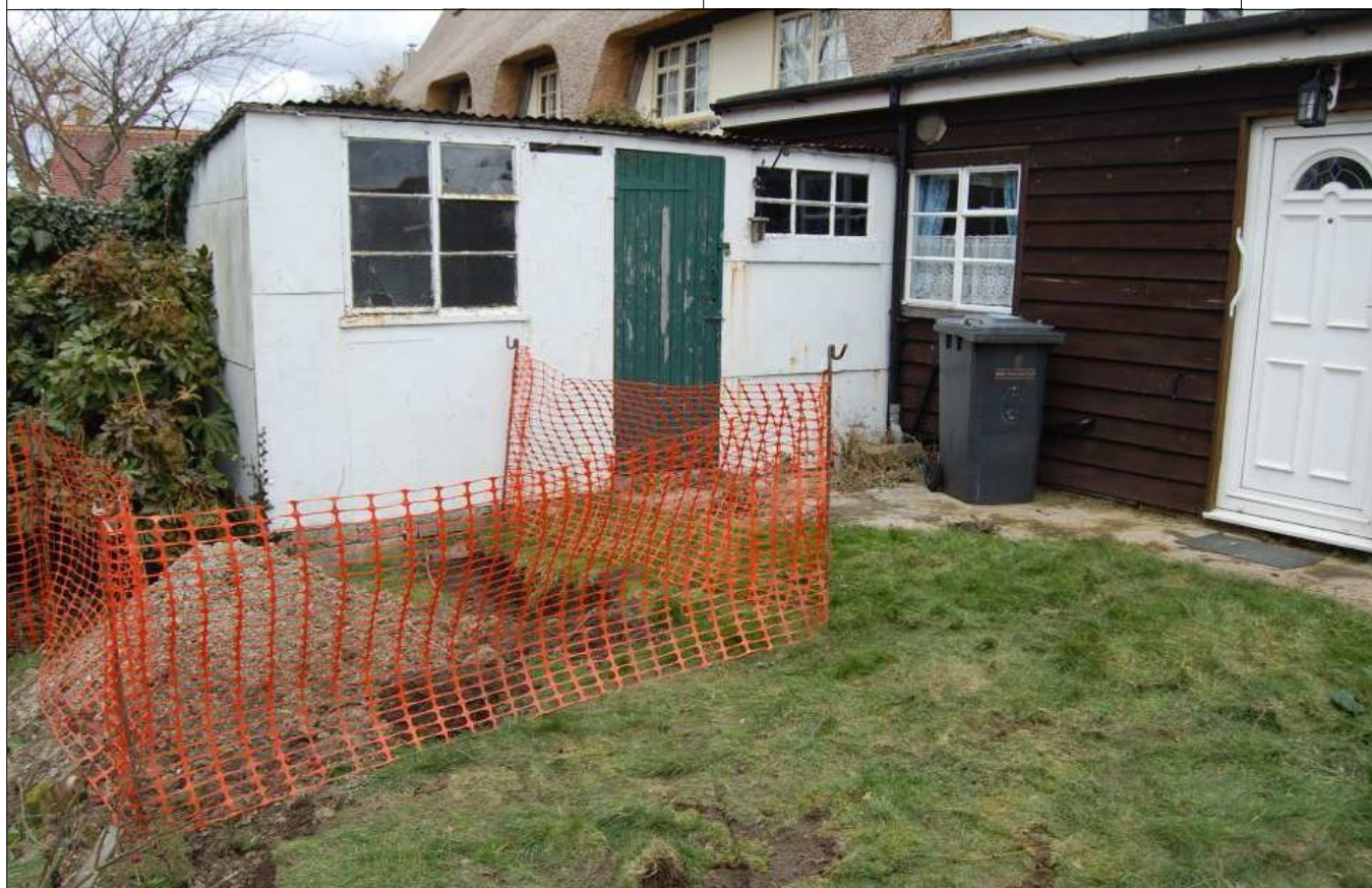
Plate 1: General view of site during test pitting, looking northeast.