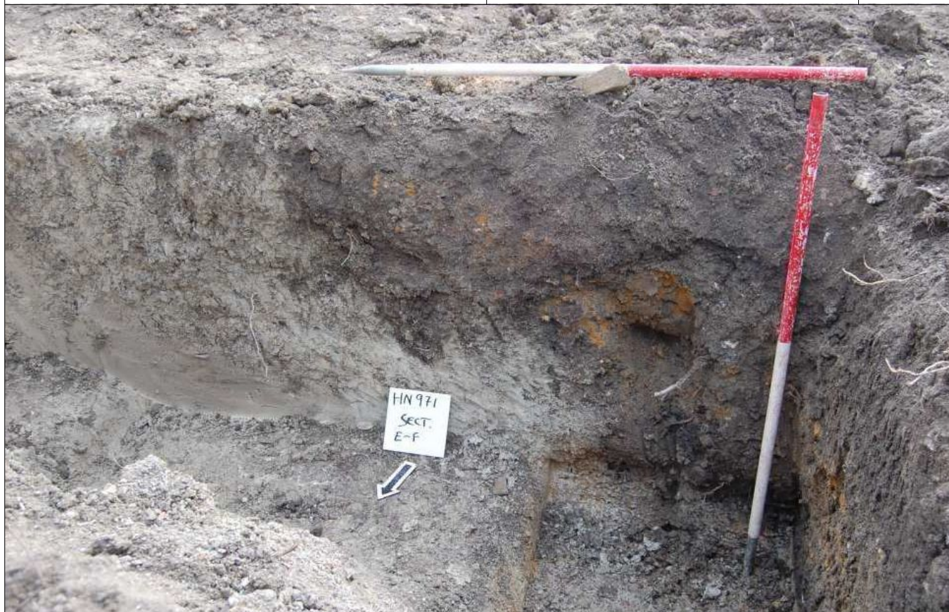
Plate 5: Section 4, looking south.