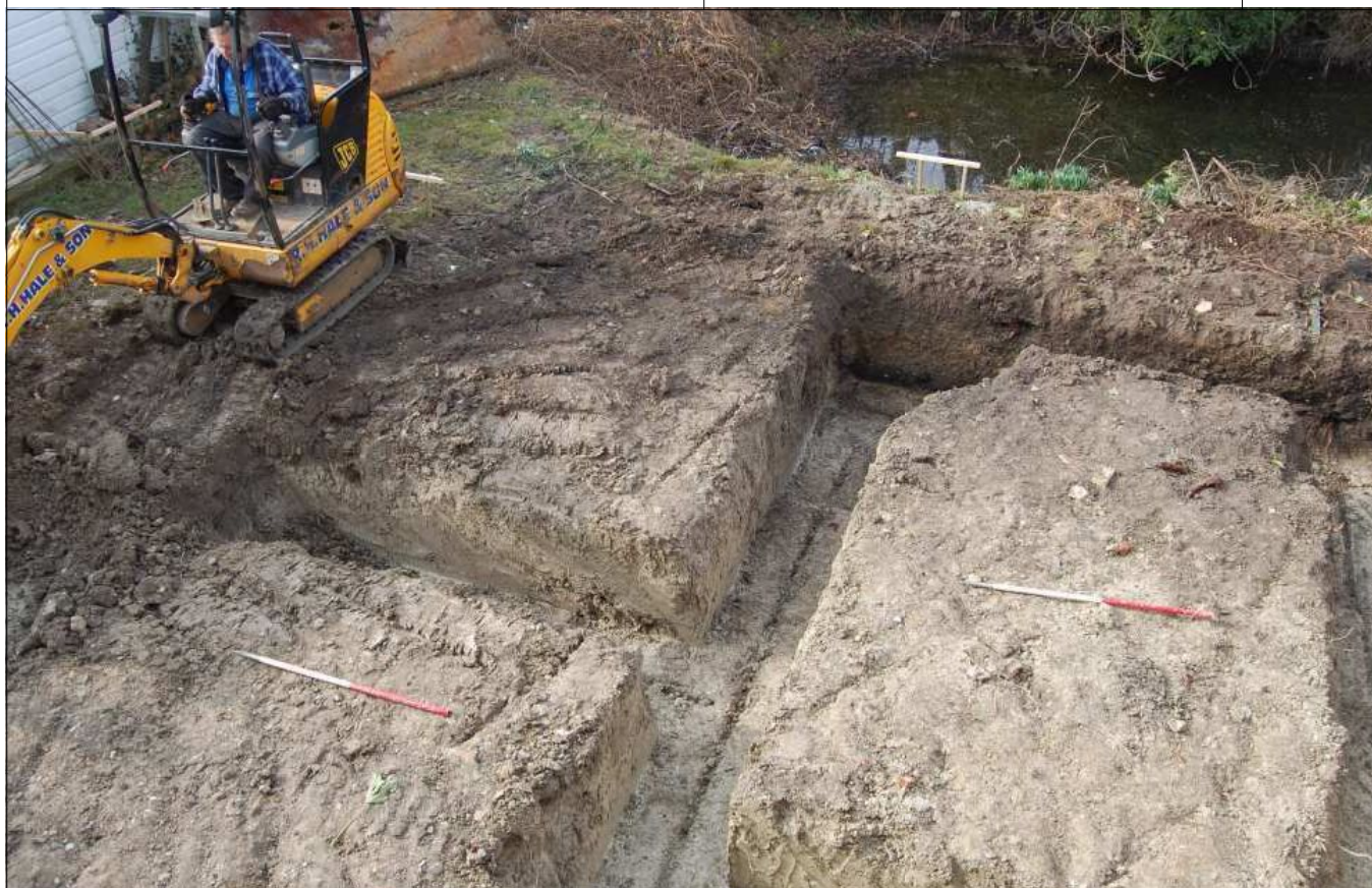
Plate 3: General view of extension footings, looking west.