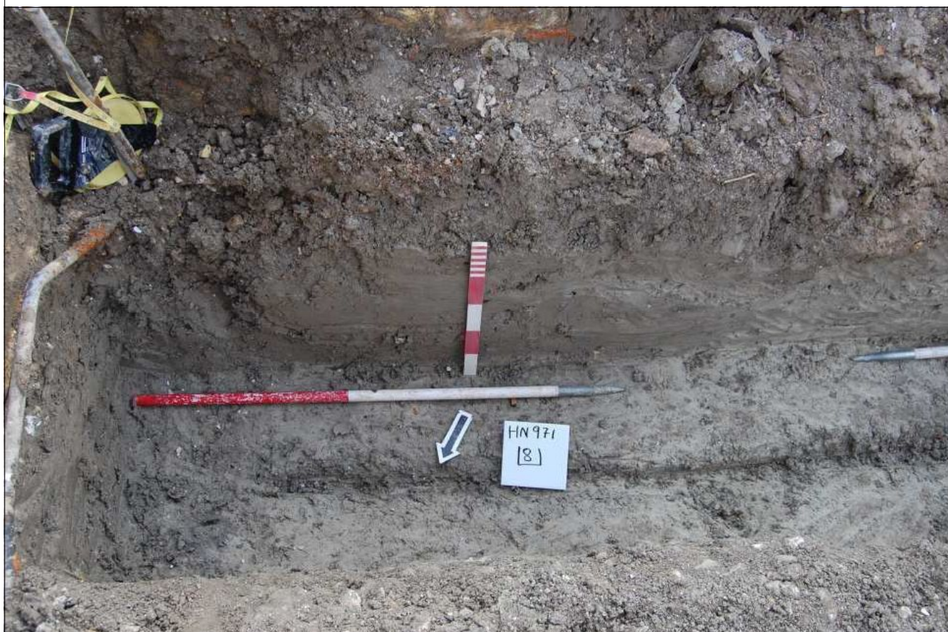
Plate 4: Section 3, looking south.