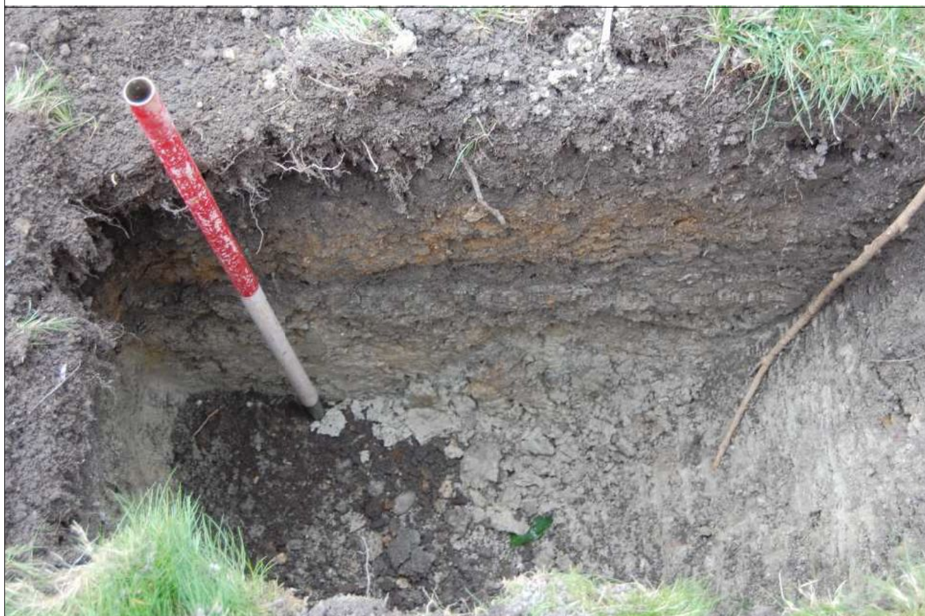
Plate 2: Test Pit, looking west.