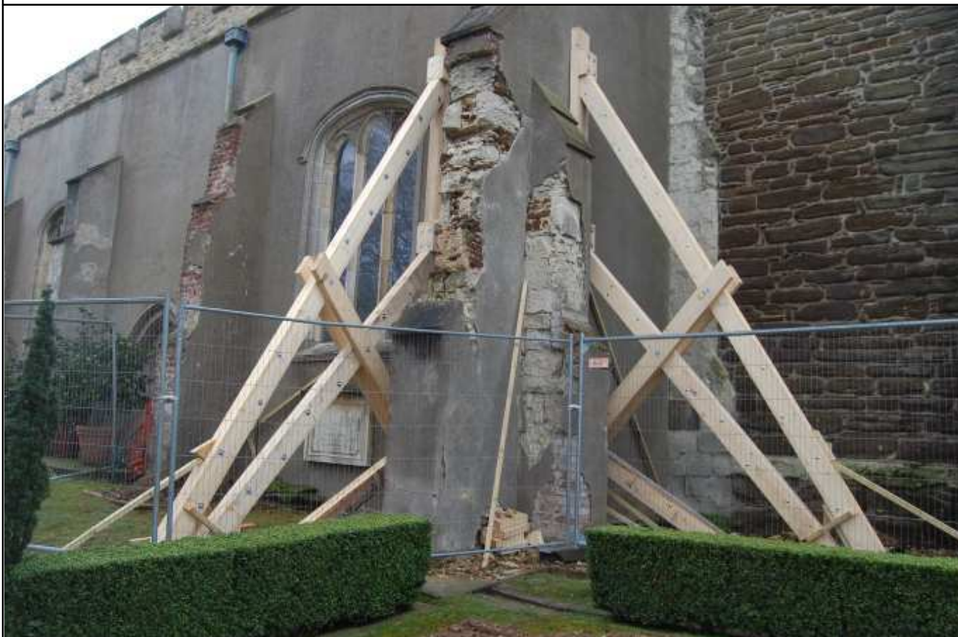
Plate 2: Buttresses with wooden braces in place, looking southeast.