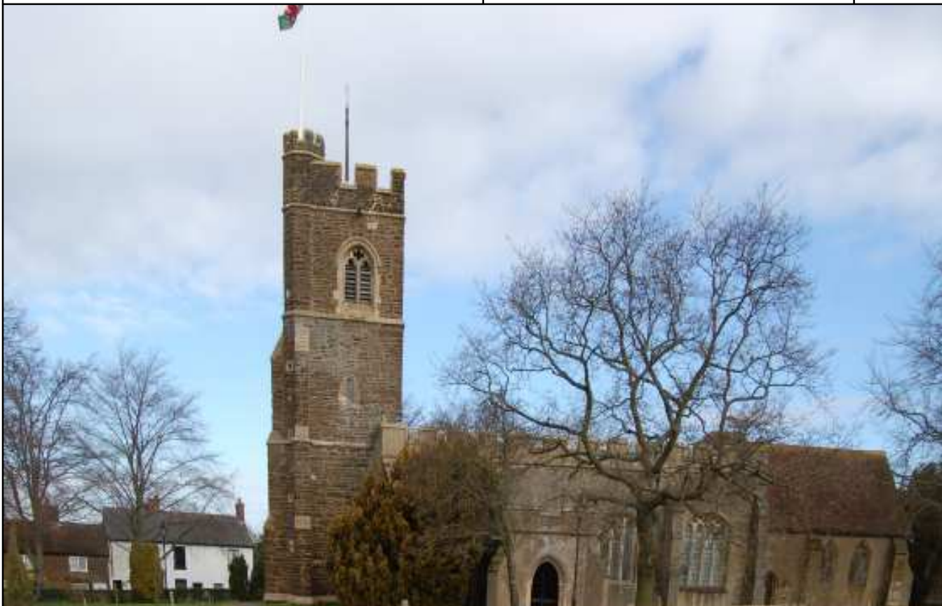
Plate 1: The Church of St Mary the Virgin, looking north