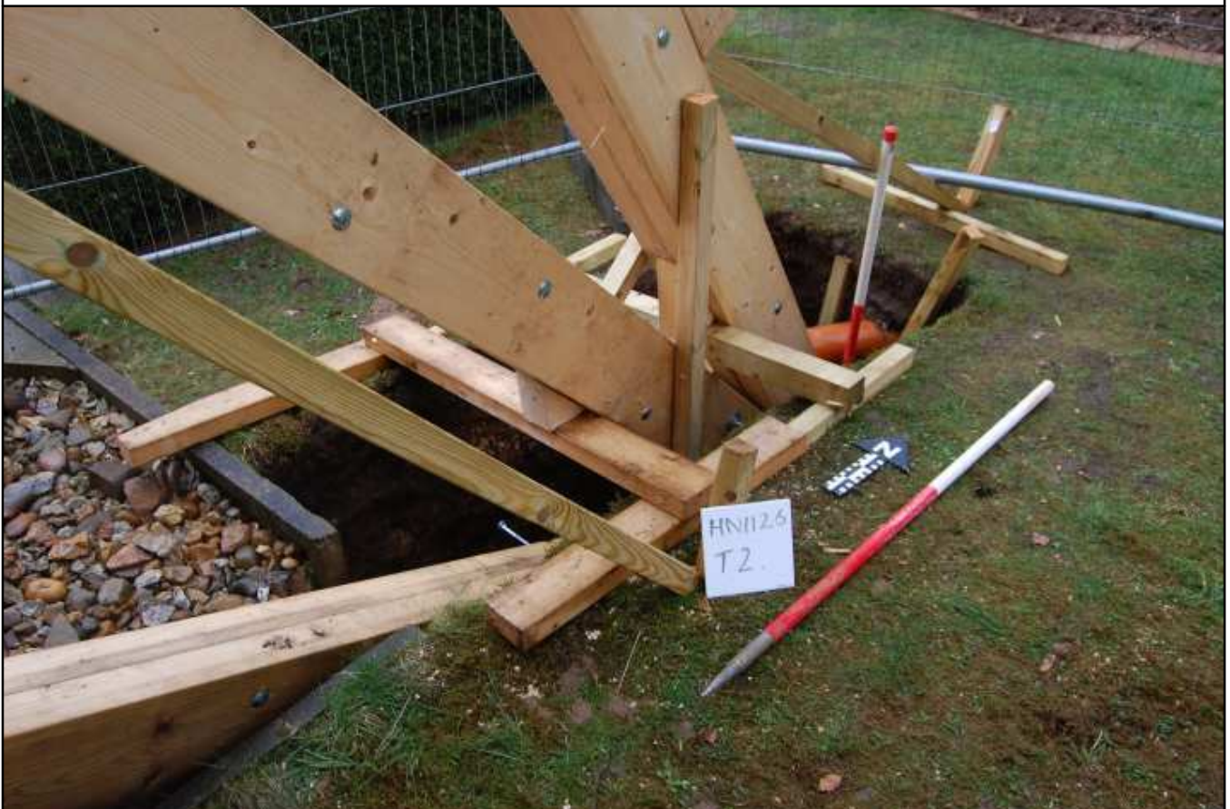
Plate 4: Trench 2, showing wooden brace in place, looking northwest