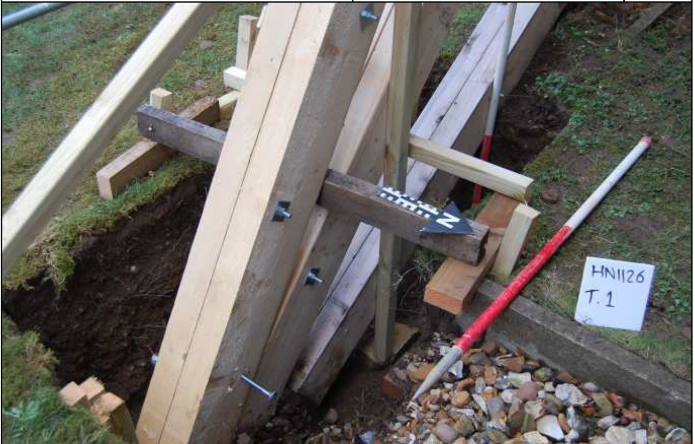
Plate 3: Trench 1, showing wooden brace in place, looking northeast