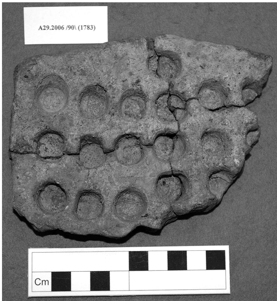
Fig. 1. Bath Lane, Insula XIII, fragments of 'flan tray' used for melting pellets of equal weight for LPRIA coin production. The complete tray is likely to have had an arrangement of seven by seven plus one indentations.

During the later first or early second century AD, a substantial masonry building with walls up to 1.3m thick was constructed across much of the site, following land reclamation on the western, riverward side. Waterlogged timbers situated west of the building at the ends of the main wall axes and consisting of reused oak timbers placed in shallow cuts in the river gravels may have functioned as scaffolding bases associated with the construction. The central structure, comprising a rectangular building with apses on its western and southern walls, is very similar in size to the southern caldarium of the Jewry Wall public baths