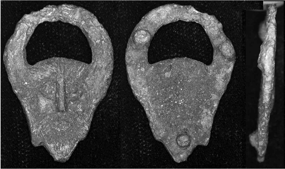
Fig. 9. Copper alloy Mount LEIC-40DB05.