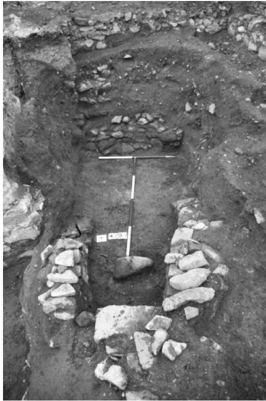
Fig. 4. Medieval Oven at Great Central Street