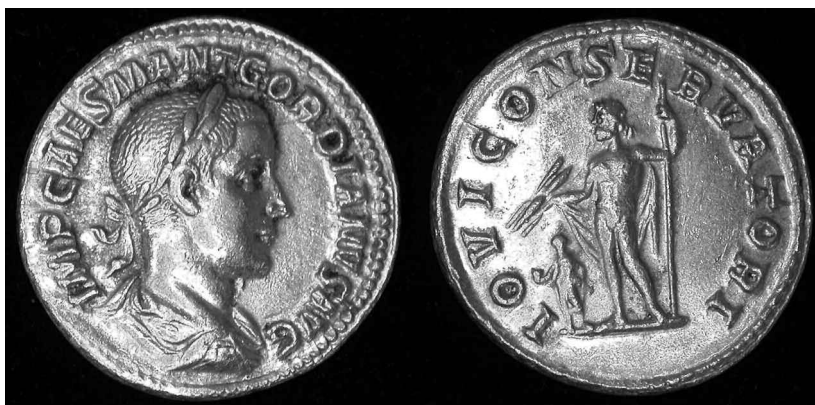
Fig. 8. Gold Aureus of Gordianus, LEIC-196037.

Gold Aureus of Gordianus , LEIC-196037. (Fig. 8)