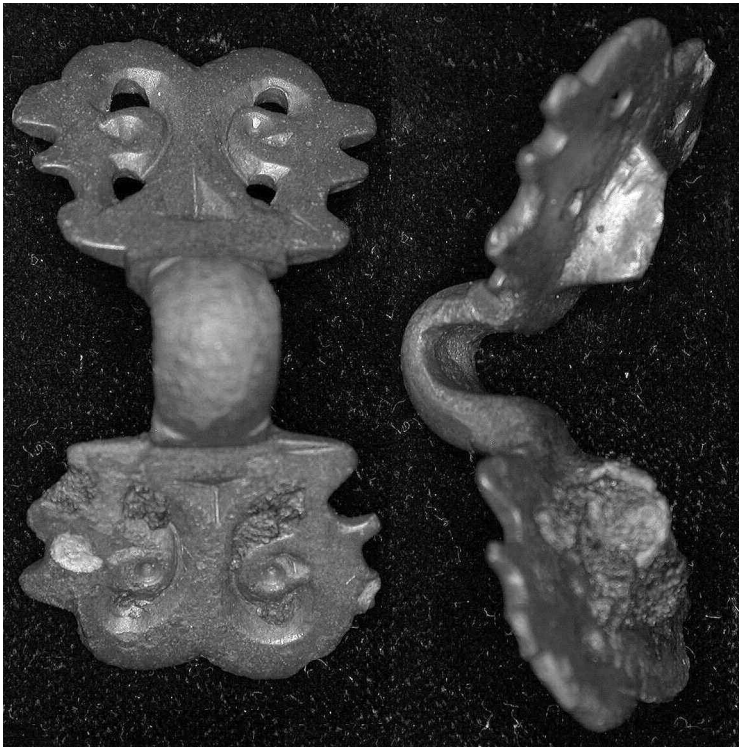
Fig. 10. Brooch LEIC-380105.