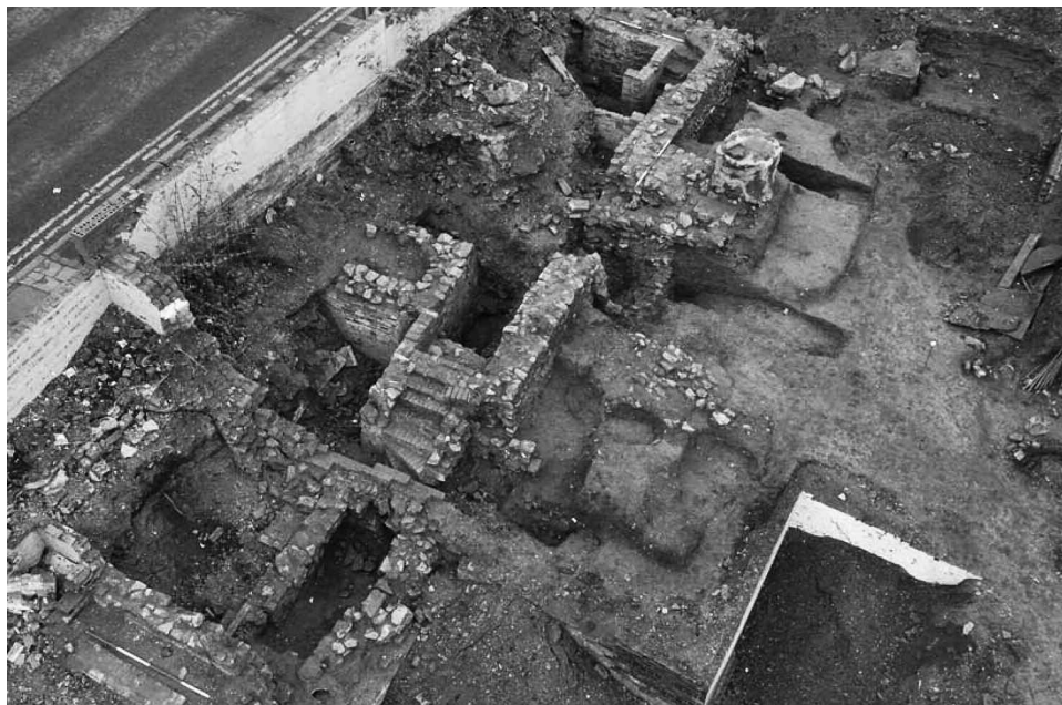
Fig. 3. Aerial view of southern part of the Great Central Street showing late medieval building.

At the north end of the site, three successive phases of frontage wall were identified, each one closer to the current road. The earliest has been robbed out, with the latest serving as the foundation to the factory wall. One of the frontage buildings revealed evidence for copper alloy working, including a crucible and a potentially contemporary stone-lined hearth. Beneath this were two ovens, one of which lies beneath the frontage walls (Fig. 4). Other medieval structures included oval and tear-drop shaped wells set 3m apart, two stone-lined cess pits, and a number of stone cellars (some of which had been robbed) and part of the rear wall to a property that would have fronted on to Preachers Lane to the west. A length of Roman street with a kerb on its northern edge was recorded running westwards, perpendicular to the north/south line of the Roman street leading to the North Gate (which is assumed to lie directly beneath Highcross Street, or perhaps running or extending alongside its eastern edge as observed further south close to the junction with Freeschool Lane ( TLAHS 81, 181 and Fig 5). The length of east/west Roman street and the medieval cellars sealed a mid first to mid second century sequence comprising a timber framed rectangular building and later compacted sand floors with occupation levels between. This represents the most easterly occurrence of first century activity in the town to date. A13.2006