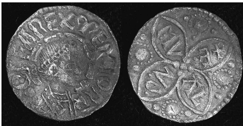
Fig. 11. Penny of Offa LEIC-94EB56.