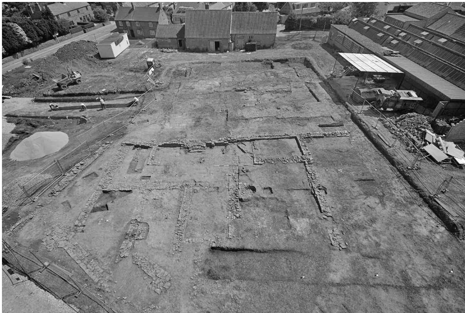
Fig. 6. Aerial view of the site looking east, showing the foundations of the manor house during excavation.