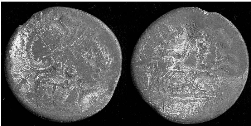
Fig. 7. Republican silver denarius, LEIC-BA55E4.