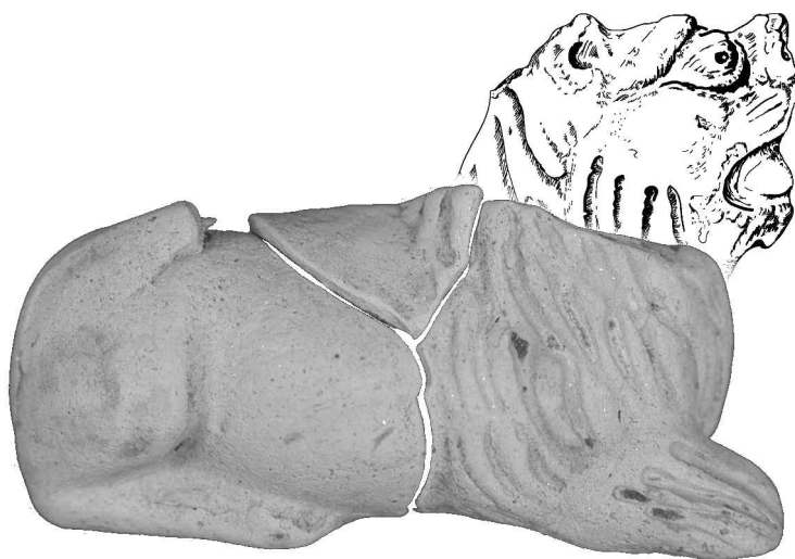
Fig. 5. Rearsby bypass site 6: composite picture of ceramic lion figurine with illustration of the head taken from a complete example excavated at Baldock, Herts. (Stead and Rigby 1986, fig. 96.1).

The unstratified find of a figurine or possibly a small flagon in the form of a lion was a remarkable find in terms of its rarity and early date (Fig. 5). Paralleled at Baldock, Hertfordshire (Stead and Rigby 1986, fig. 96.1), the object may have held a small amount of perfume or oil and had an origin in the Allier Valley in Central Gaul which is the suggested production site for four known French examples. Such figurines would have been imported from Central Gaul alongside other fine ware pottery (including small numbers of glazed vessels) as evidenced at Baldock and Colchester and although such wares get to Leicester in the second