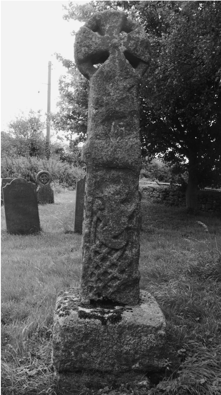
Fig. 4. The Sproxton cross, in the churchyard of St Bartholomew's church.