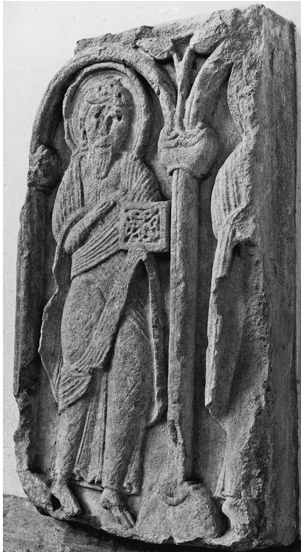
Fig. 11. Ecclesiastic or Apostle figure, probably from a shrine or sarcophagus from Castor.

their decoration and fittings – as certainly is the case at Repton – and the remarkable group of figural panels and friezes (mentioned above), centred on Peterborough, and reflected at Breedon, Castor and Fletton, with, most recently, the sculptured shrine at Lichfield (Rodwell et al. 2008). The style of these panels, sarcophagi and friezes were something totally new in Anglo-Saxon art, and I