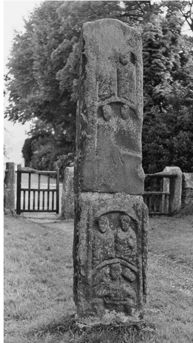
Fig. 7. The Bradbourne cross, Derbyshire.

A group of crosses (some complete) in the Peak District at Eyam, Bakewell Wirksworth and Bradbourne (Fig. 7; and Hawkes 2007a, figs 24–7), along the Derwent valley, have been convincingly interpreted as coinciding with the boundary of the people known as the Pecsaetan (Sidebottom 1994, 226, fig. 17; Sidebottom 2000) and as marking out important estates. Nevertheless, they can also be seen to bear complex Christian messages and could be not only foci for devotion, but could have enhanced the message of Christian teaching in their