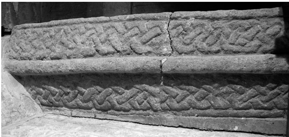
Fig. 13. Redmile grave cover.

explored by Lesley Abrams. In addition, in a series of essays in The Cross Goes North (Carver (ed.) 2003), conversion processes are considered across northern Europe.