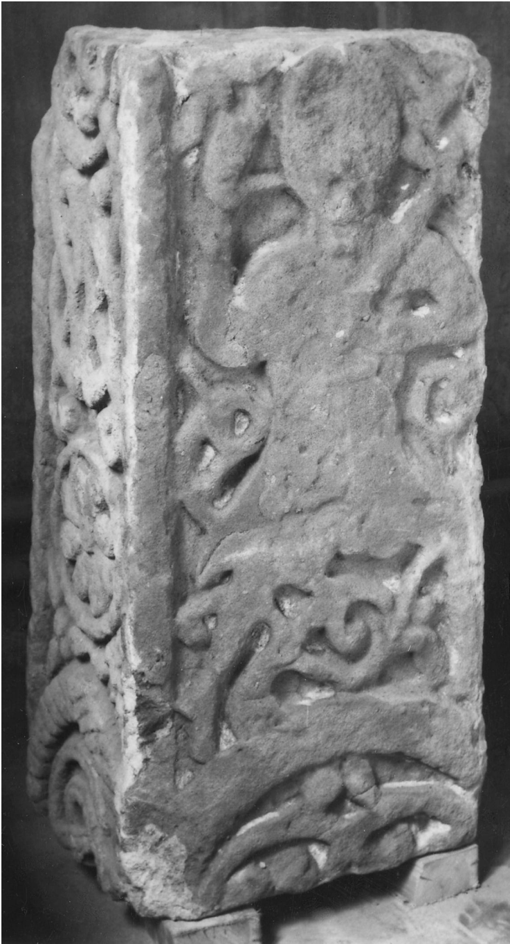
Fig. 2. Part of the Asfordby cross shaft, with the figure of Christ in Majesty.