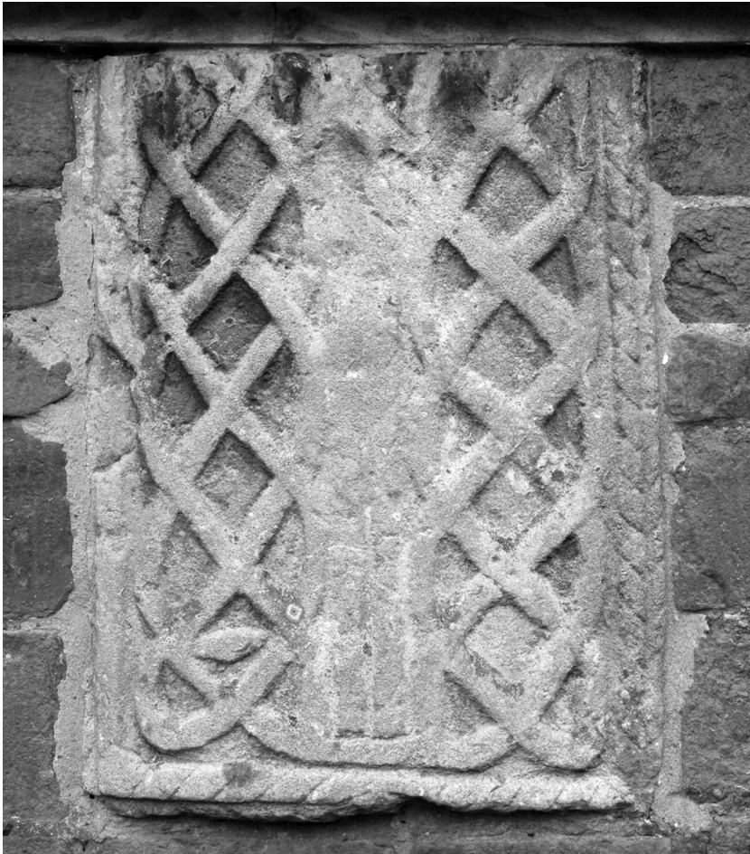
Fig. 3. Part of the grave-cover built into the exterior of the church of St Michael and All Angels, Harston.