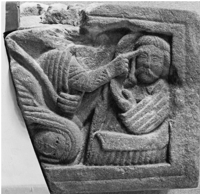
Fig. 8. Fragment from Great Glen and detail from the top of the shaft, Rothbury, Northumberland, showing The Raising of Lazarus, or the opening of the eyes of the man born blind.