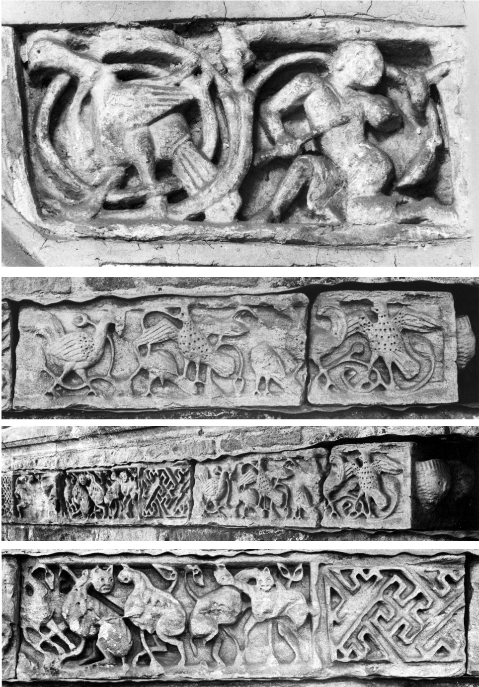
Fig. 12. Breedon friezes.