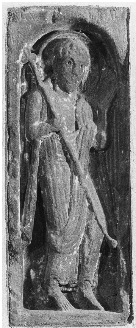
Fig. 10. Panel with angel figure from Fletton.

A considerable amount of recent research has also been concerned with the functional location of stone crosses. Phil Sidebottom has stated that it ‘seems strange (although, admittedly, not impossible) that the first examples of Mercian free-standing monumental art in stone were restricted to a marginal region of such a great kingdom and not displayed at its principal centres such as Tamworth, Lichfield (Staffs) or Repton (Derbys)’ (Sidebottom 2000, 215–16). What may be distinctive of such centres, however, could be the architecture of their churches,