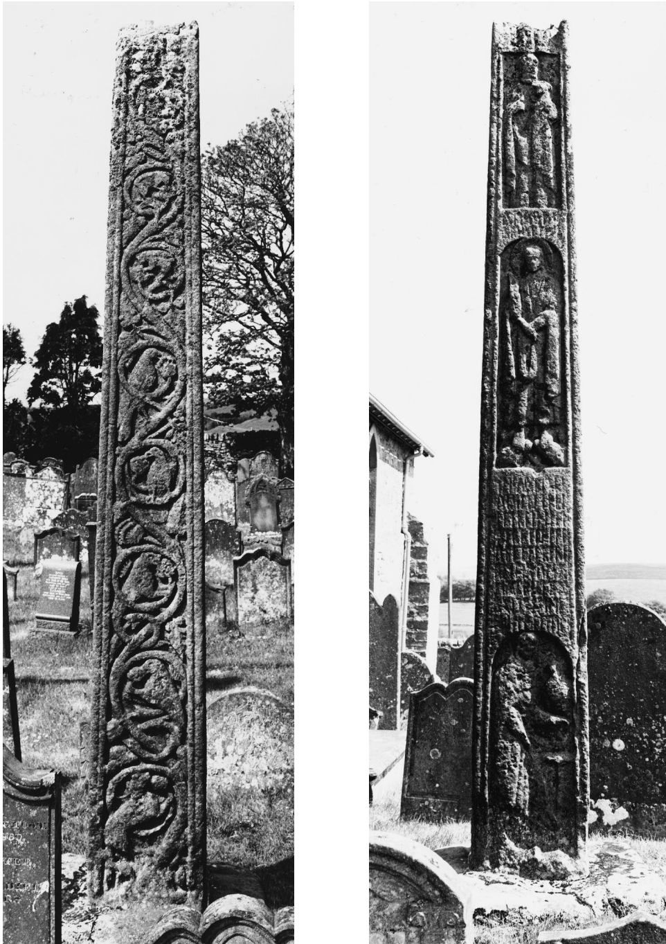
Fig. 6. East and West faces of the Bewcastle cross (Cumbria).