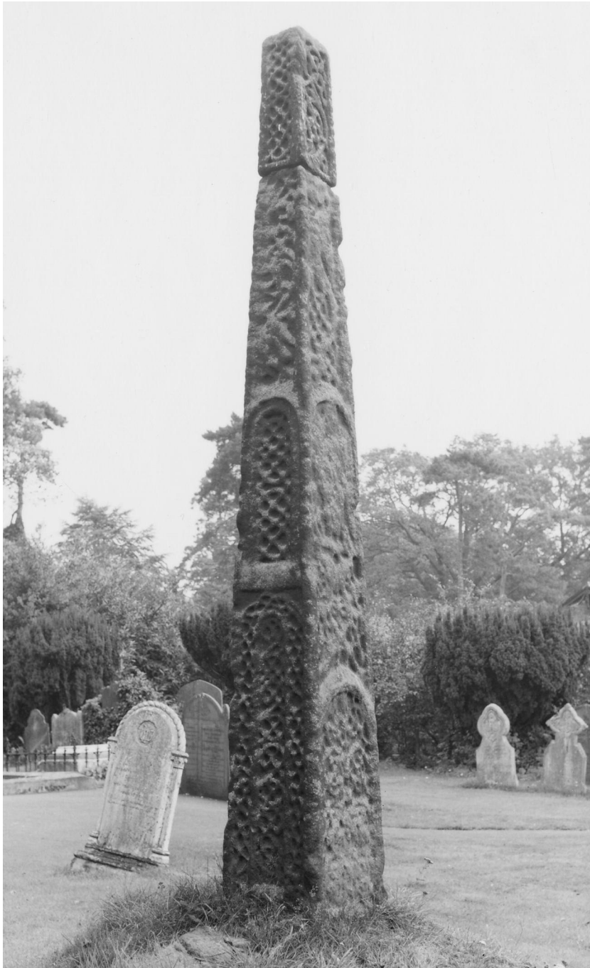
Fig. 1. The Rothley cross, in the churchyard of the parish church.