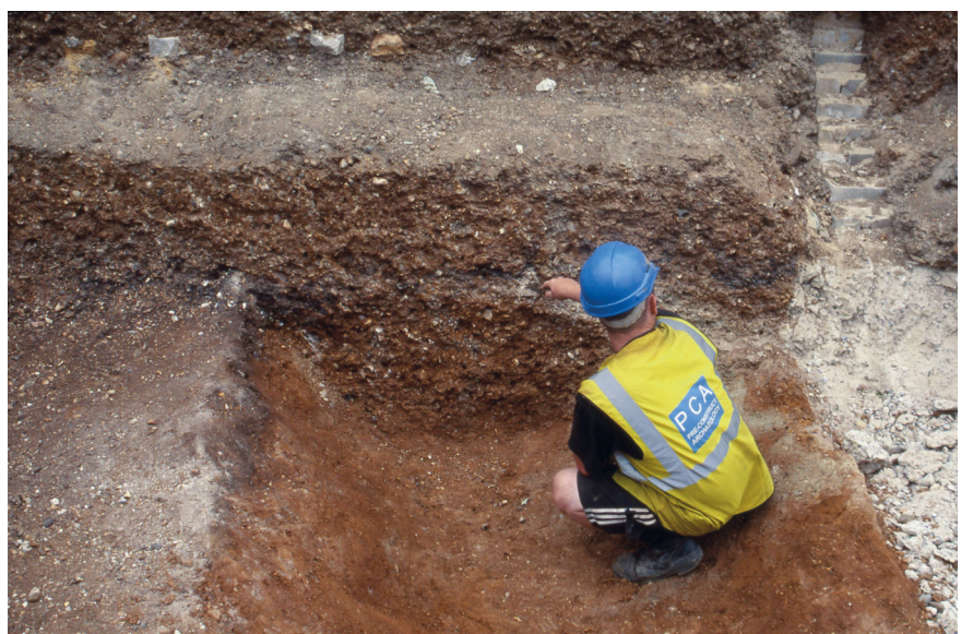
Fig. 4: section across roadside ditch, facing north-west

Thereafter a new road surface (Phase 3 Road) was laid, whose function may be assigned with more certainty. The surface, which was composed of extremely compact metalled gravel layer, partially sealed the silted up or backfilled eastern ditch. This road surface was approximately 7m wide and was up to 350mm thick,