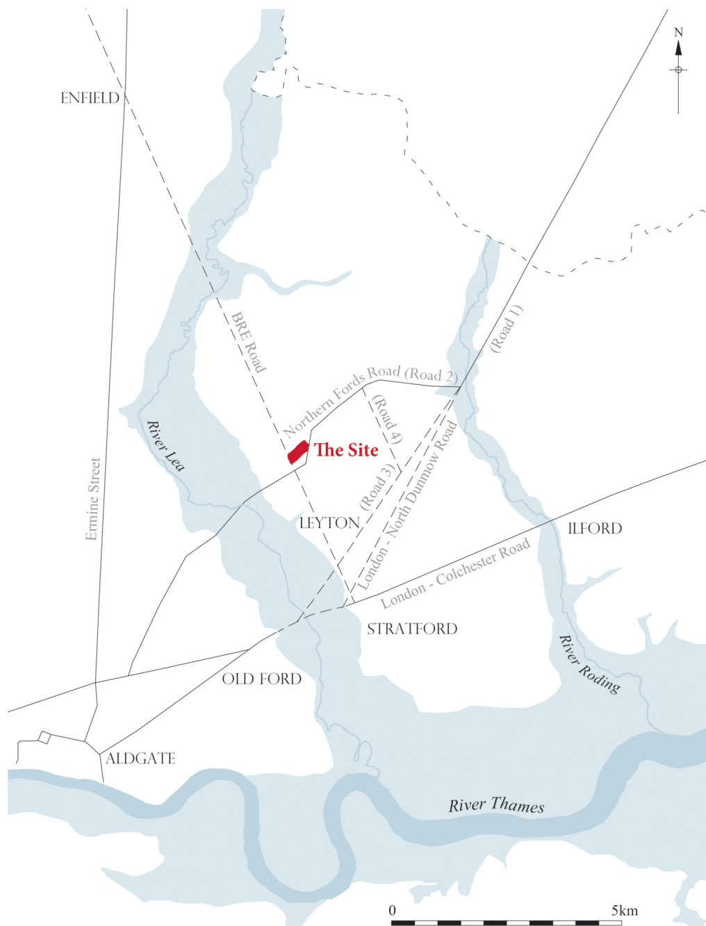
Fig. 6: Roman roads in the vicinity of the site

(Fig. 6, Road 2) located to the west of the Great Dunmow road and taking a somewhat circuitous route. 6 It should however be understood that physical evidence for either road is slight, their routes are largely conjecture, and in both cases the evidence is largely of the join-the-dots (find-spot) variety. To confuse the situation further, a more recent representation of the Great Dunmow road puts it to the east of that conjectured by Margary 7 (Fig. 6, Road 3).