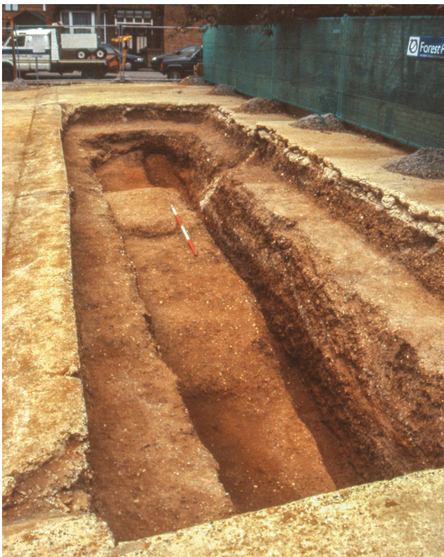
Fig. 5: Roman road, facing south-west

On first discovering this length of road, the excavators presumed it to be part of the London to Great Dunmow road (Fig. 6, Road 1). Ivan Margary described the whole of this route, Route 30, extending at least 49km (30miles) between Great Dunmow in Essex and the outskirts of London, relatively succinctly but without the aid of detailed archaeological evidence. 5 Ralph Merrifield agreed with the route of this road but reinterpreted some of the evidence to hypothesise that there was a second road in this area which he designated 'The Northern Fords' road