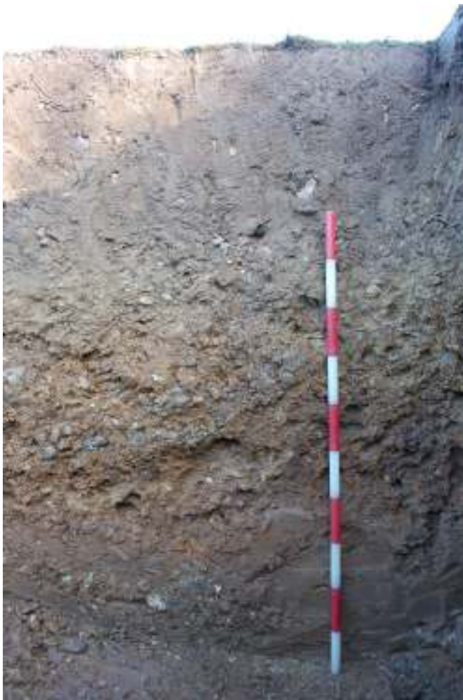
Fig.3: SW facing section through pit