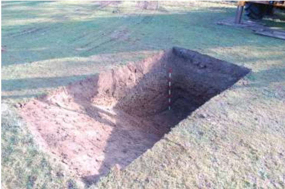
Fig.2: Excavated pit, view to E