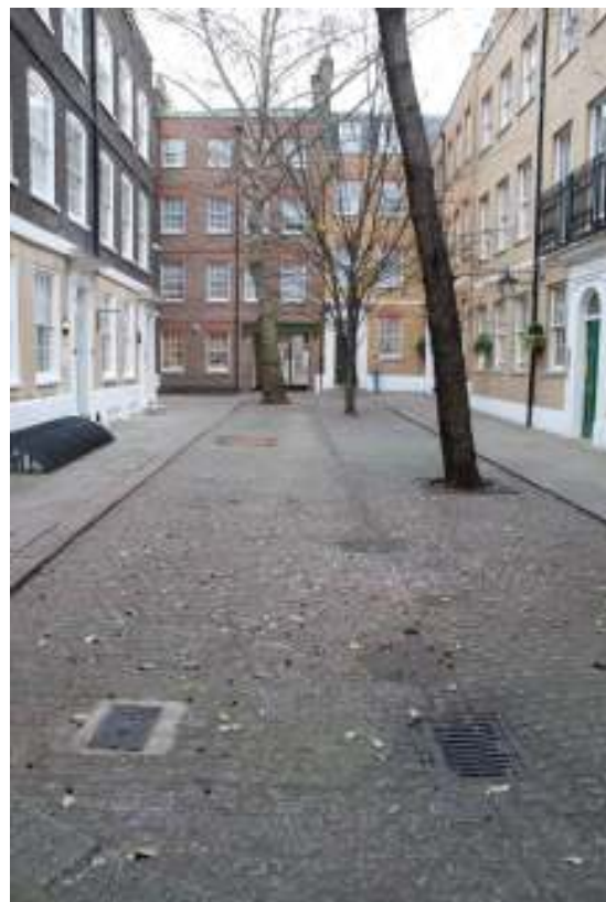
Fig.3: General location shot of tree pit, (left centre of frame). Wardrobe Place facing N