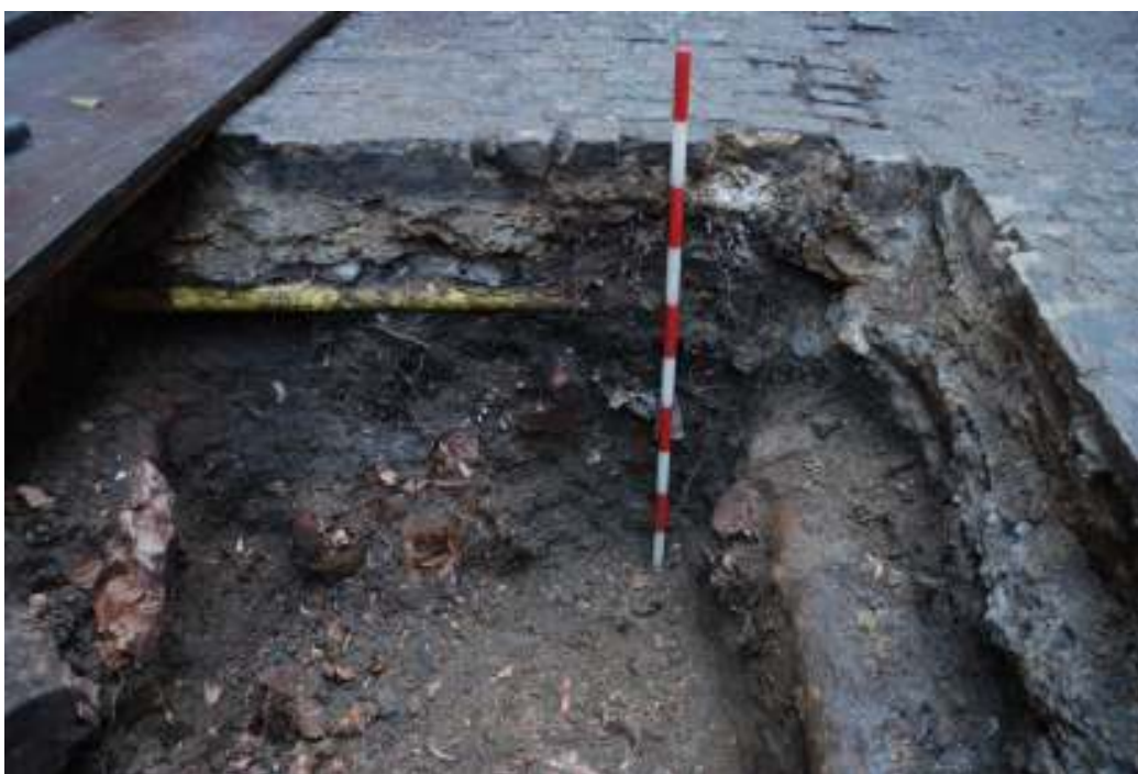
Fig.5: South facing section of pit, showing concrete layers and backfilled services along with tree roots