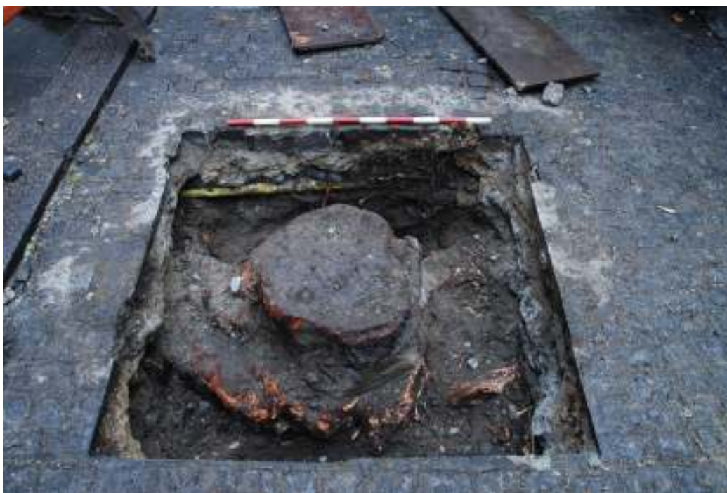
Fig.4: Exposed roots within the pit, mid excavation, facing N