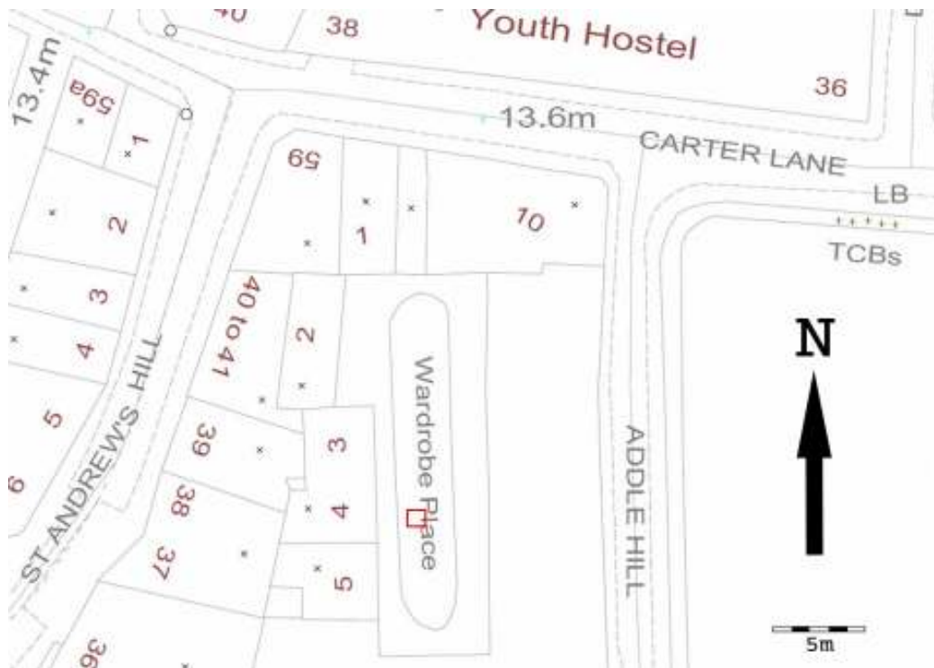
Fig.2: Location plan of tree pit