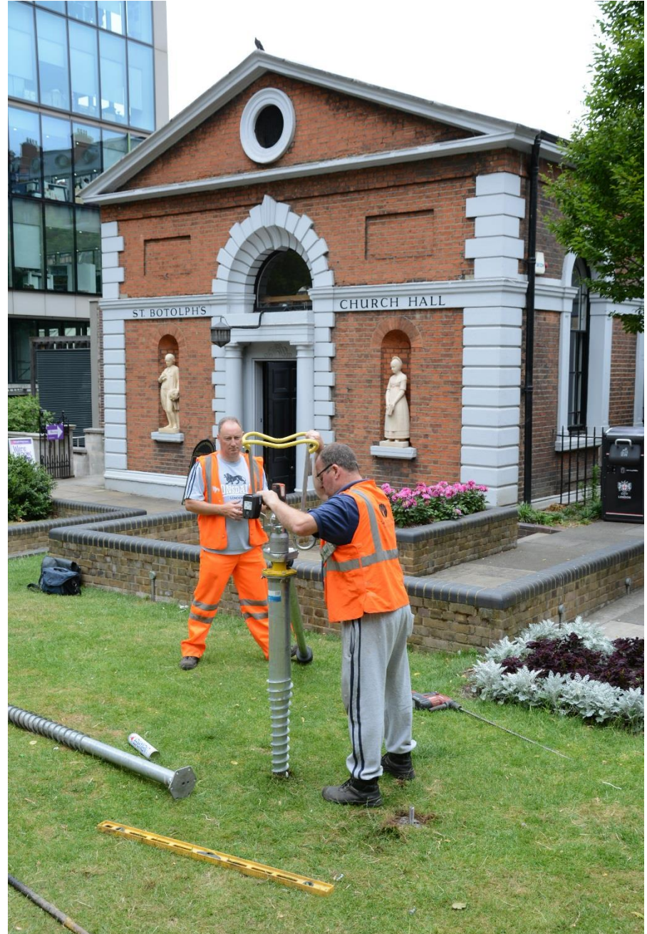
Installation of northeastern (on left) and northwestern foundation spikes, each 1.3m in length