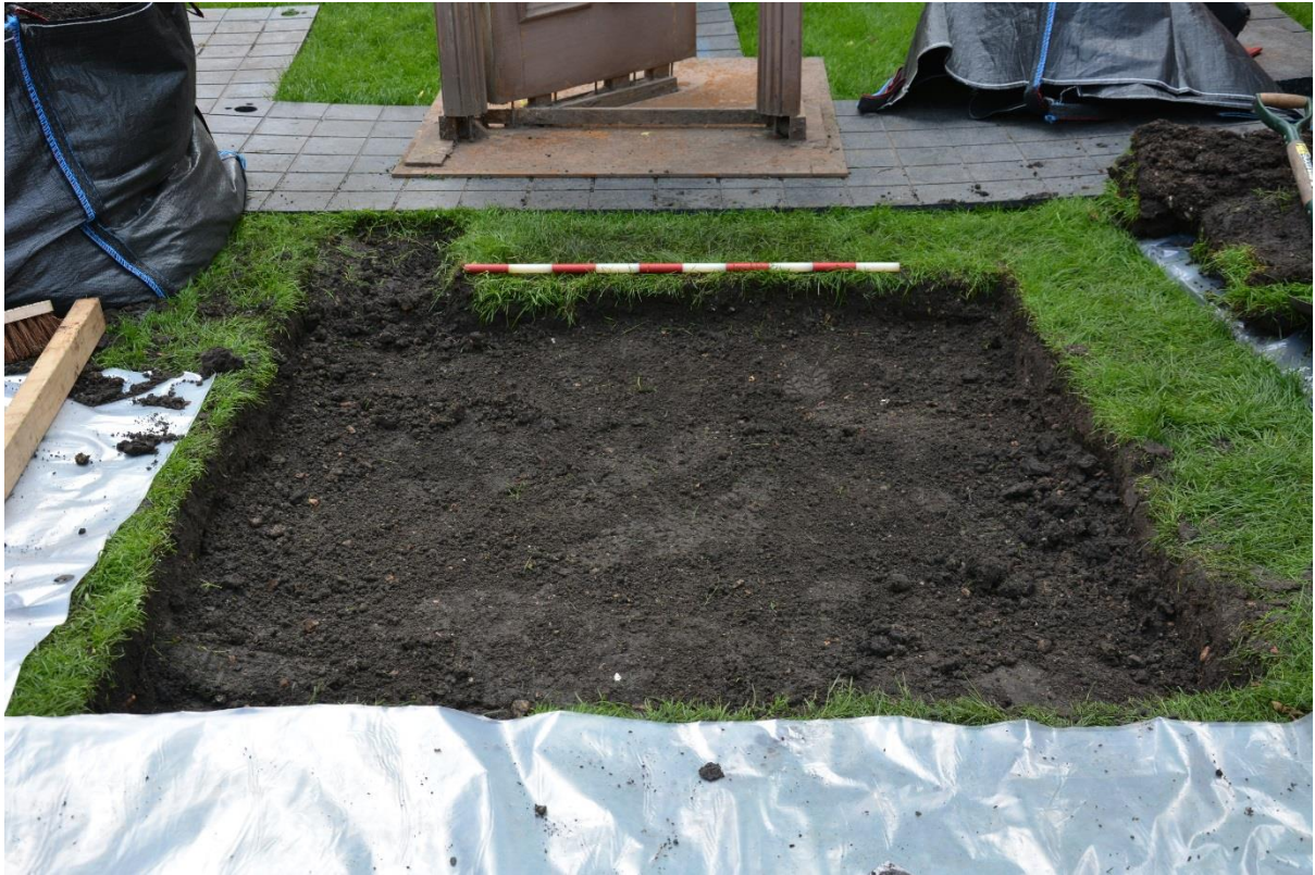
Pit for sculpture, facing ENE