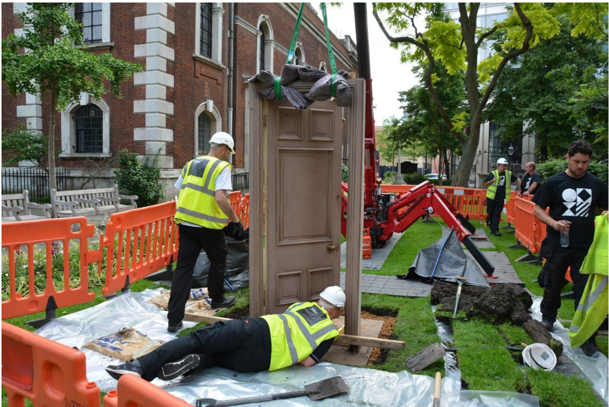
Sculpture installation, facing NE