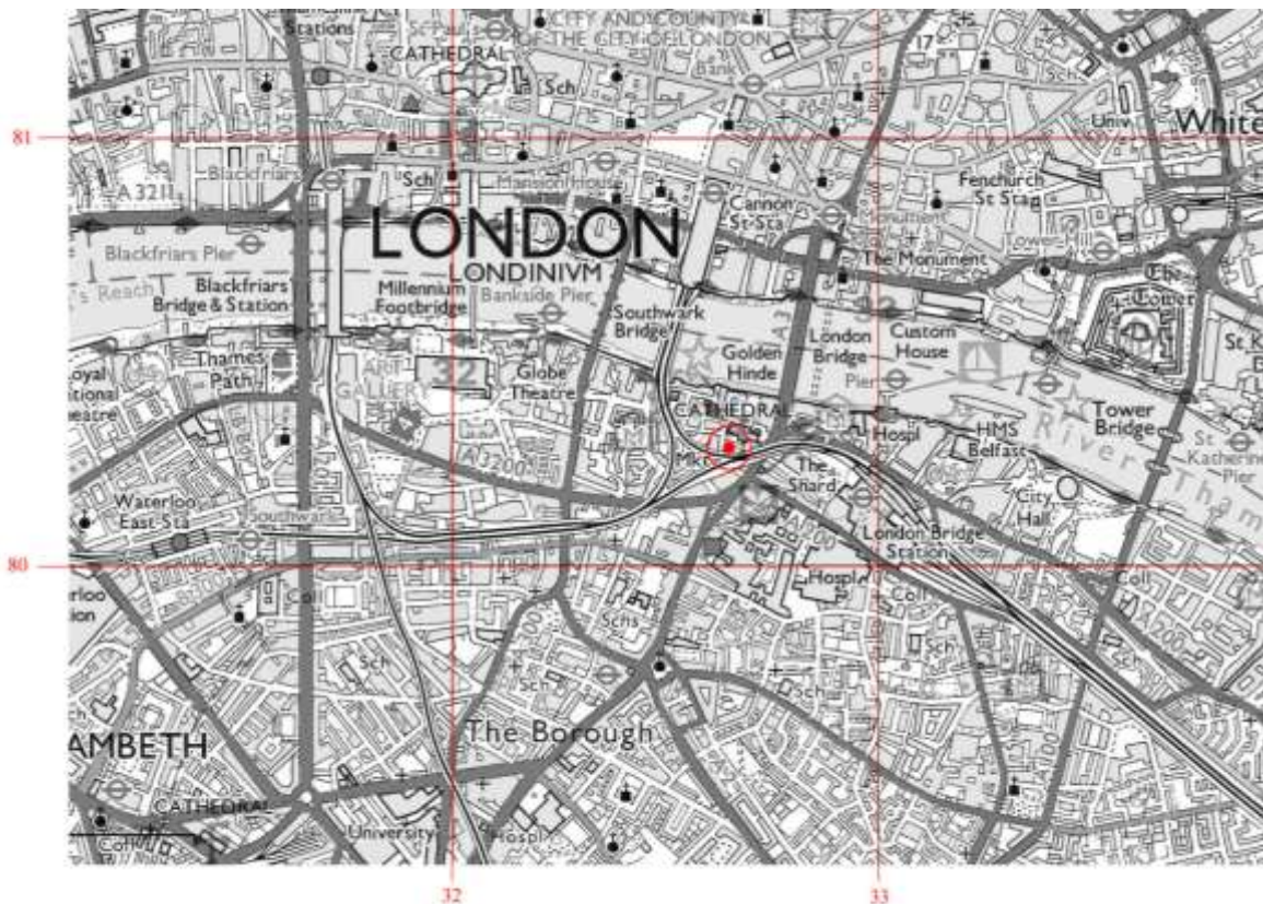
Figure 1: Site location, marked in red.