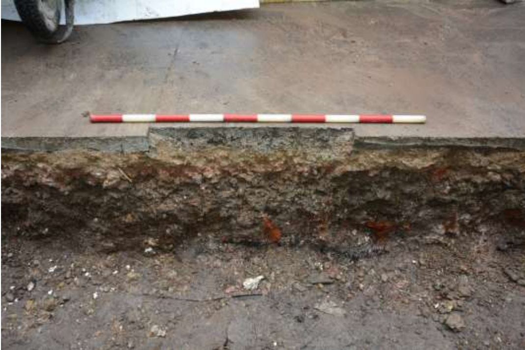
Figure 5: Sample of exposed stratigraphy observed in the south facing section. Facing N. Scale 1m.