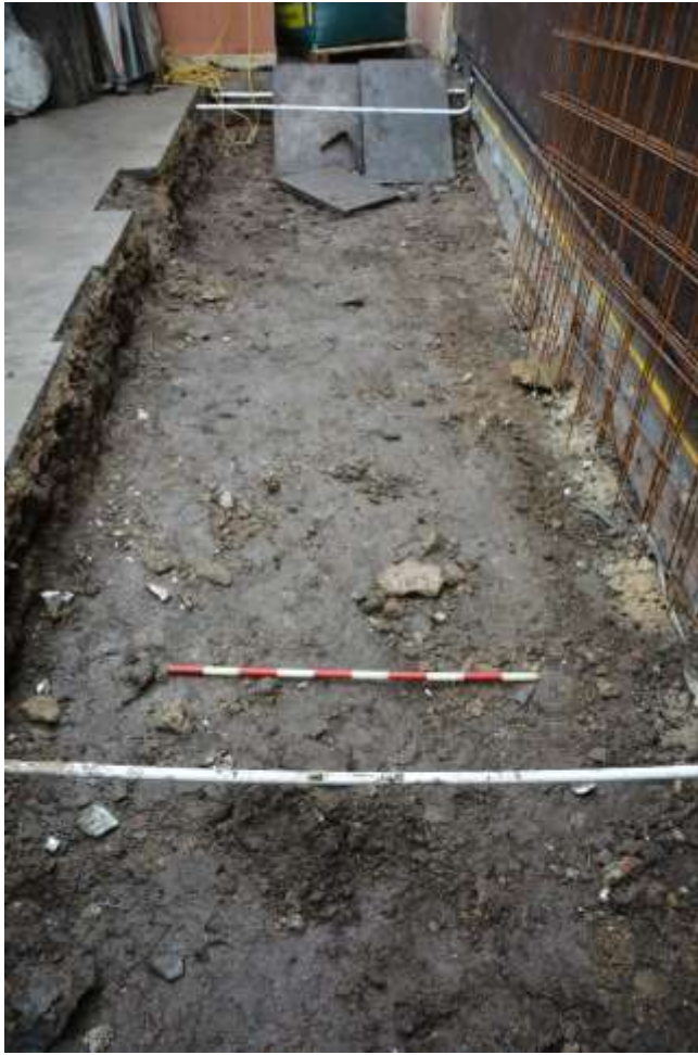
Figure 6: Completed trench and exposed services. Facing E. Scale 1m.