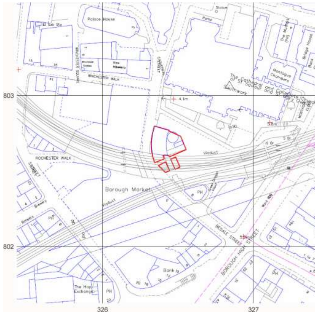
Figure 2: Site boundary, marked in red.