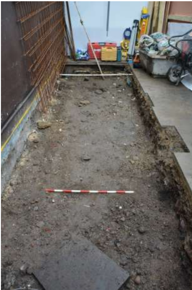
Figure 4: Completed trench. Part of the present building can be seen to the left of the frame. Facing W. Scale 1m.