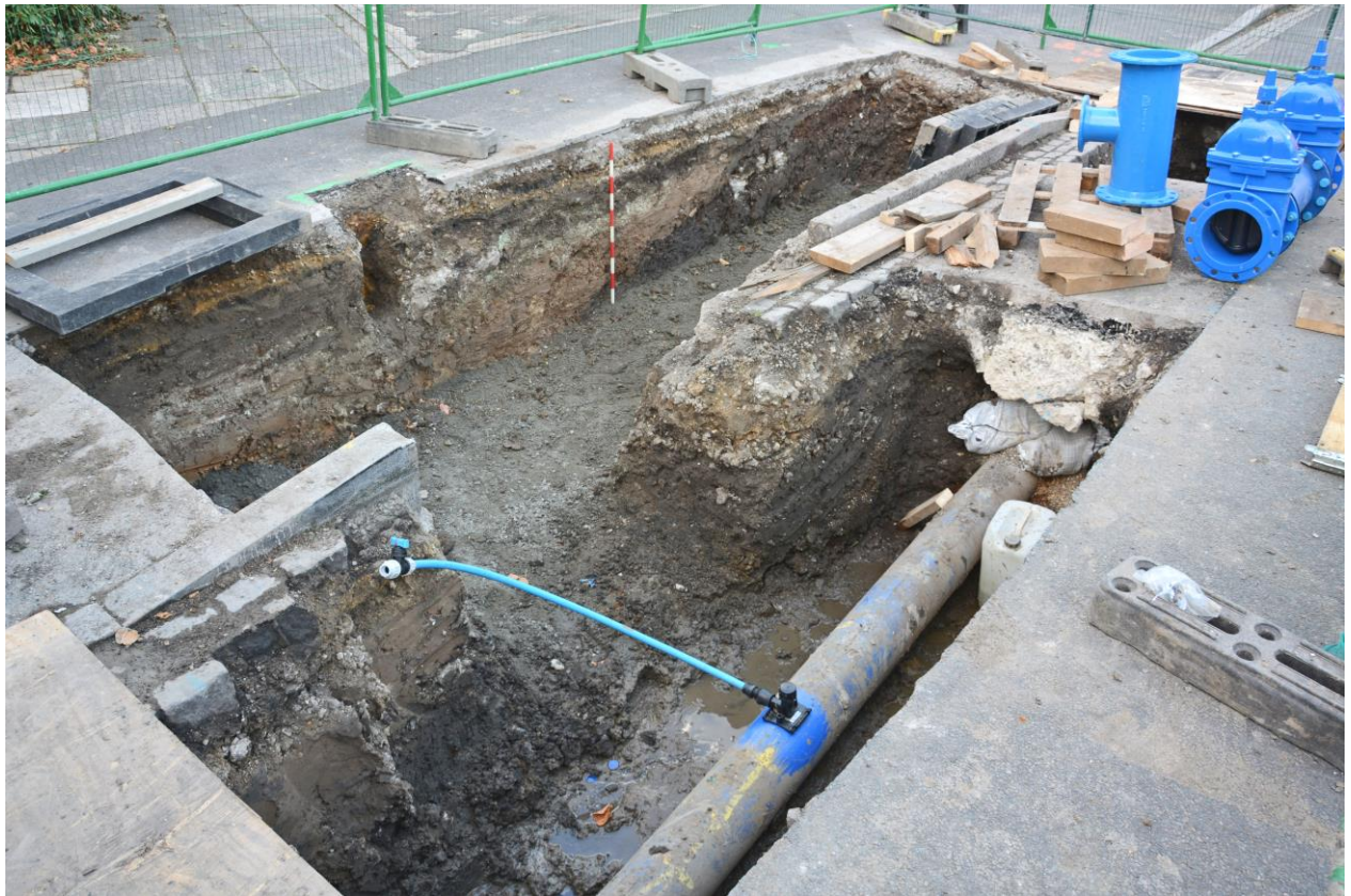
Fig.2: General view of the excavated area, looking approximately southwest. The same general sequence of made ground (light brown clay over a dark silty deposit can be seen in both sections