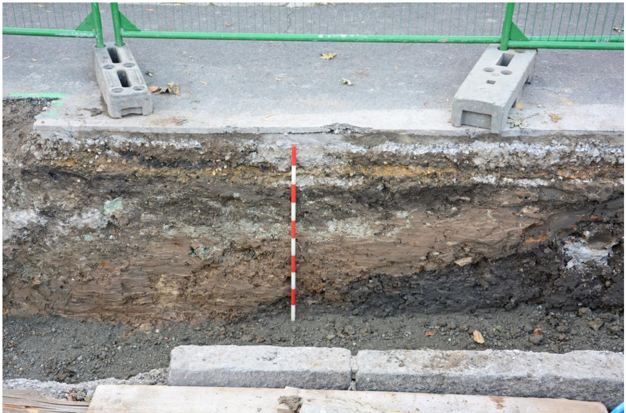
Fig.3: Detail of the southeast section of the trench showing modern ground deposits (1m scale)