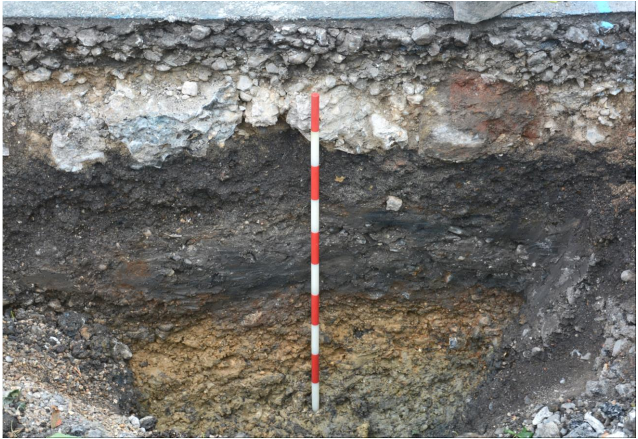
Fig.4: Detail of the northwest section of the trench showing natural silty gravel overlain by (1m scale)