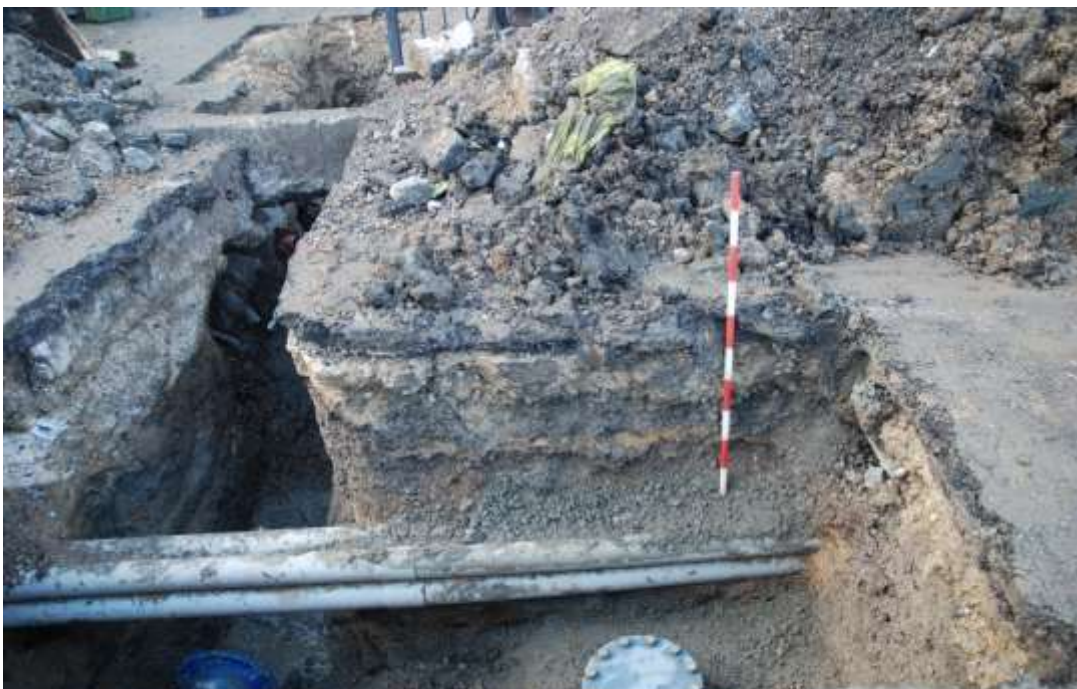
Figure 3: Southern trench - east facing section showing made ground and backfill surrounding existing services. Facing W. Scale 1m.