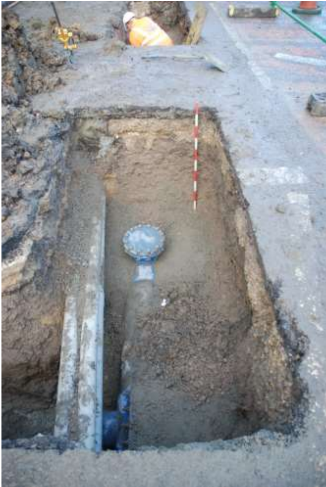
Figure 2: Southern trench - backfill (4) surrounding services below road make-up. Facing N. Scale 1m.