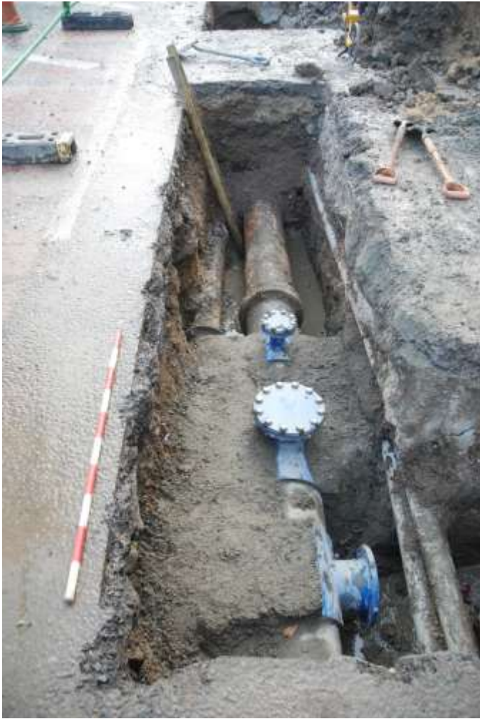
Figure 4: Northern trench - partially excavated backfill beneath asphalt and bedding concrete. Facing S. Scale 1m.