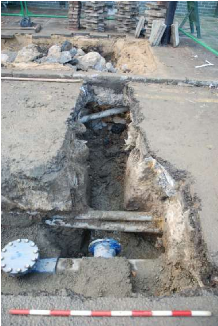
Figure 5: Northern trench - backfill and concrete. A gravel filled void can be seen on the north (right) section. Facing W. Scale 1m.