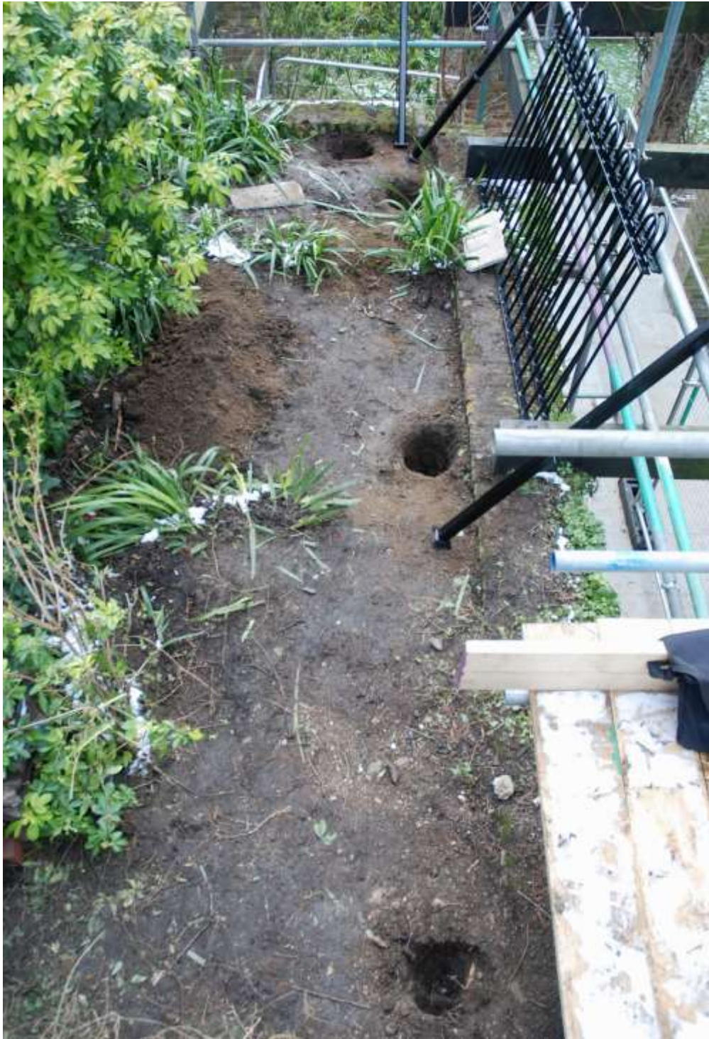
Fig.3: View looking south at the western end of the excavated area: pits 5 to 8 (in foreground)