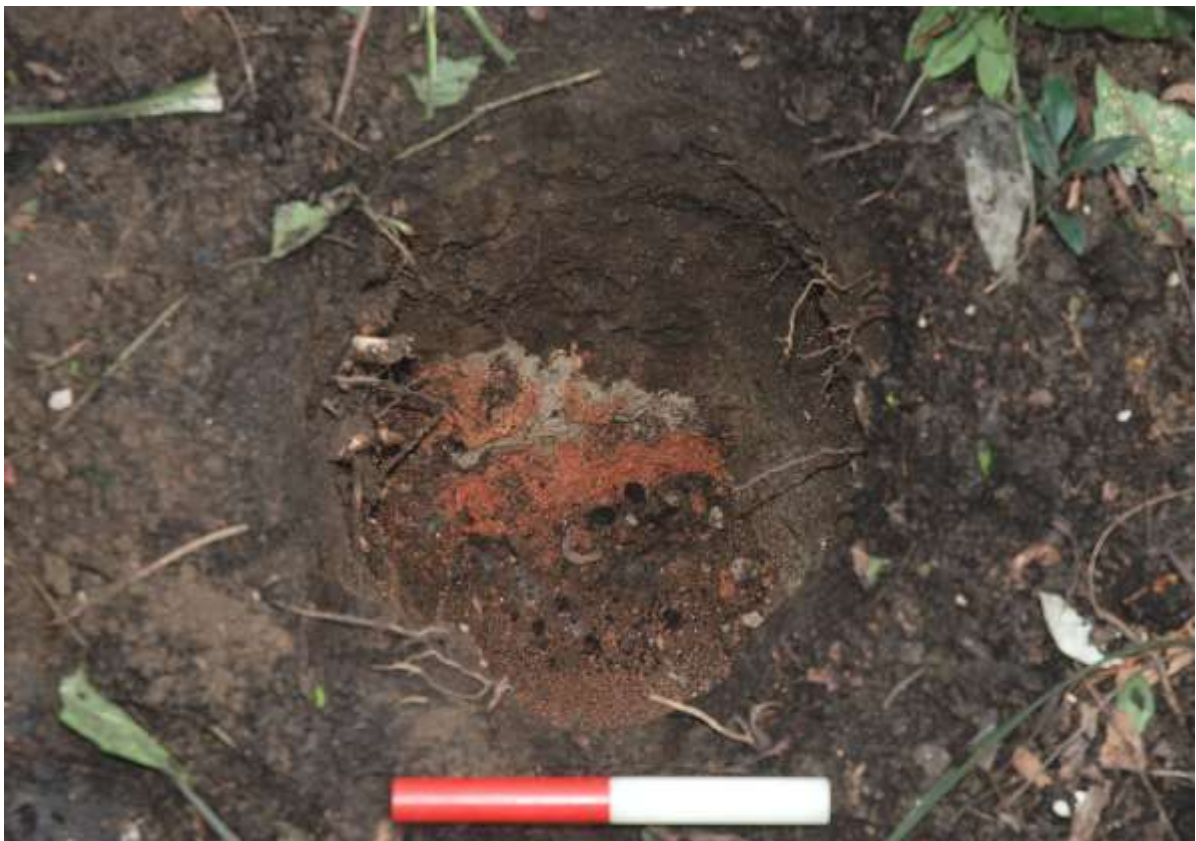
Fig.5: Pit 3, looking south and exposing a small section of modern brickwork at the rear of the east-west retaining wall . 0.20m scale