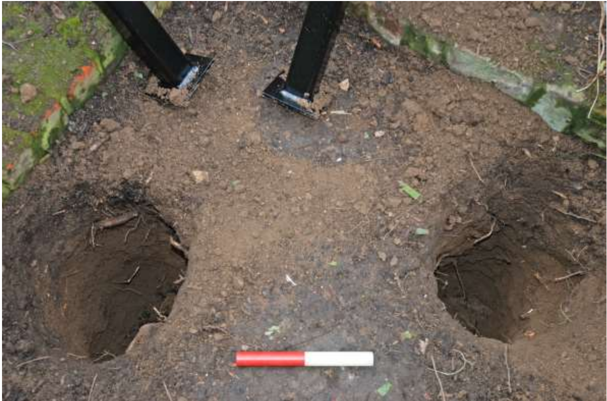
Fig.4: Pits 5 & 6 at the corner of the new railing, looking southwest. 0.20m scale