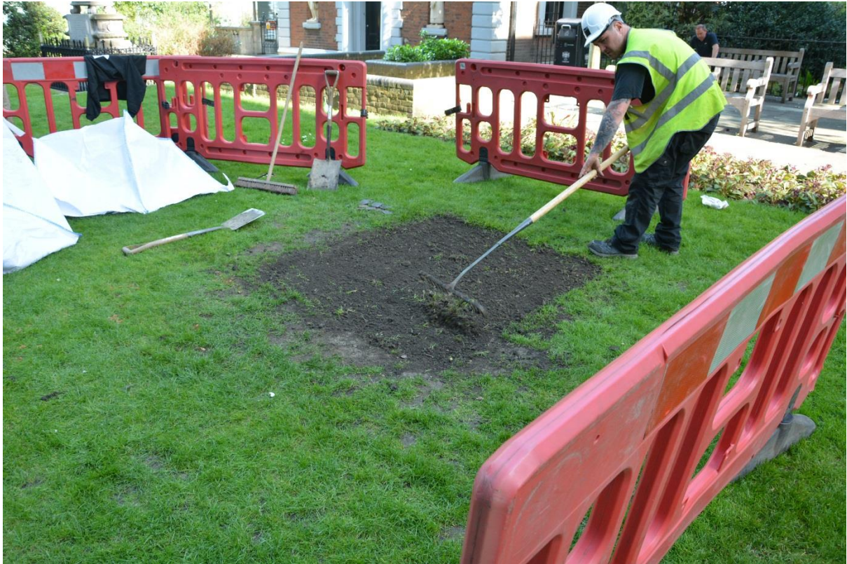
Fig.5: Backfilling and making good, facing NW