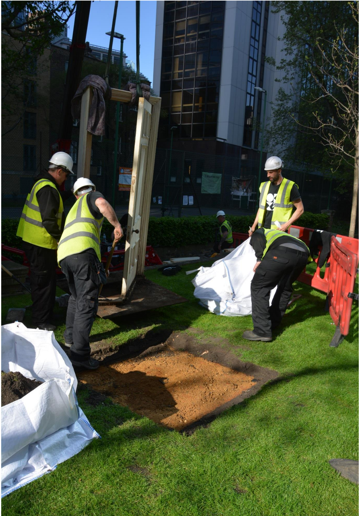
Fig.4: Exposed sand and shingle base below sculpture