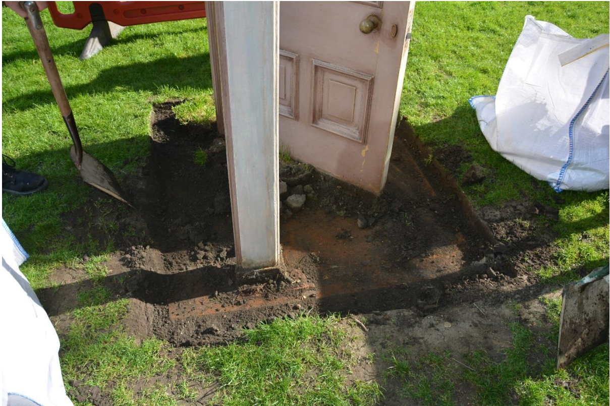
Fig.3: Exposing the base-plate of the sculpture ready for lifting, facing N