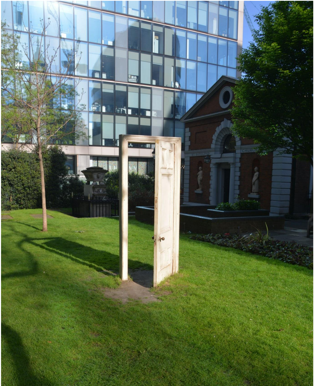
Fig.2: 'Ajar' facing NW