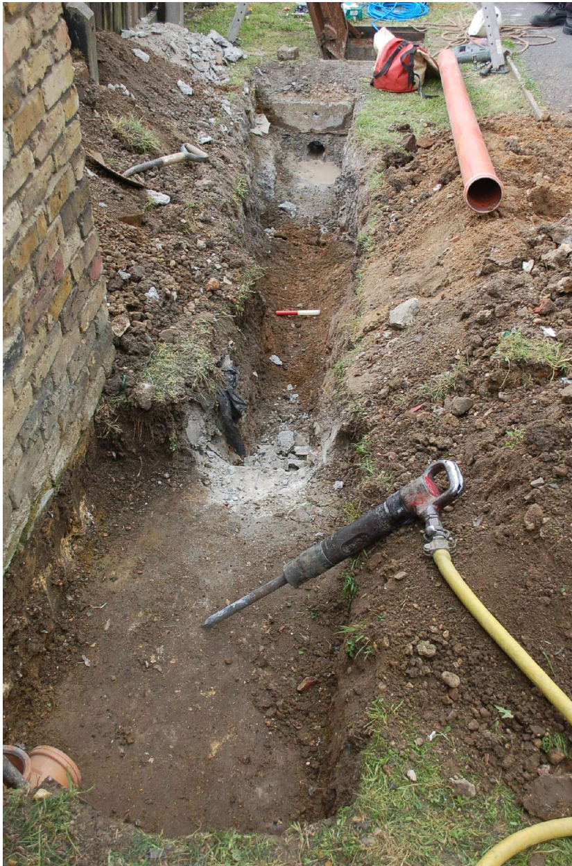
Figure 2 View along the trench during excavation, looking west towards Brixton Road.

Solid concrete can be seen in the foreground and at the far end of the trench in front of the existing manhole casing. The 0.2m scale rests on top of the intermediate sandy gravel made ground