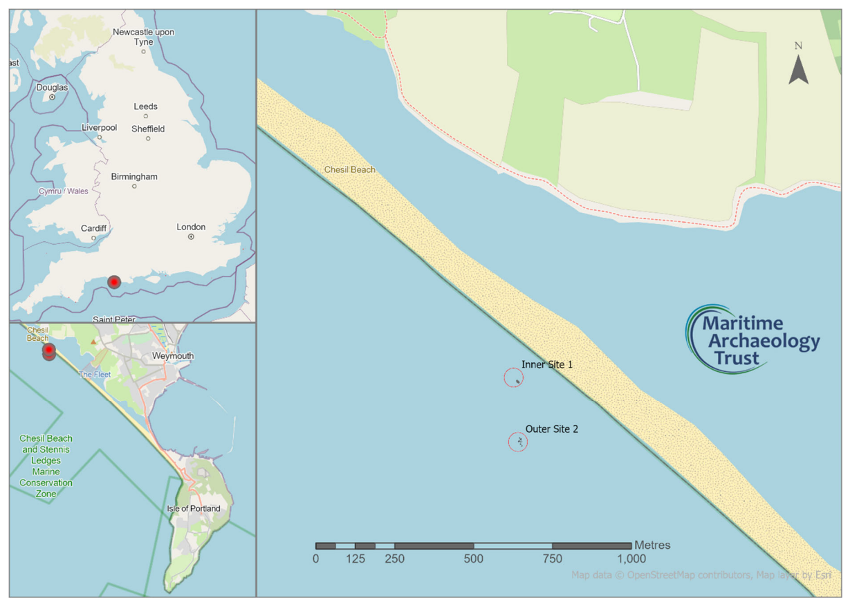
Figure 1 Location of the Chesil Protected Wreck Sites 1 and 2, with 30m radius exclusion zones (red).