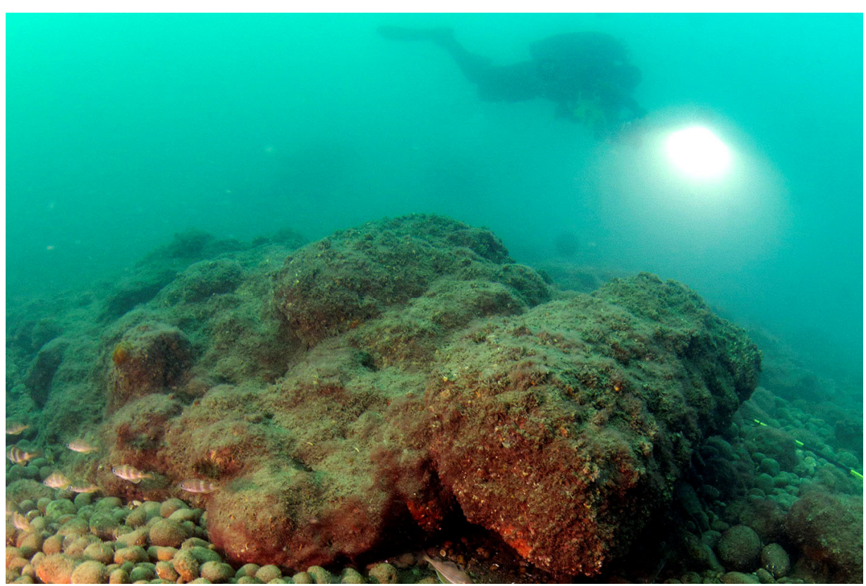
Figure 4: Mound of concreted iron shot and probably also cannon fragments, Inshore Site 1.