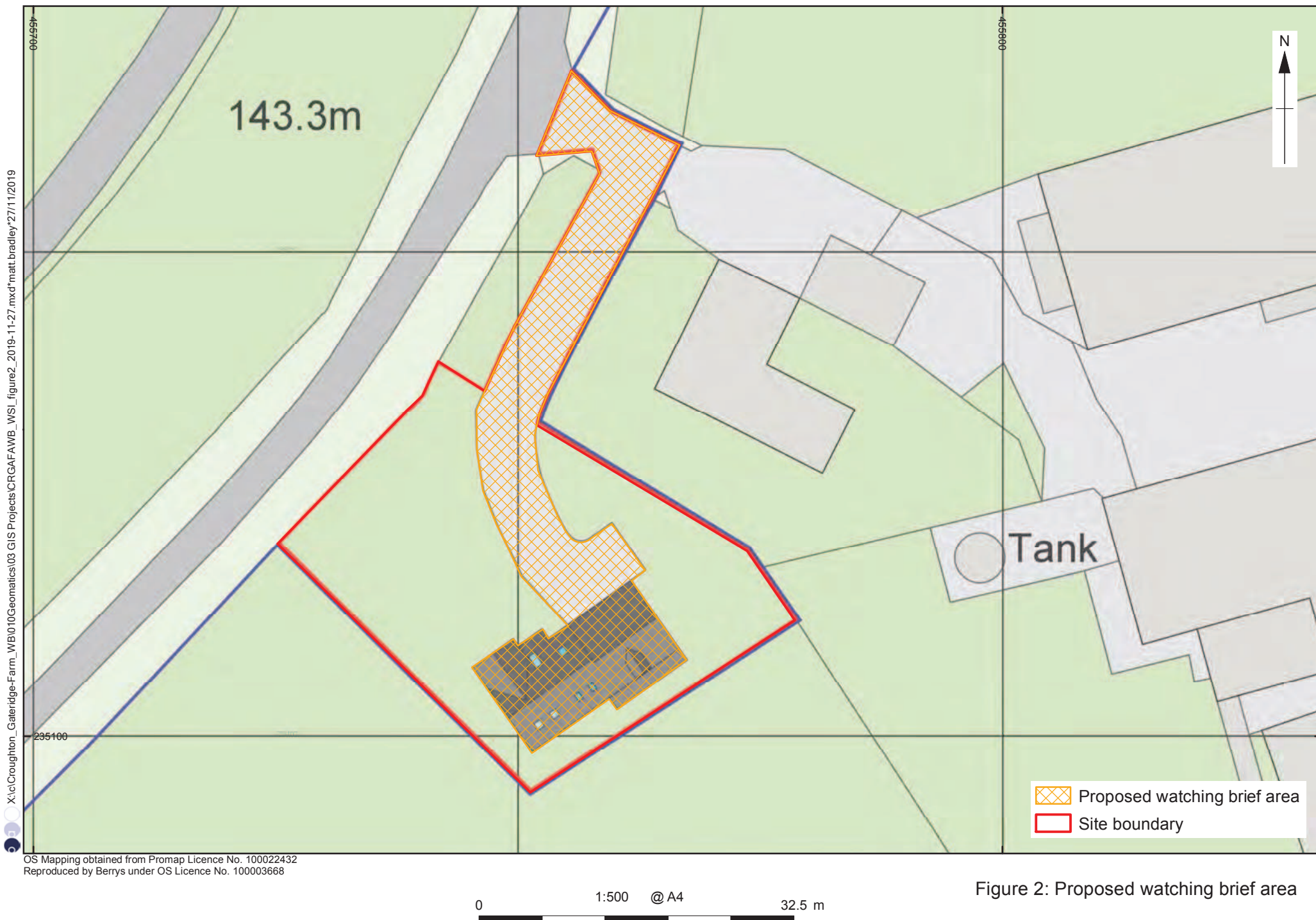
Figure 2: Proposed watching brief area