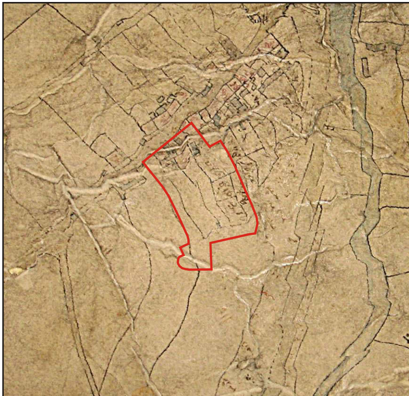
Extract from the 1841 Okehampton Tithe Map