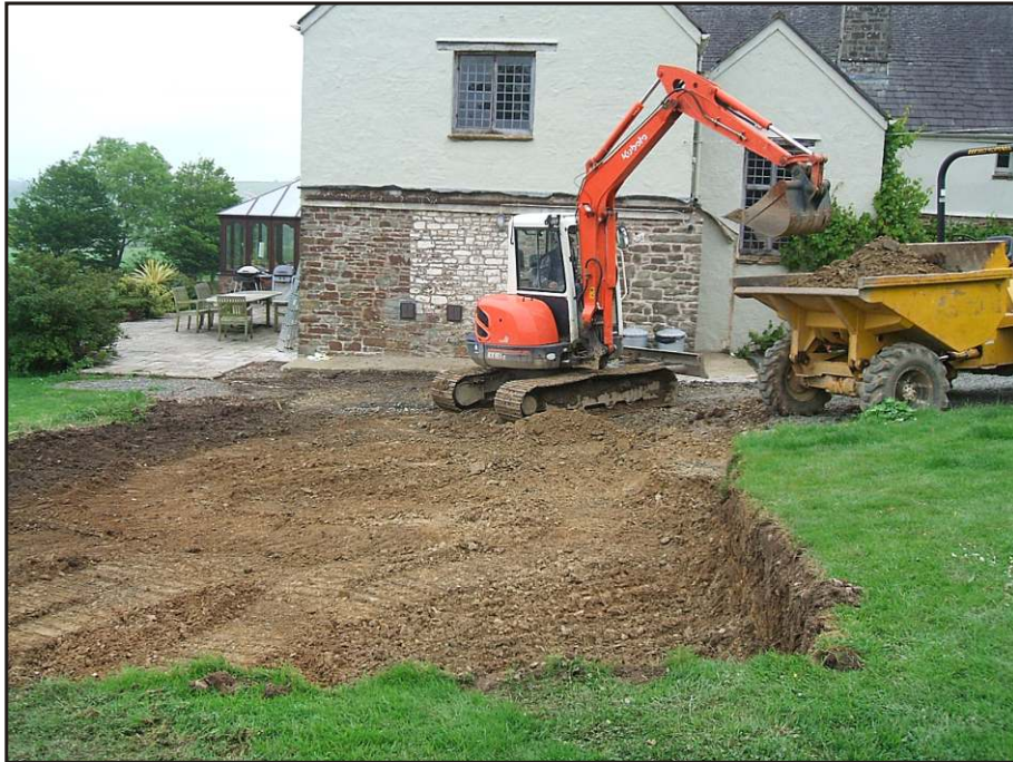
Plate 1 The trench during excavation. View to east.