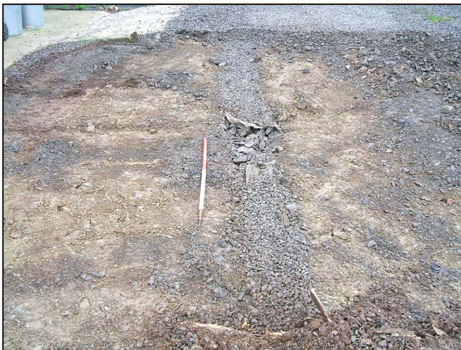
Plate 2 The eastern part of site showing north-south aligned pipe trench. View to south.