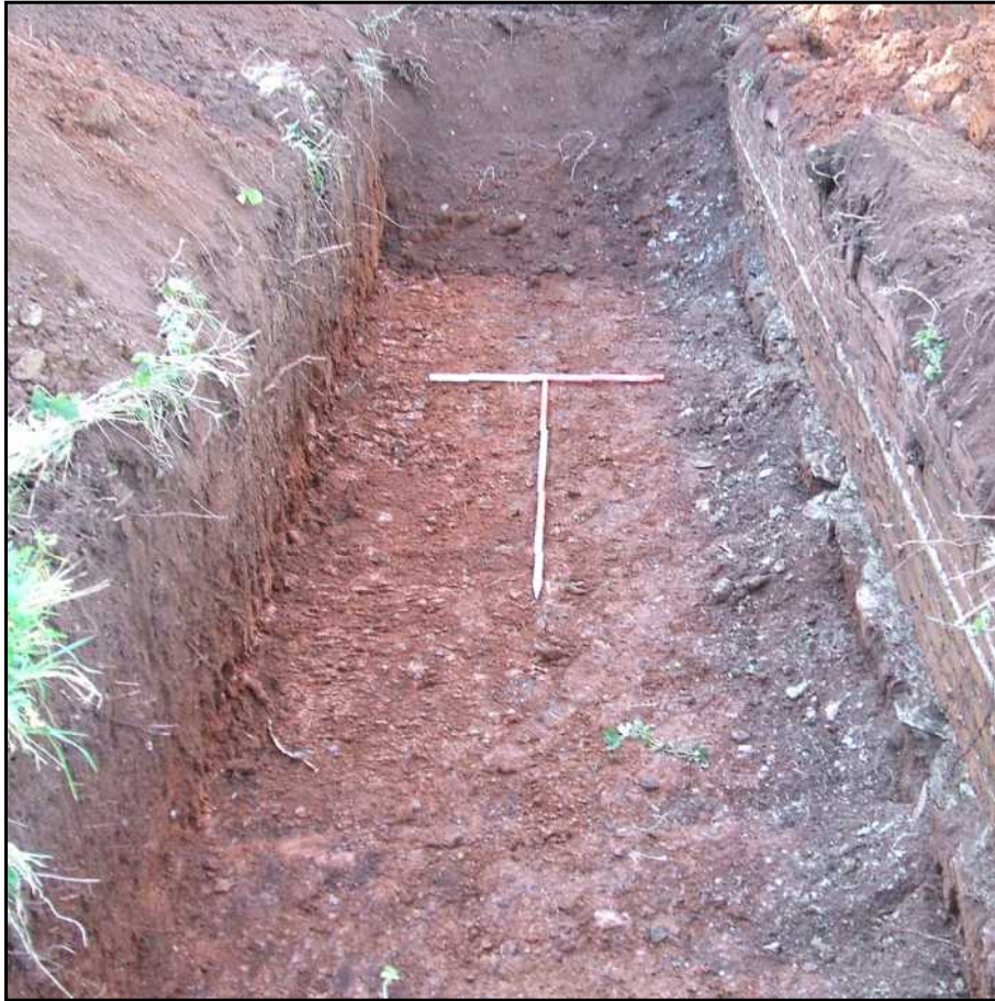
Plate 1 General view of Trench 1, looking south-west.