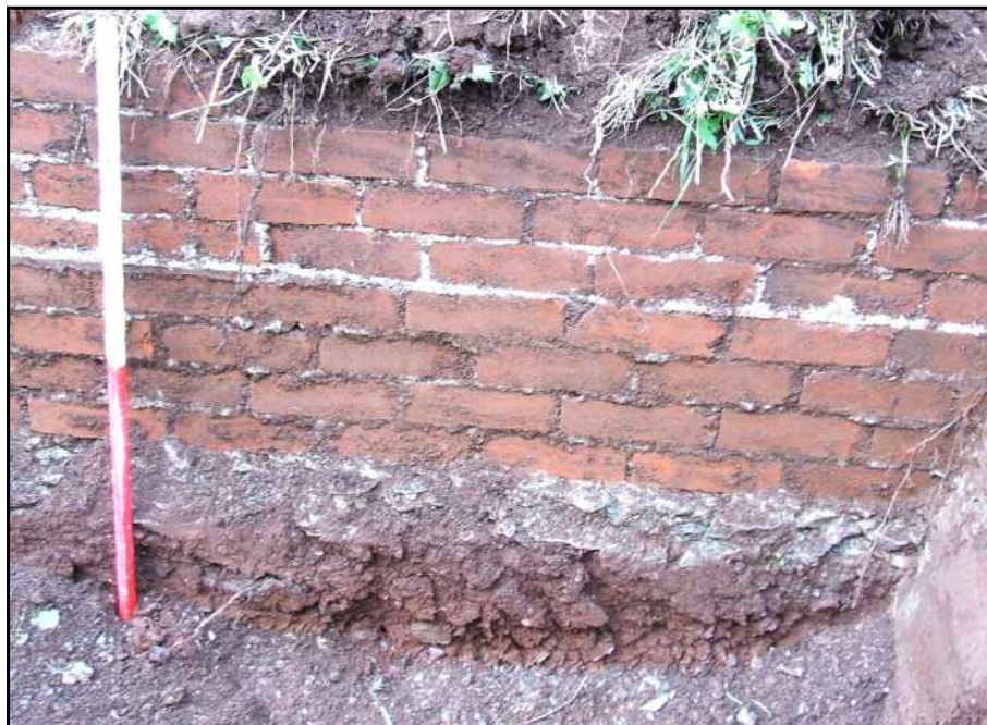
Plate 2 General view of 20th-century greenhouse foundations, looking north-west.