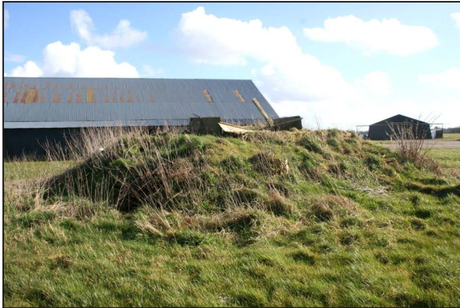
Plate 1 View of the shelter showing blast mound, looking east.