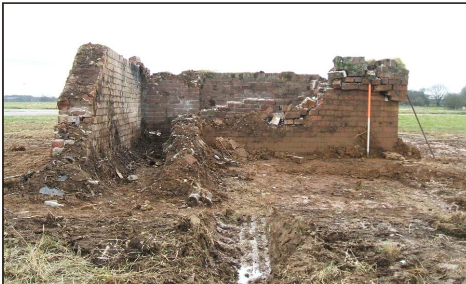
Plate 2 The north elevation of the shelter showing interior wall, looking south. 1m scale.