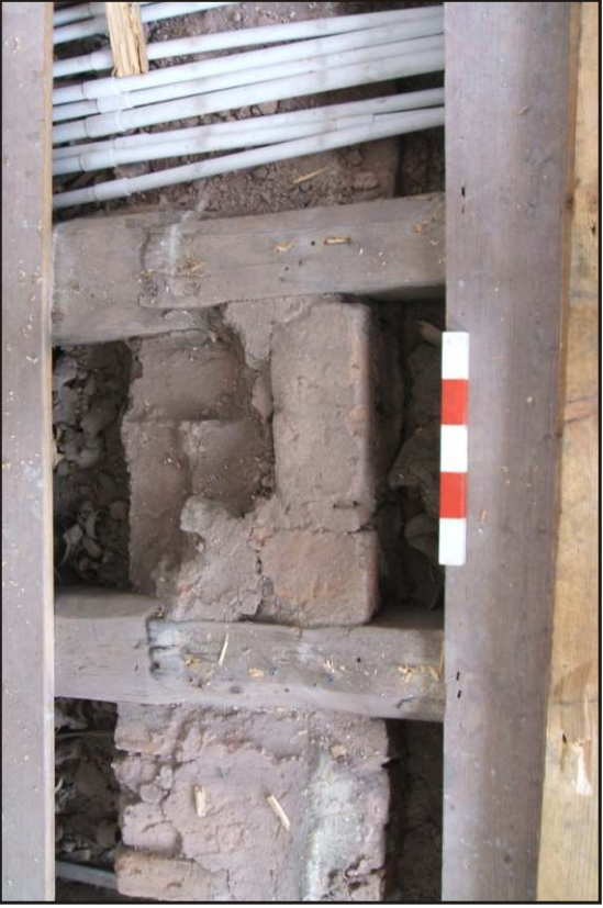
Plate 5 Detail of top of rear wall and scarfed joists in the Long Room. Looking north (scale 0.25m)