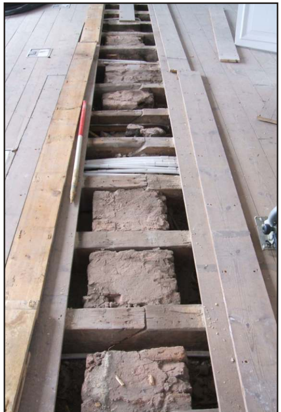
Plate 4 Top of rear wall of ground-floor arcade and scarfed joists exposed in the Long Room. Looking west (scale 1m)