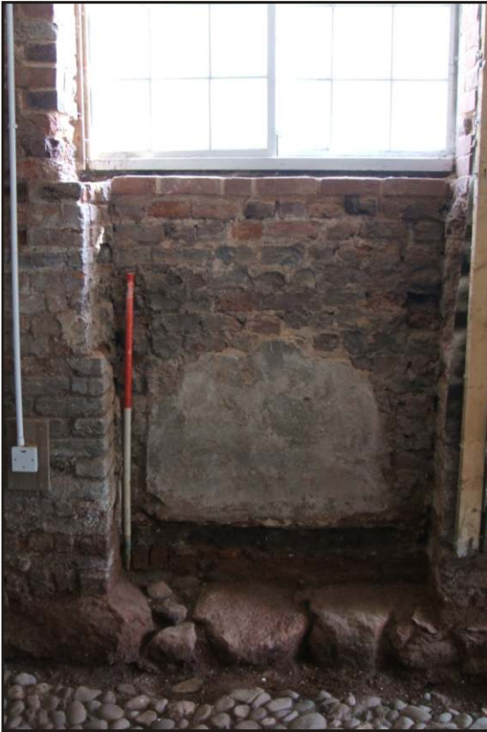
Plate 9 Detail of internal elevation of east wall of Wharfinger's House showing blocked doorway (5038). Looking east (scale 1m).