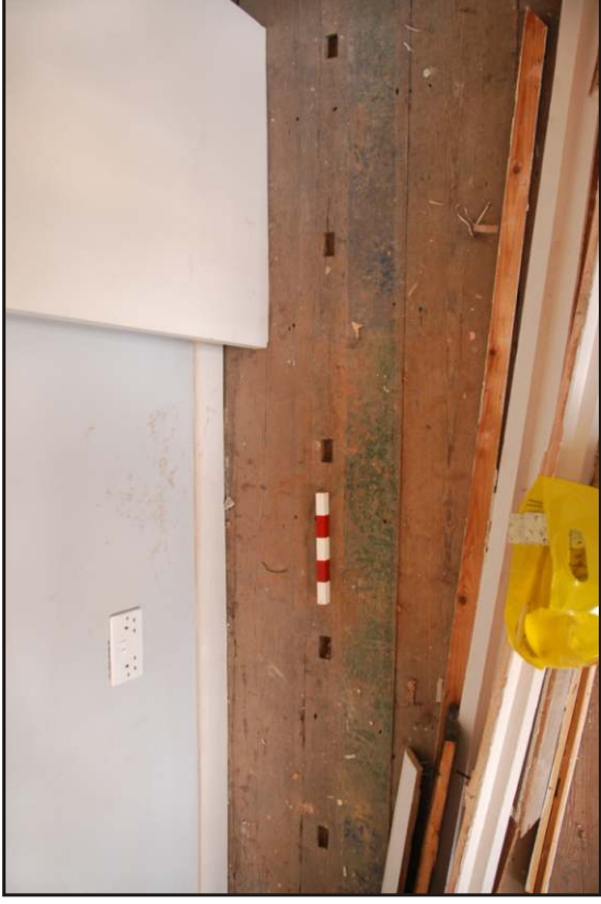
Plate 6 Detail of sockets of former stud wall in floor of the Front Office, Wharfinger's House. Looking north (scale 0.25m).