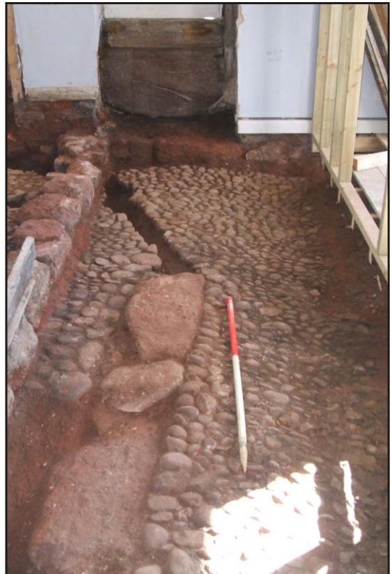
Plate 12 Heavitree breccia foundation (5021) and beam slot (5024) with dividing wall (5017) on left. Looking east (scale 1m).