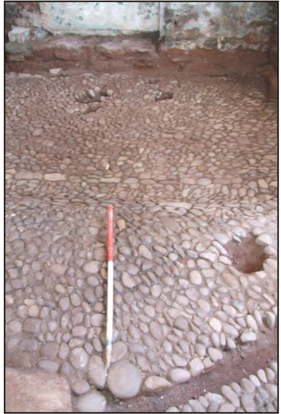
Plate 10 General view of pre-1678 quay surface (5022/3) and postholes (5008-5012). Looking north (scale 1m).