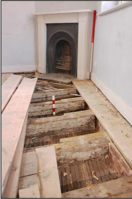
Plate 1 General view of exposed joists in the Back West Office. Looking north west (scale 1m).