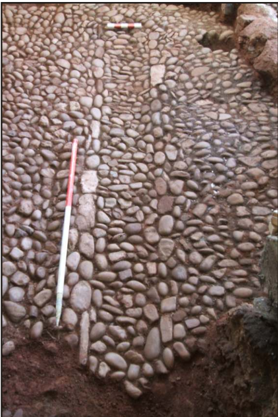
Plate 11 General view of drain in cobbled surface (5022/3). Looking east (scales 1m and 0.25m).