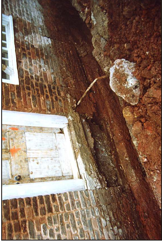
Plate 8 External elevation of the east wall of Wharfinger's House during 1991 alterations, showing a blocked doorway (5038) on right and existing doorway (5013) on left. Looking west.