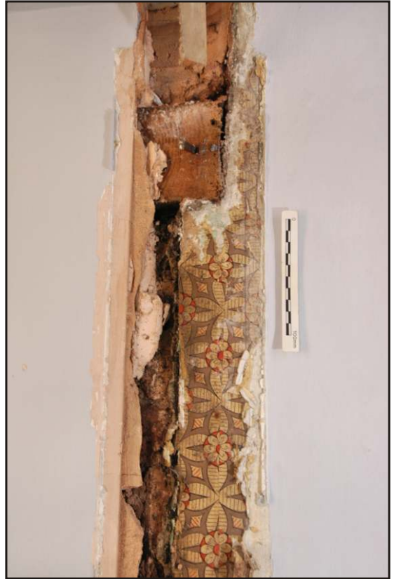
Plate 2 Detail of wallpaper and remains of lintel of former doorway in Back East Office. Looking south (scale 0.1m).