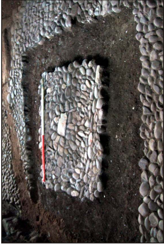
Plate 7 General view of exposed joists at the site of the disabled lift shaft in Wharfinger's House. Looking east (scale 1m).