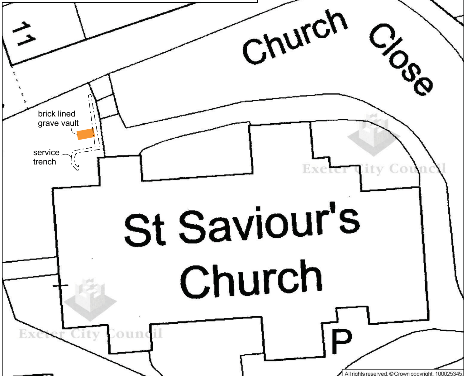
Fig. 1 Site location and plan 1:250 (1:50000 inset).